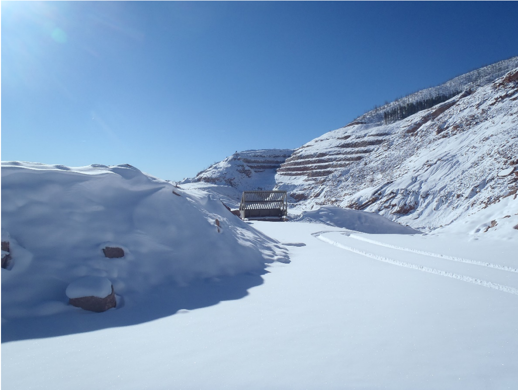
Photo 3. Unprocessed riprap stockpile & grizzly screen (north end of pit, looking south).