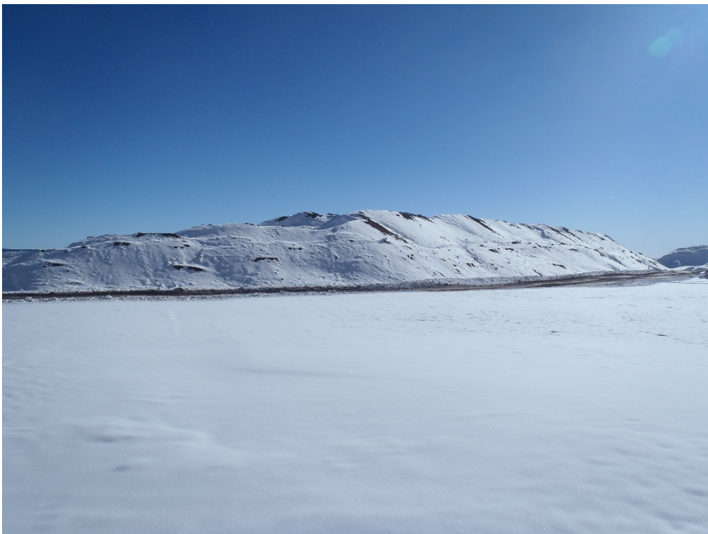
Photo 6. Largest of several growth media stockpiles (SE corner of pit floor, looking SE).