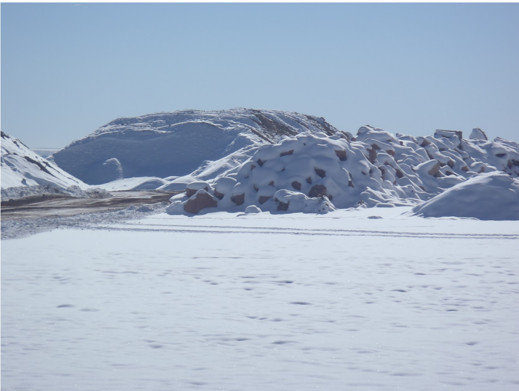
Photo 2. Processed riprap stockpile (south end of pit floor, looking SE).