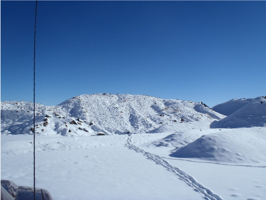
Photo 1. Recycled asphalt material stockpile near scale building (looking NE).