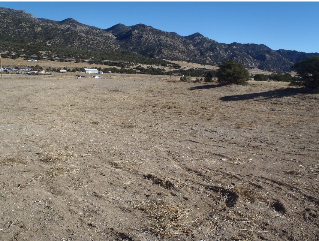
Photo 2. Reclaimed area (looking NE from the middle of the disturbance).