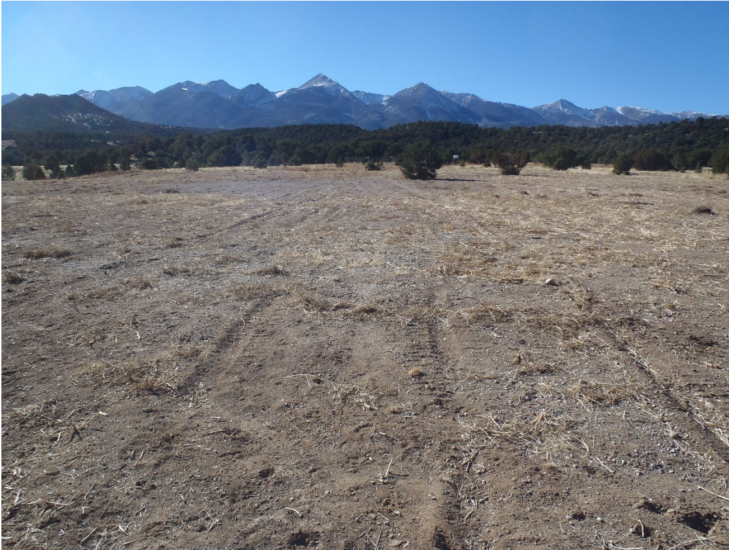
Photo 1. Reclaimed area (looking SW from the middle of the disturbance).