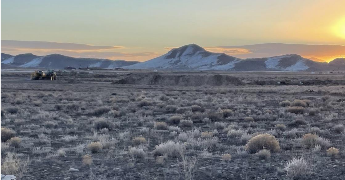
Photo 1: A photo taken by Ms. Fincham and given to the Division on February 16, 2022. The stockpiled material can be seen in the center of the photo.