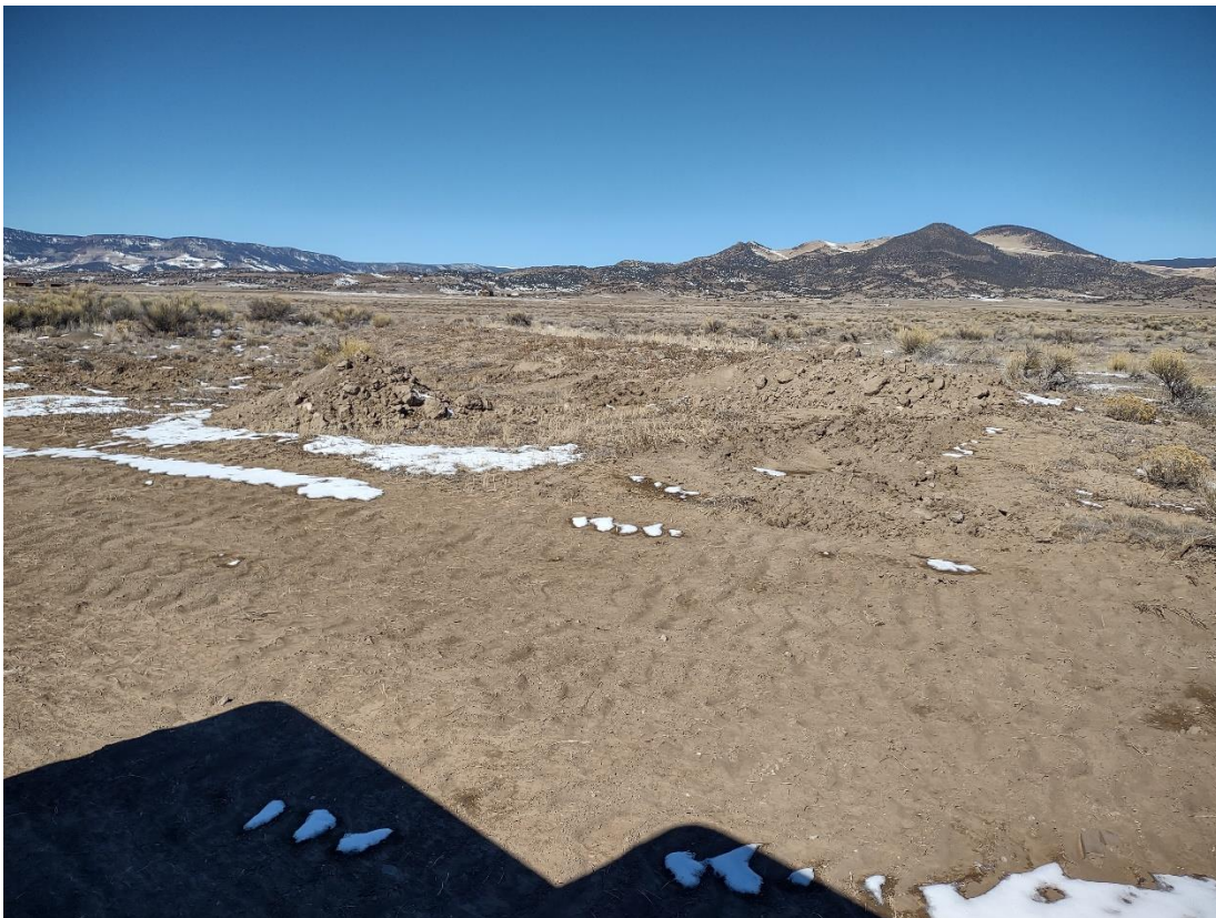
Photo 2: A portion of the remaining stockpiled material at the True Grit site.