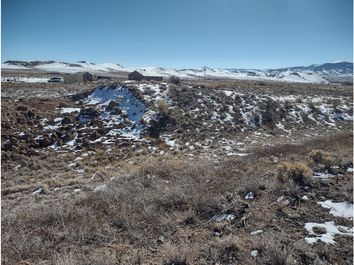
Photo 4: The remaining portion of the dirt ridge at the True Grit site, which is planned for removal.