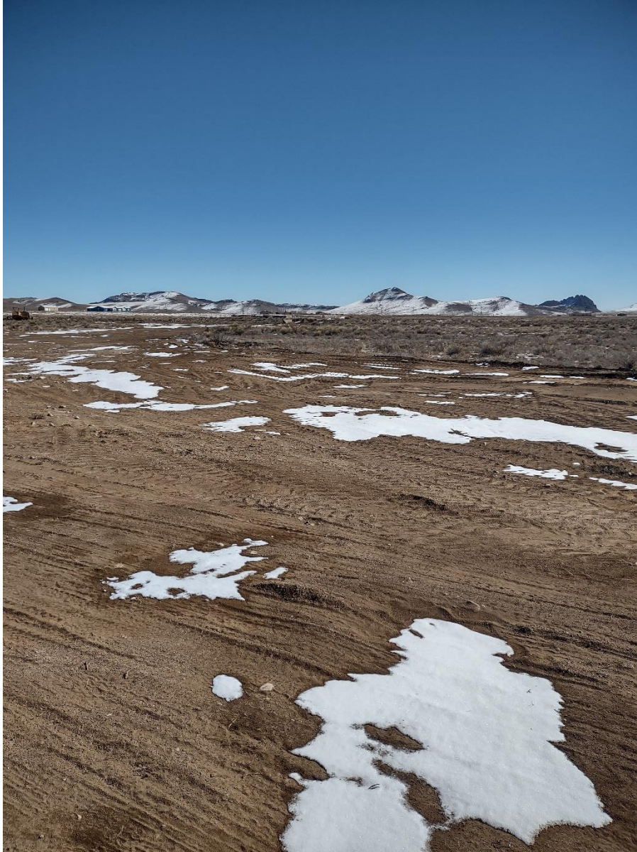
Photo 3: A section of the True Grit site where stockpiled material has been removed.