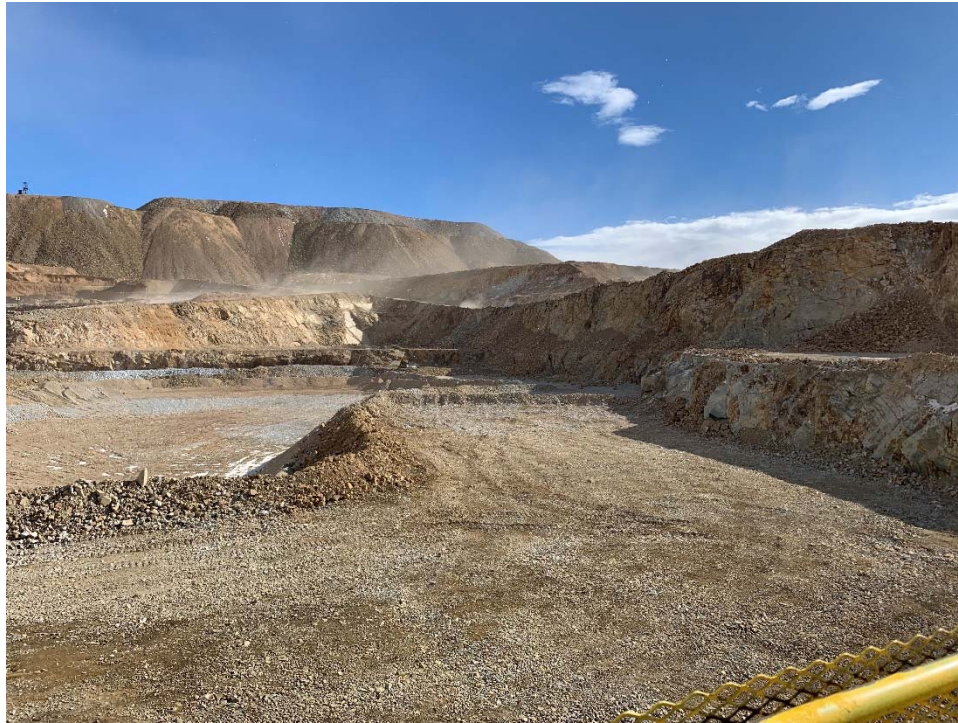
January 14, 2022 – High Compaction Backfill progress (TW)