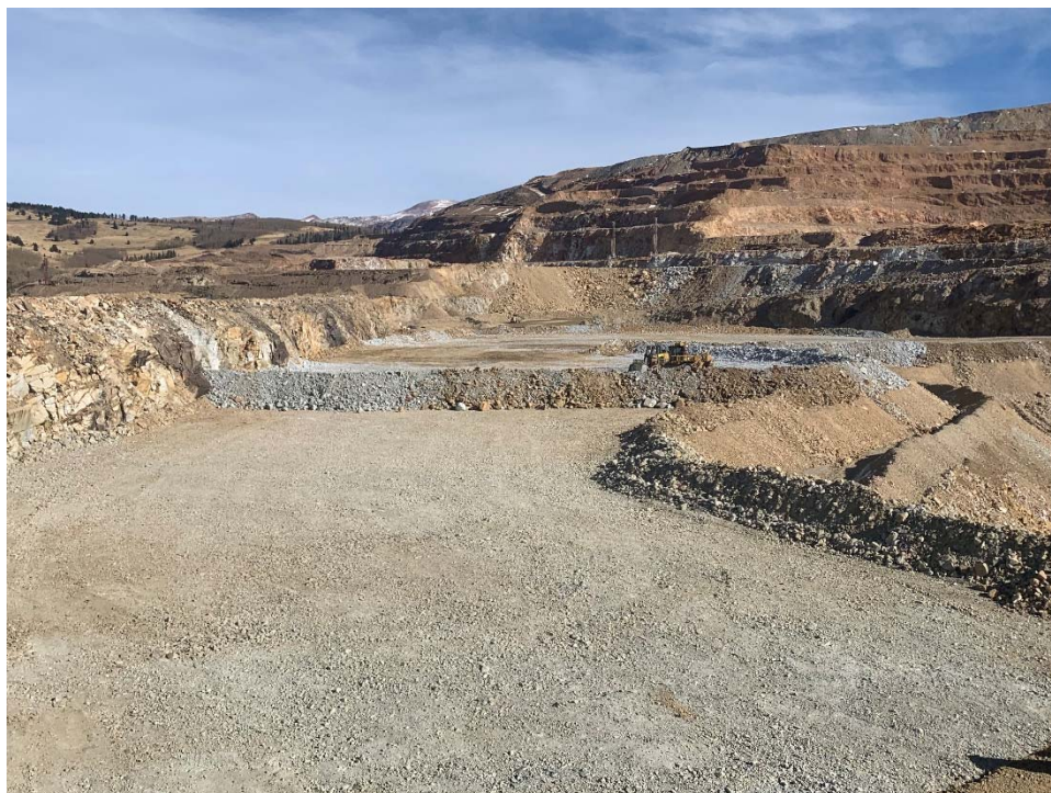
January 12, 2022 – High Compaction Backfill placement (TW)