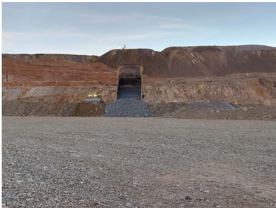
January 11, 2022 – High Compaction Backfill placement (TW)