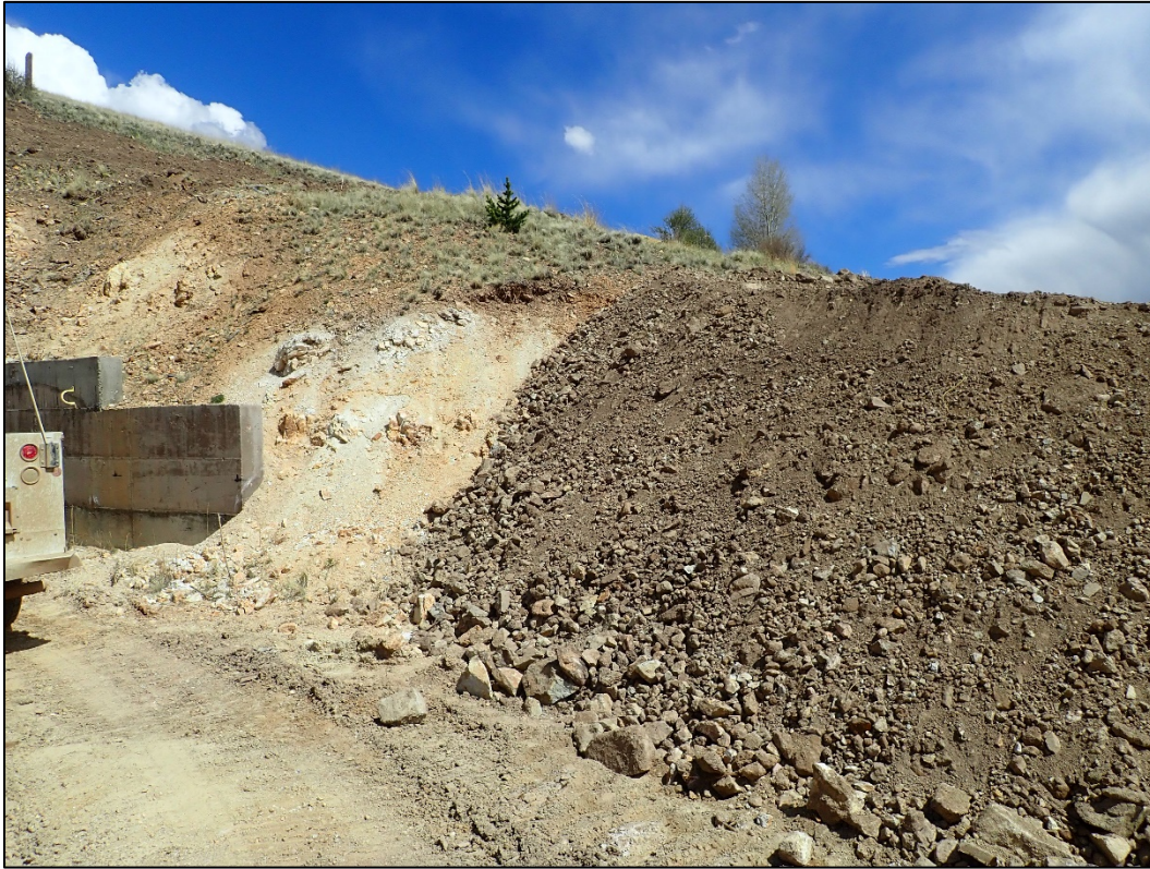
Photo 7. Backfilled area south of the Sangre de Christo Tunnel; looking southeast.