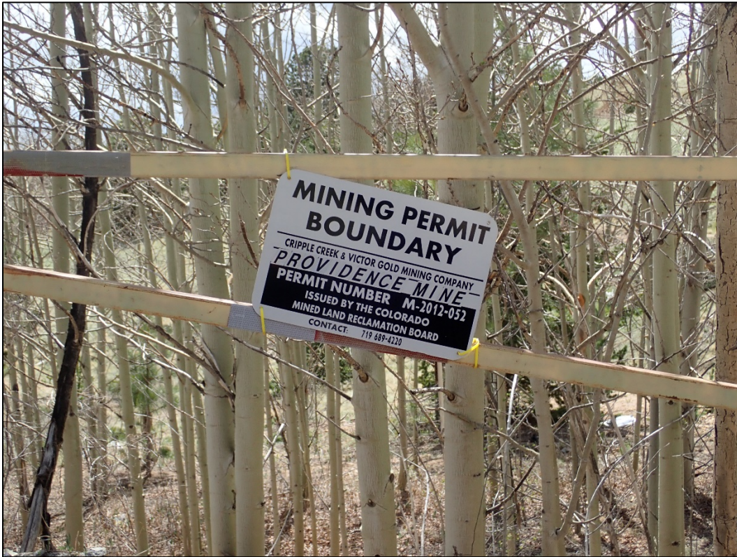
Photo 1. Mine site identification sign at the entrance to the permit boundary; looking west.