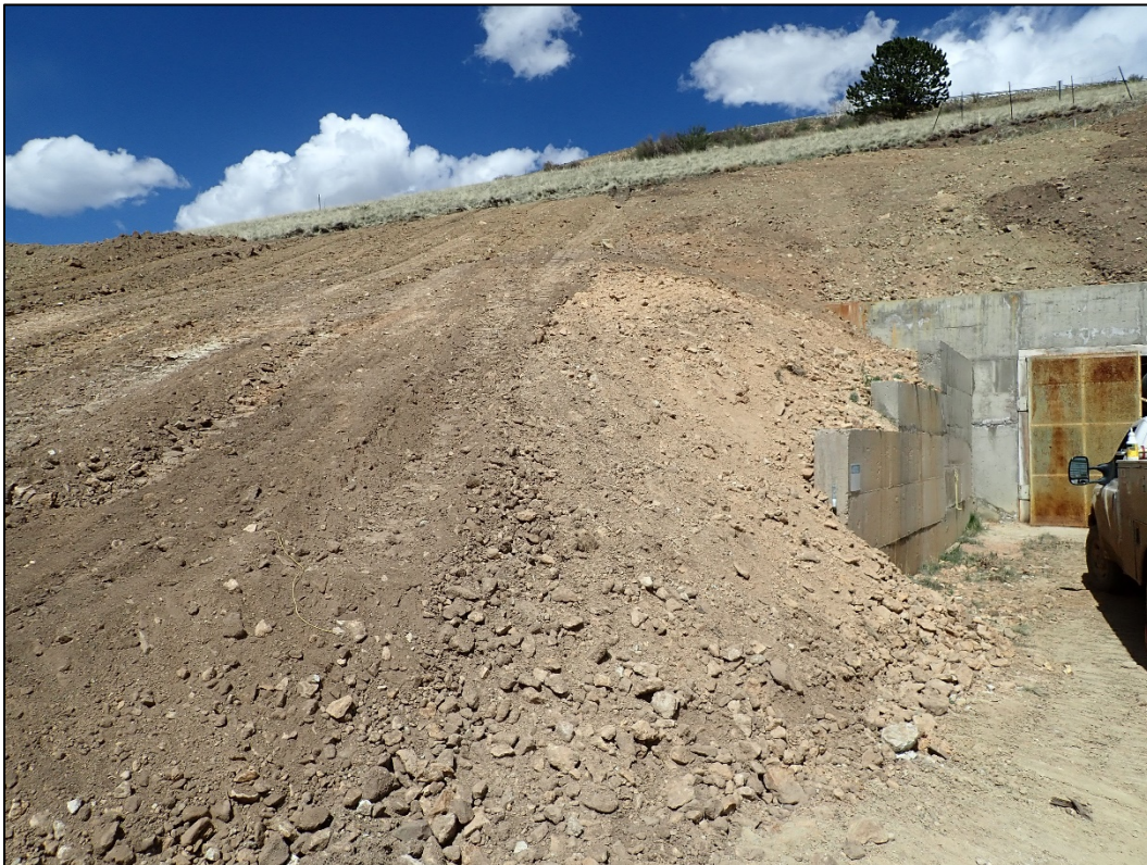
Photo 6. Graded area north of the Sangre de Cristo Tunnel; looking northeast.