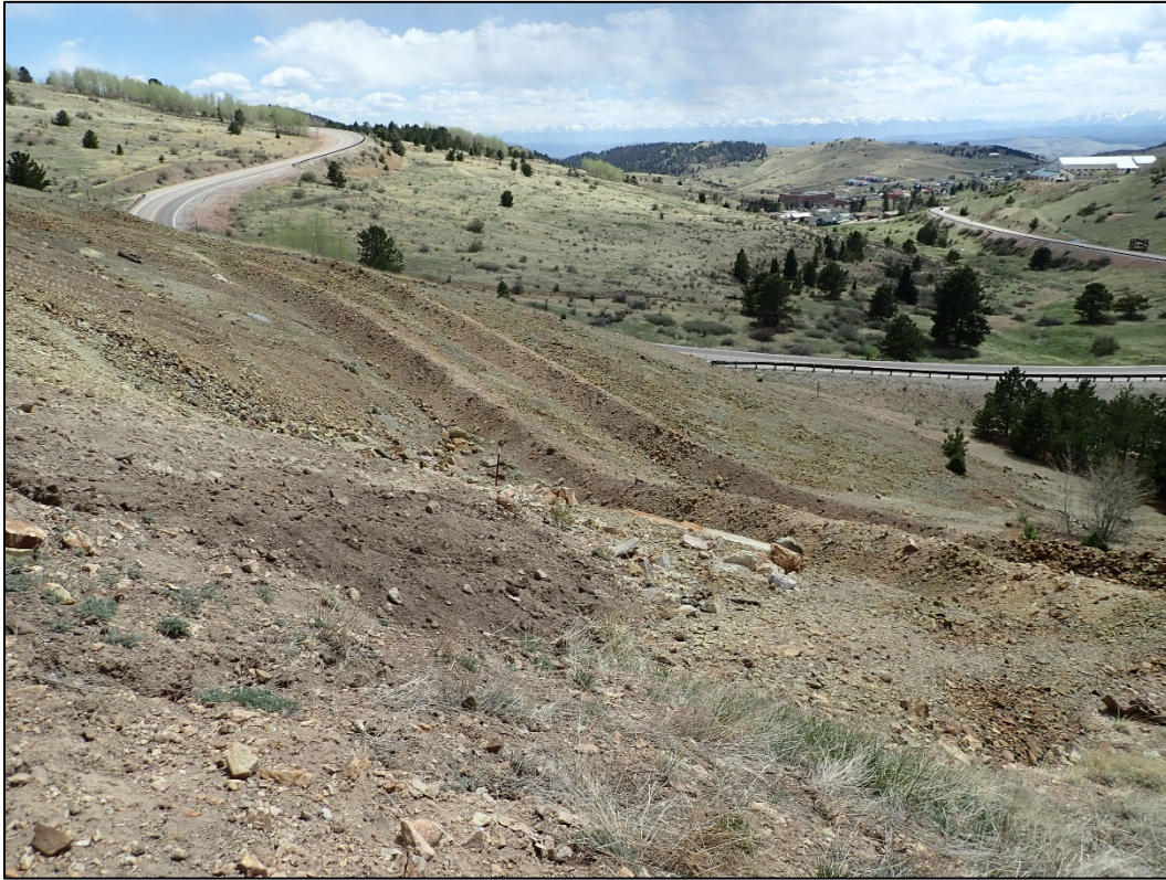
Photo 9. Silt retention trenches at the base of the waste rock dump; looking south.

Jeana Ratcliff Cripple Creek & Victor Gold Mining Company 100 N 3rd Street Victor, CO 80860