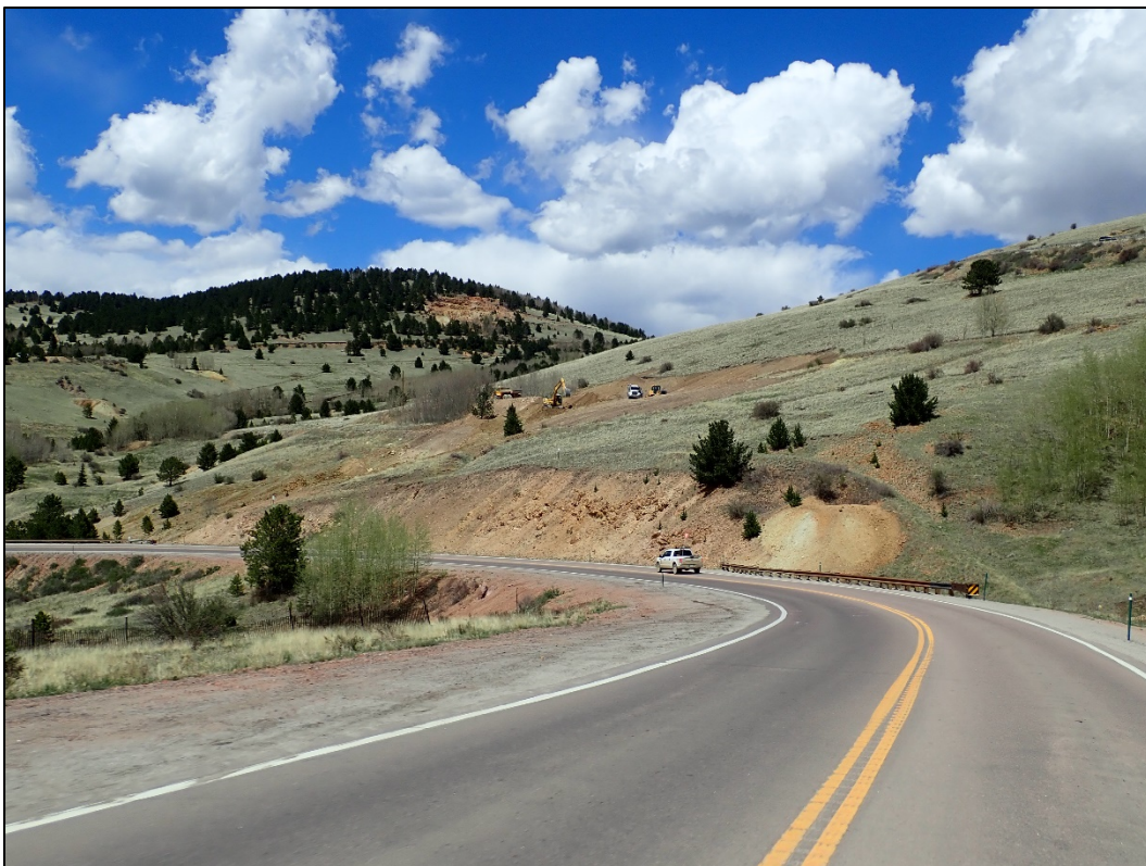
Photo 2. Site overview (Sangre de Cristo Tunnel area) from Highway 67; looking north.