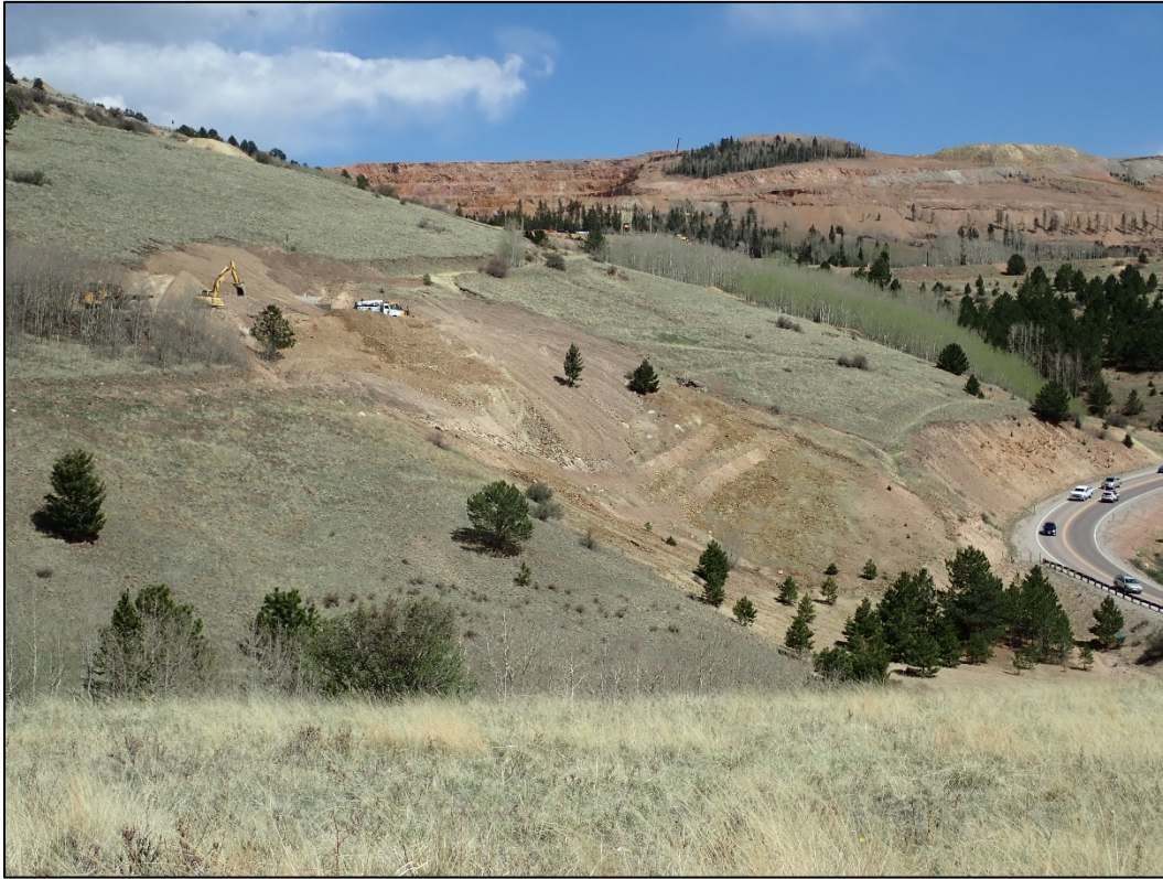
Photo 5. Site overview (Sangre de Cristo Tunnel area) from access road; looking southeast.