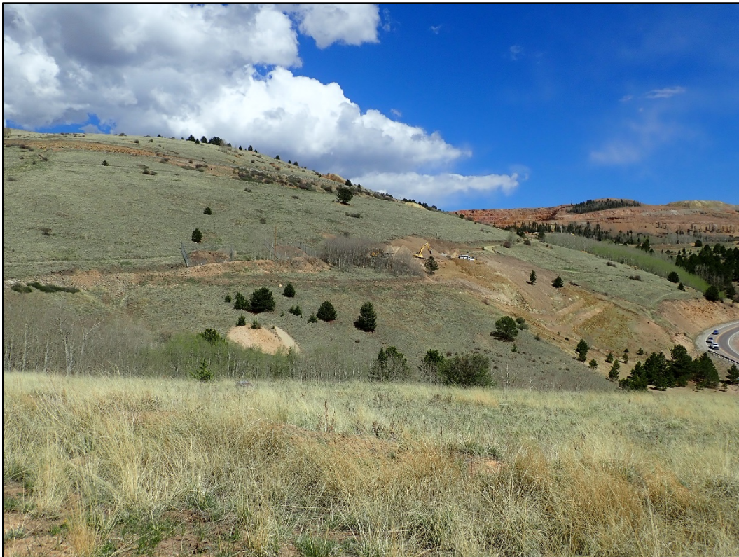
Photo 4. Site overview (Sangre de Cristo Tunnel area) from access road; looking east.