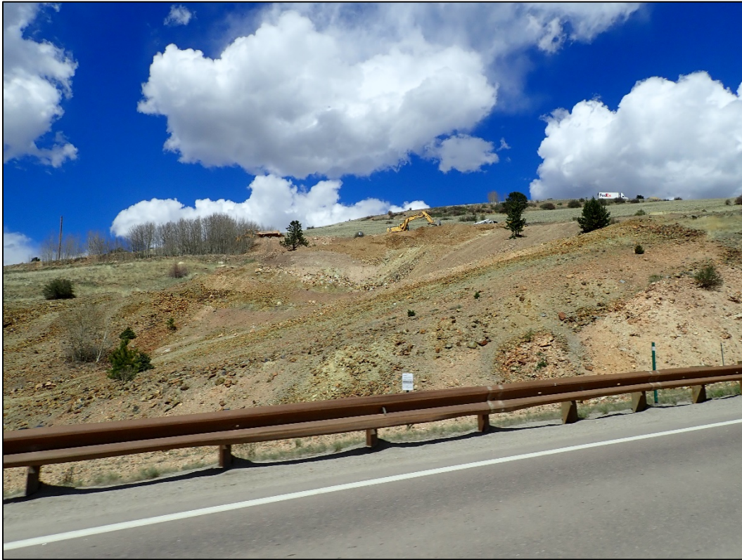
Photo 3. Site overview (Sangre de Cristo Tunnel area) from Highway 67; looking northeast.