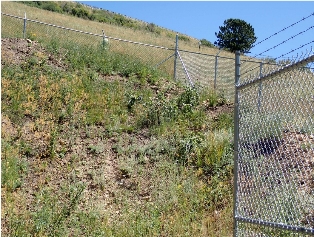
Photo 5. Musk Thistle showing signs of recent treatment; looking southeast.

Justin Bills Cripple Creek & Victor Gold Mining Company 100 N 3rd Street Victor, CO 80860