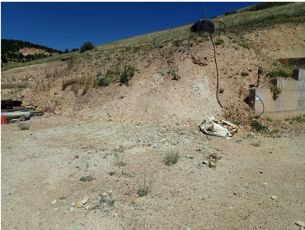
Photo 2. Sack of ore or waste rock near tunnel entrance; looking north.