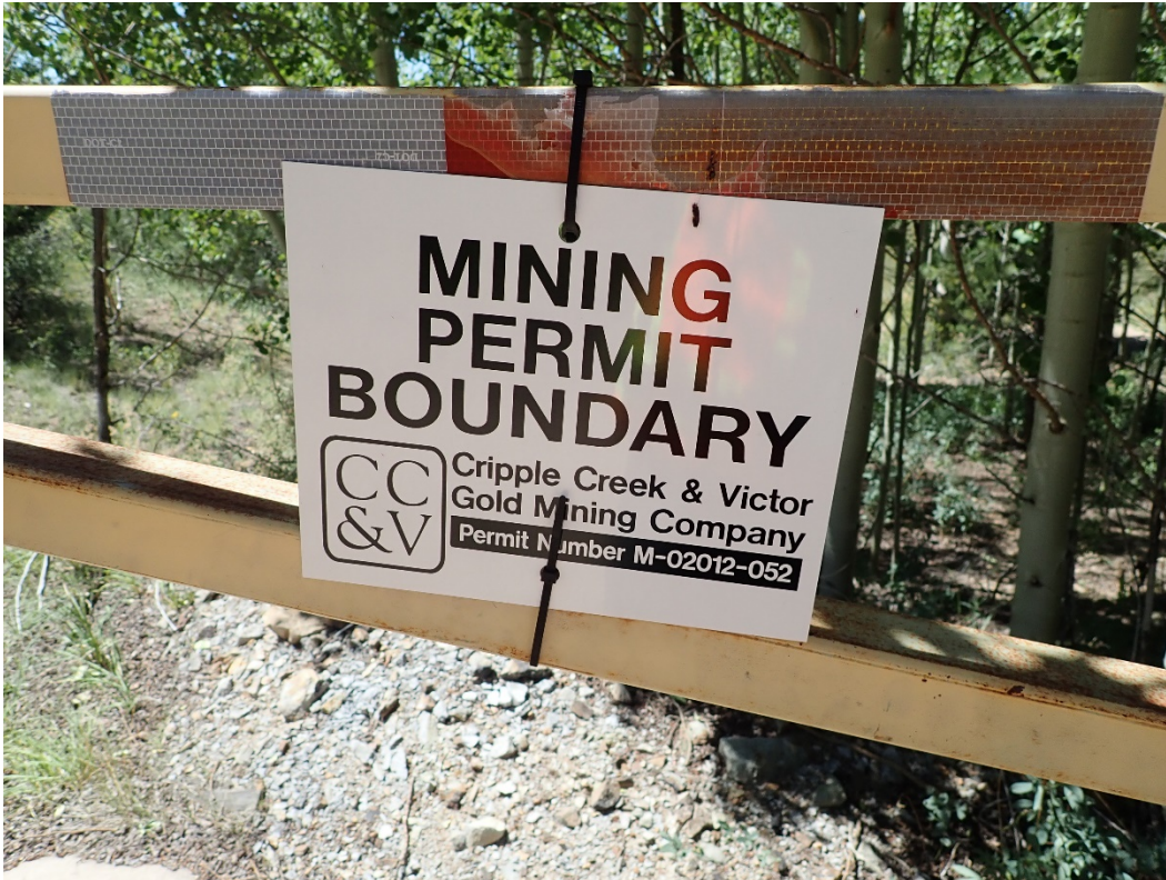
Photo 1. Mine sign with an extra "0" in the permit number; looking west.