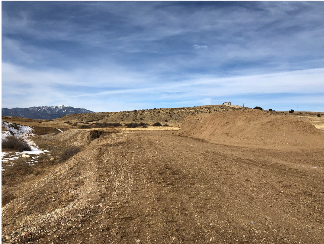
Photo 4: Looking west towards the sw permit corner note trash piles have been removed