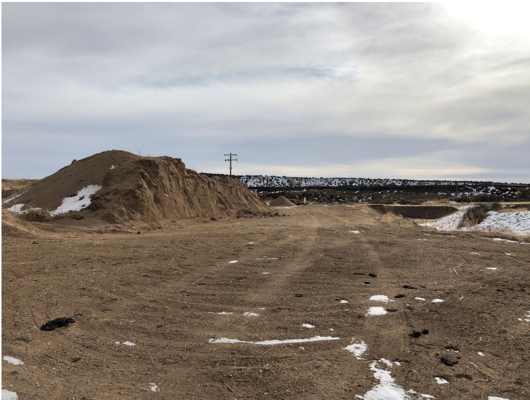
Photo 2: Looking east from the southwestern permit corner towards the mine entrance