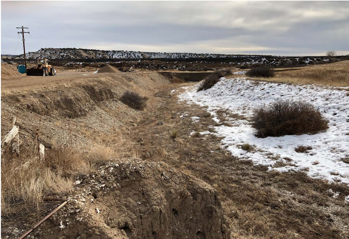
Photo 3: Looking east along the drainage where the concrete pipes were located