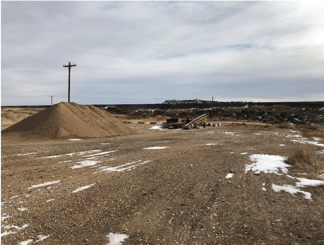
Photo 5: Old equipment has been moved towards the mine entrance and the southern permit area has been cleaned and seeded