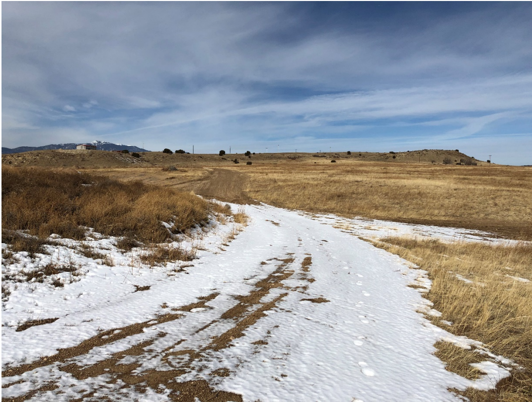
Photo 11: Looking from the NE permit corner west towards the NW permit corner