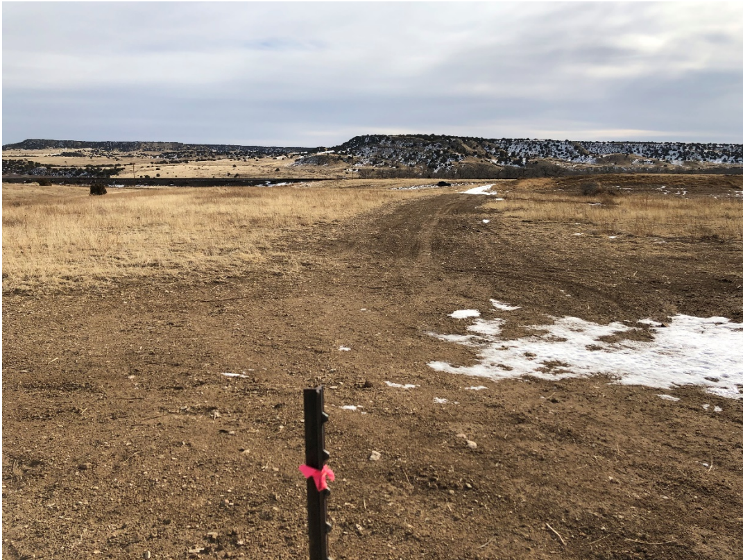
Photo 8: Looking east from the northwestern permit corner towards the northeastern corner