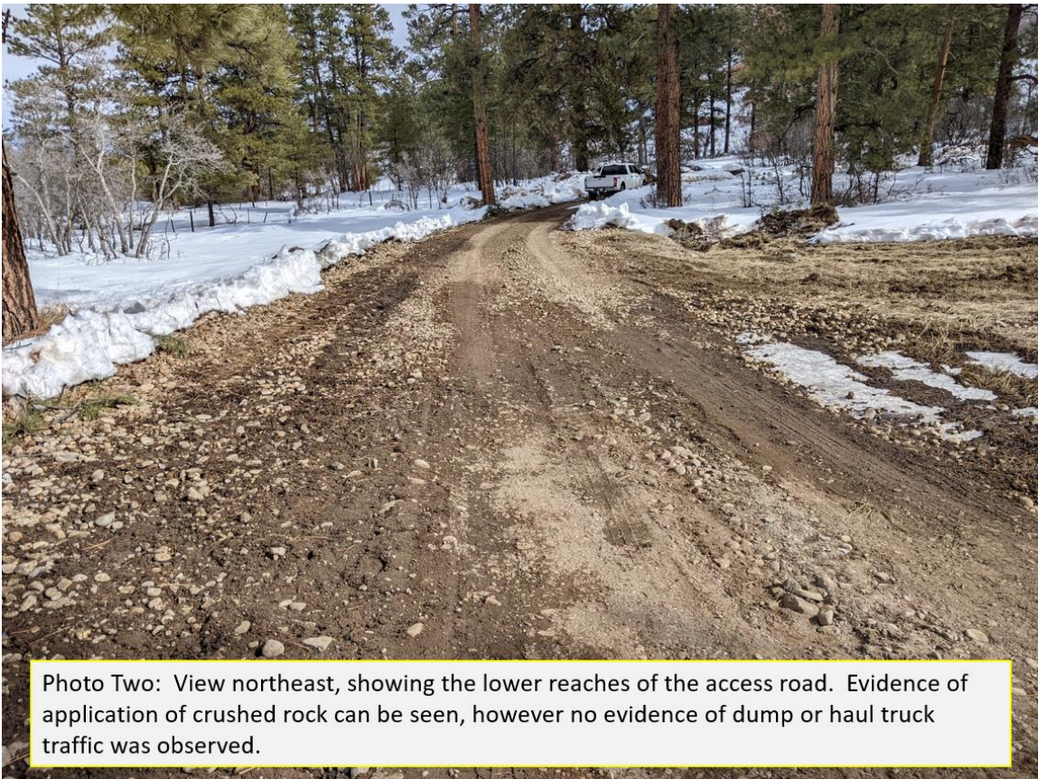
Photo Two: View northeast, showing the lower reaches of the access road. Evidence of application of crushed rock can be seen, however no evidence of dump or haul truck traffic was observed.