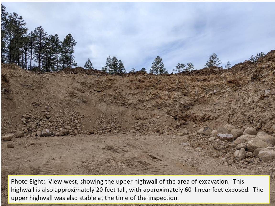
Photo Eight: View west, showing the upper highwall of the area of excavation. This highwall is also approximately 20 feet tall, with approximately 60 linear feet exposed. The upper highwall was also stable at the time of the inspection.