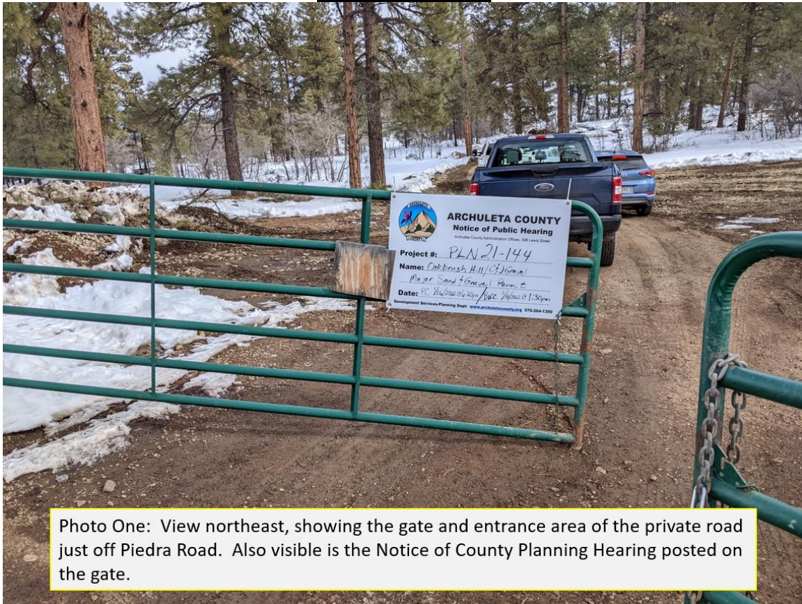
Photo One: View northeast, showing the gate and entrance area of the private road just off Piedra Road. Also visible is the Notice of County Planning Hearing posted on the gate.