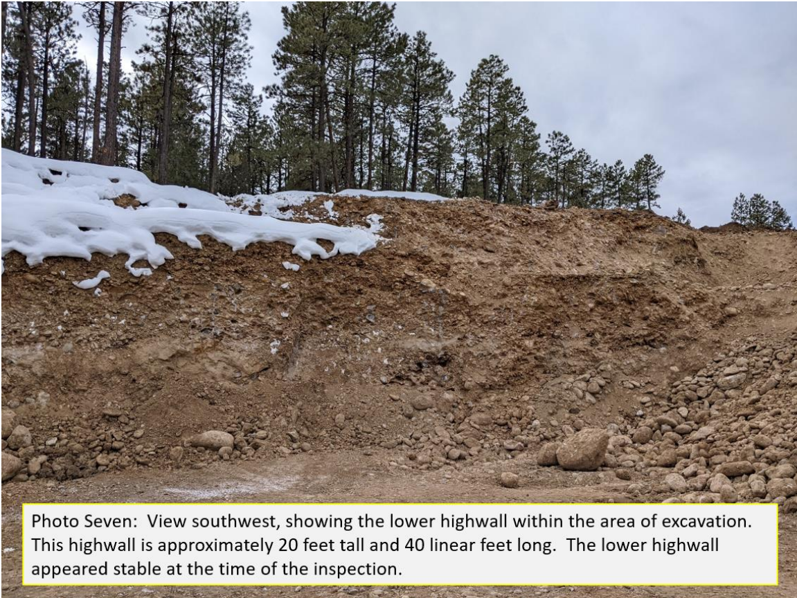
Photo Seven: View southwest, showing the lower highwall within the area of excavation. This highwall is approximately 20 feet tall and 40 linear feet long. The lower highwall appeared stable at the time of the inspection.