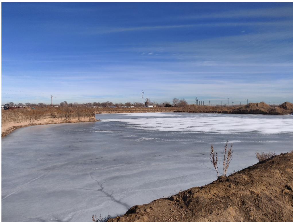
View of the north portion of Phase 1 / Pond 2 Mining Area from the oil & gas pad