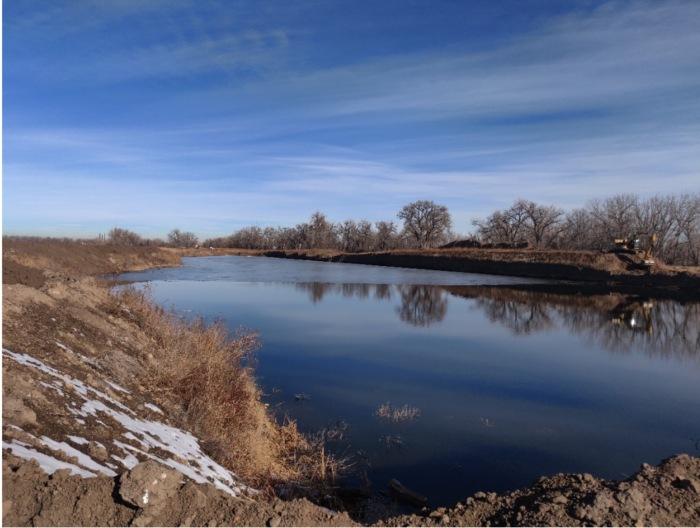
View of the Phase 2 / Mining Area 1 area from the southwest corner looking northeast