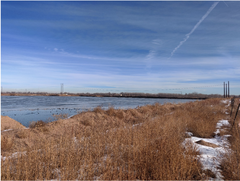
View of the Phase 2 / Pond 1 Mining Area from the southwest corner looking northeast