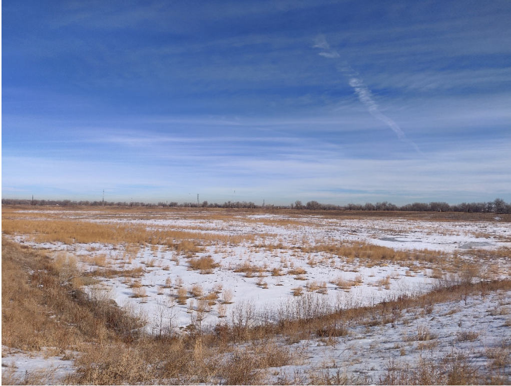
View of the Phase 3 / Pond 3 Mining Area from the southwest corner looking northeast