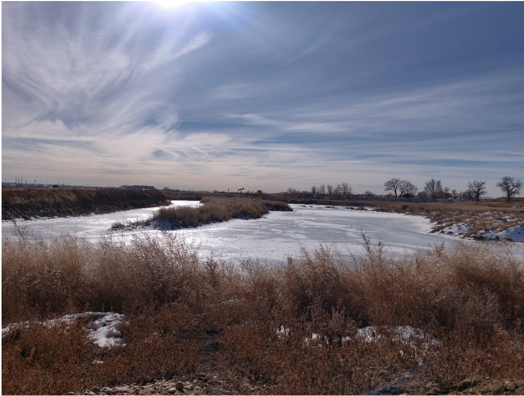
View of the south portion of Phase 1 / Pond 2 Mining Area from the oil & gas pad