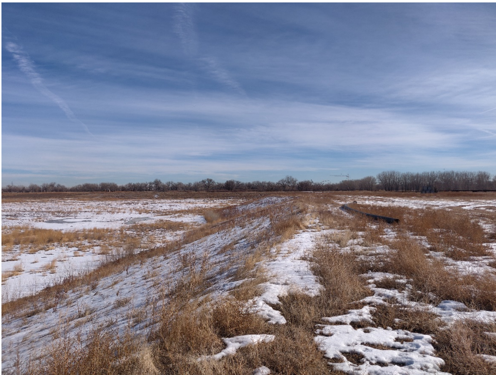
View of the Phase 3 / Pond 3 Mining Area from the southwest corner looking east