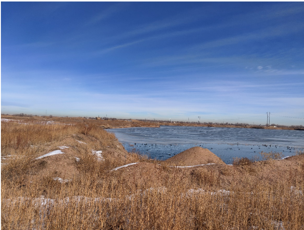
View of the Phase 2 / Pond 1 Mining Area from the southwest corner looking north