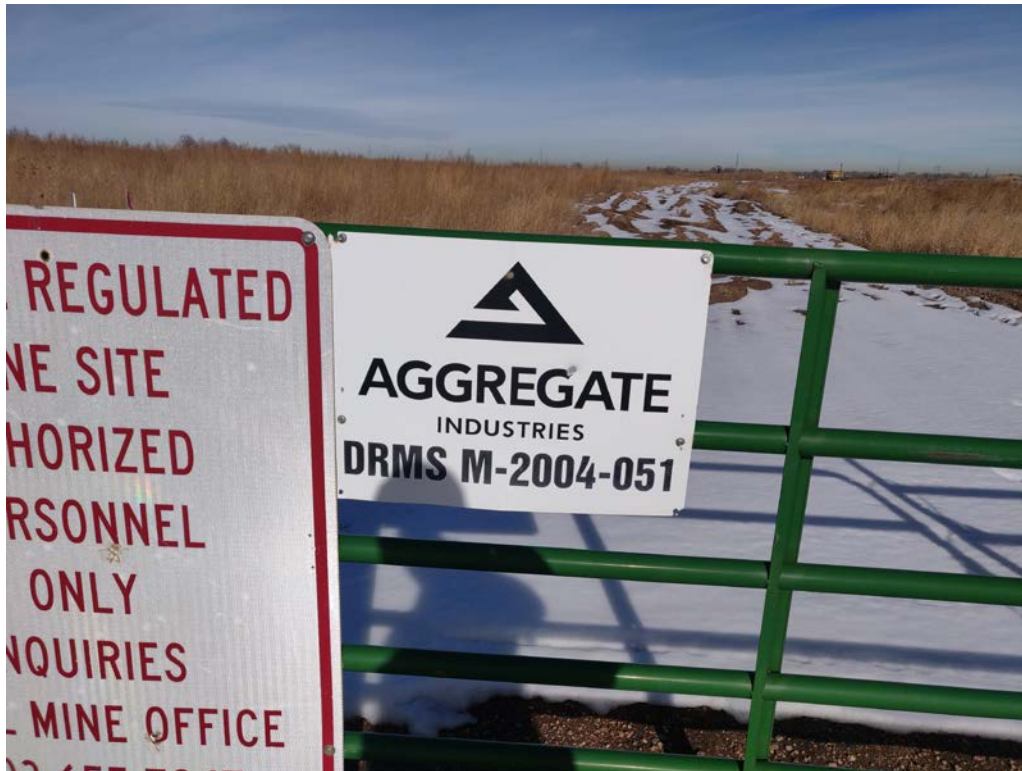
Wattenberg Lakes mine sign