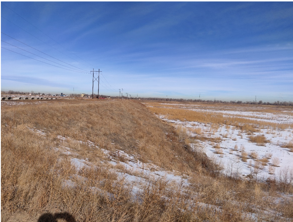
View of the Phase 3 / Pond 3 Mining Area from the southwest corner looking north