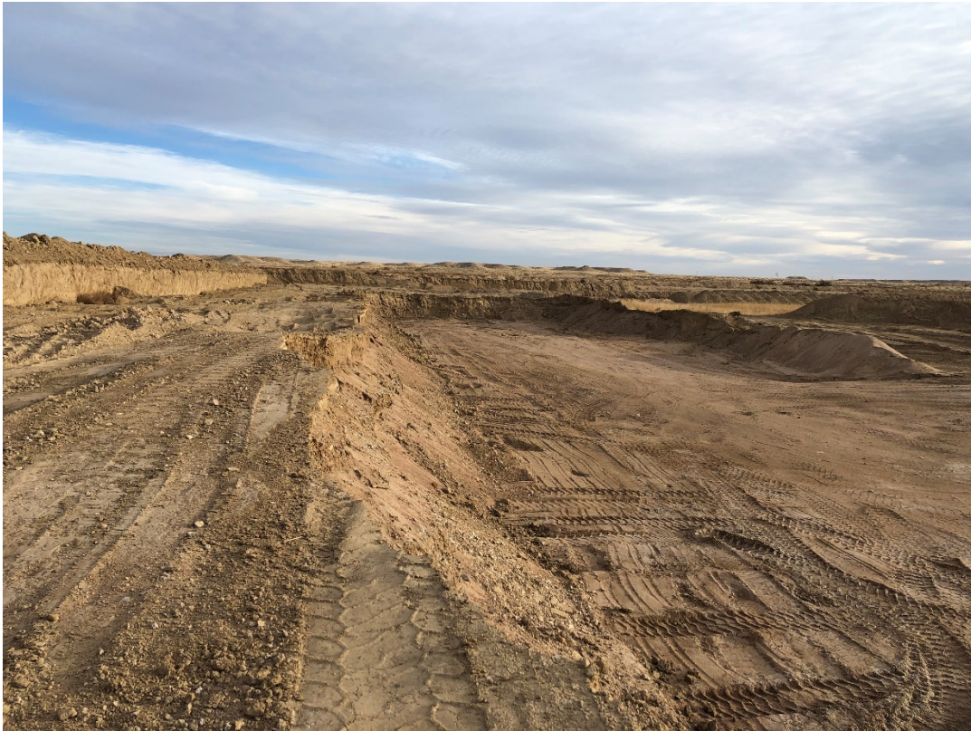
Photo 4: Mining area and highwall looking north, 15-20 feet in height