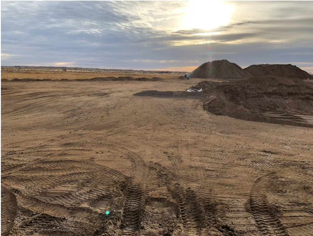
Photo 5: Looking east from the mining area towards the stockpile area