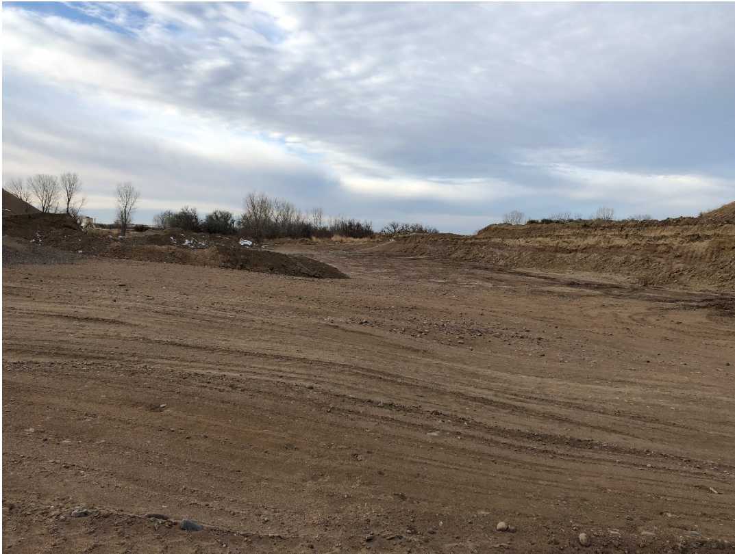
Photo 3: Mining area and highwall looking south, 15-20 feet in height