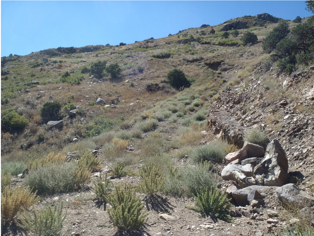
Photo 4. Additional access road to be inspected in the near future (looking south from east of Trench 1 ).