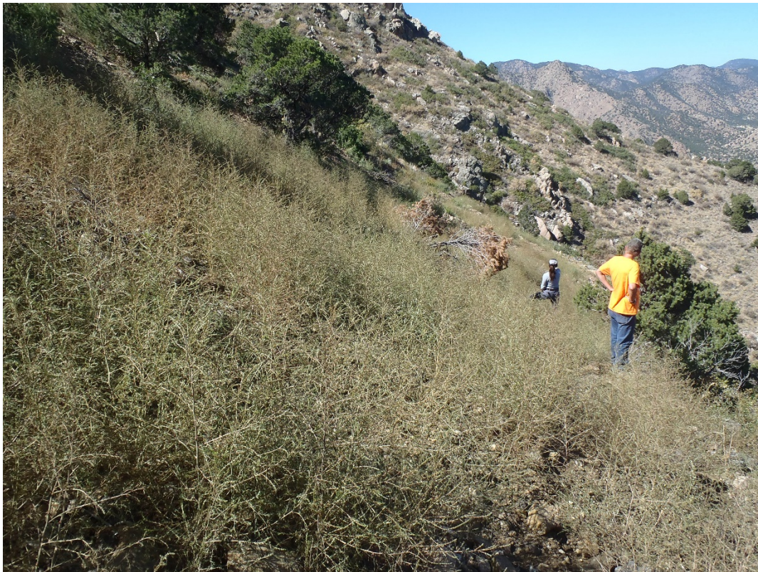
Photo 1. Trench 1 (looking west, note heavy Russian thistle cover).