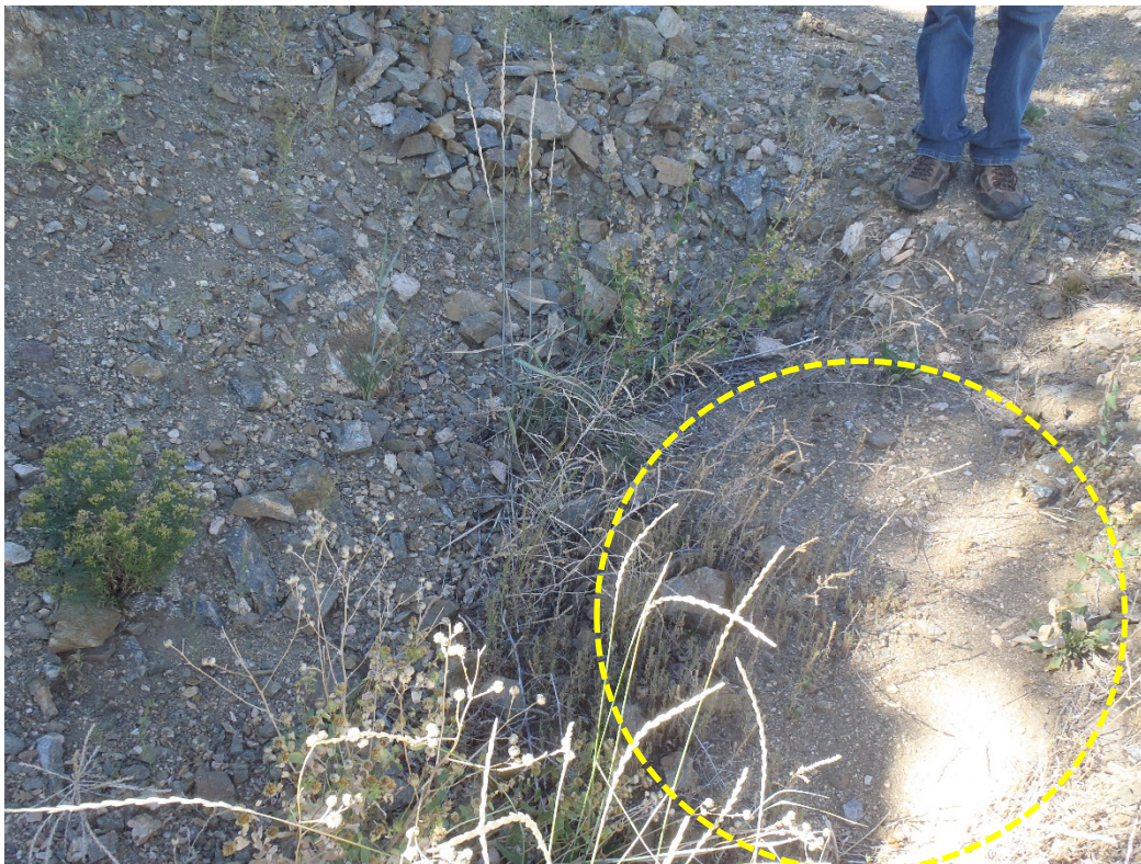
Photo 5. WP-18-18 borehole site (See attached Post Inspection Map for location).