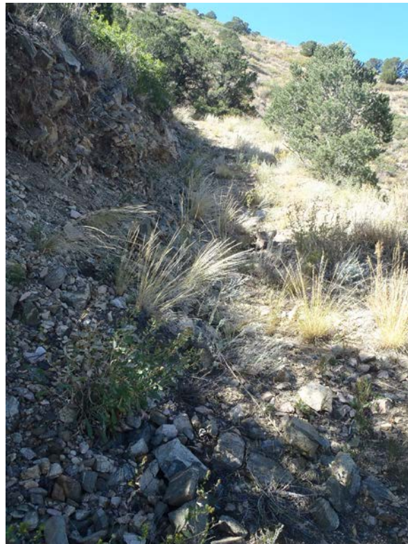
Photo 3. Trench 3 (in access road requiring backfill, looking SW).