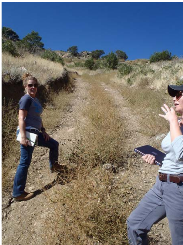
Photo 6. Steep section of access road requiring erosion protection (BLM representatives indicate steepness).

John Kratz & Angela Bellantoni Zephyr Gold USA Ltd 1107 Main St Canon City, CO 81212