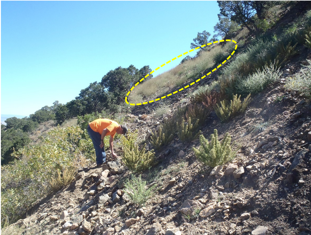
Photo 2. Trench 2 (looking east, note heavy Russian thistle cover beyond).