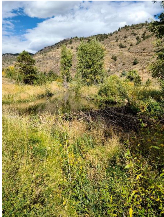
October 6, 2021 Picture of North Clear Creek Discharge Location (left), looking upstream (right)

In addition, there are a number of items in the 12/21/2021 Gilpin County Letter that merit a response: