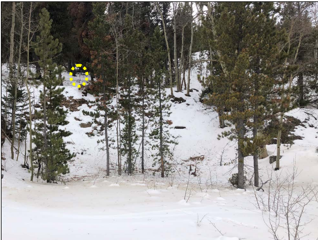
Photo 14. View looking south across eastern portion of permit area on Iron claim (south of Druid Mine Rd). Note post (in background; circled) marking northeastern corner of this permit area.