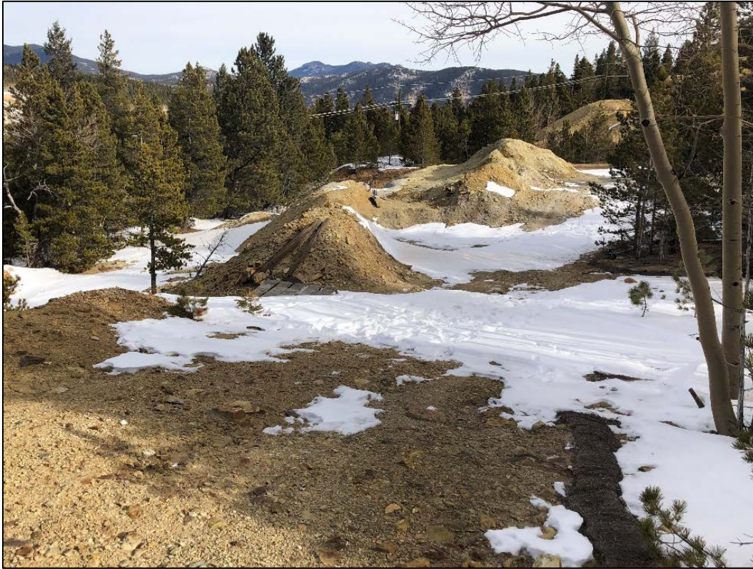
Photo 7. View looking northeast across eastern portion of permit area on Wm. Richardson claim where most recent excavation activities occurred.