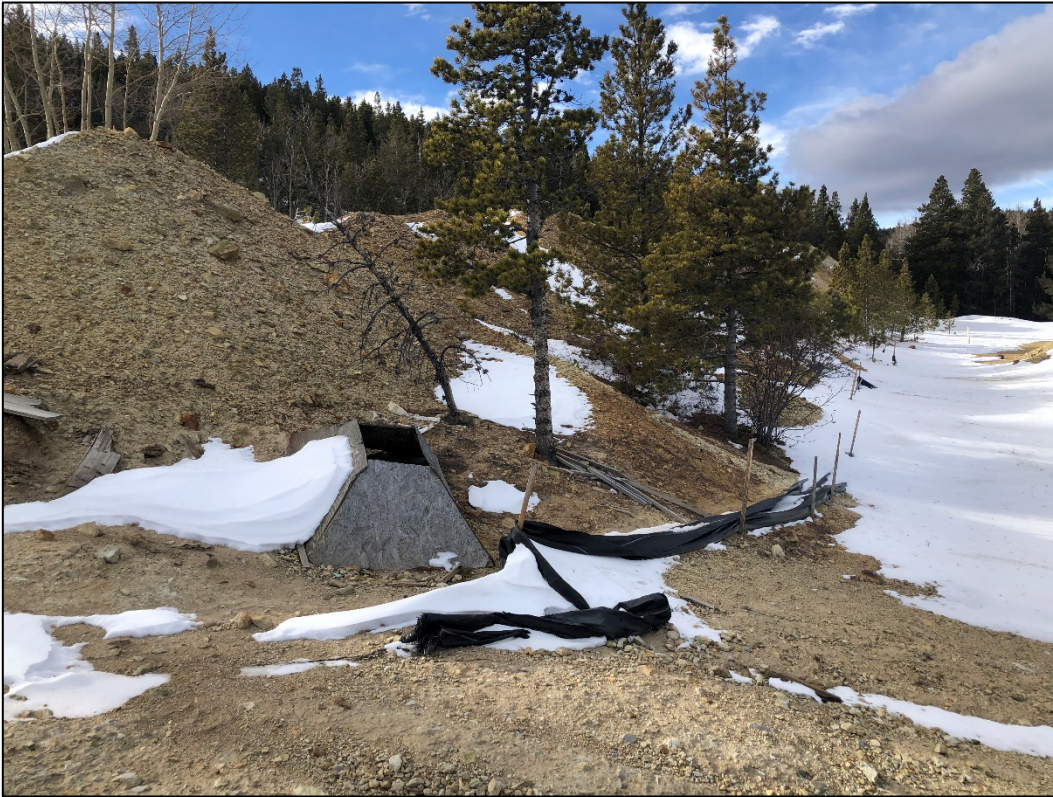
Photo 9. View looking southwest along northern boundary of permit area on Wm. Richardson claim. Note silt fencing (at right) which requires maintenance.