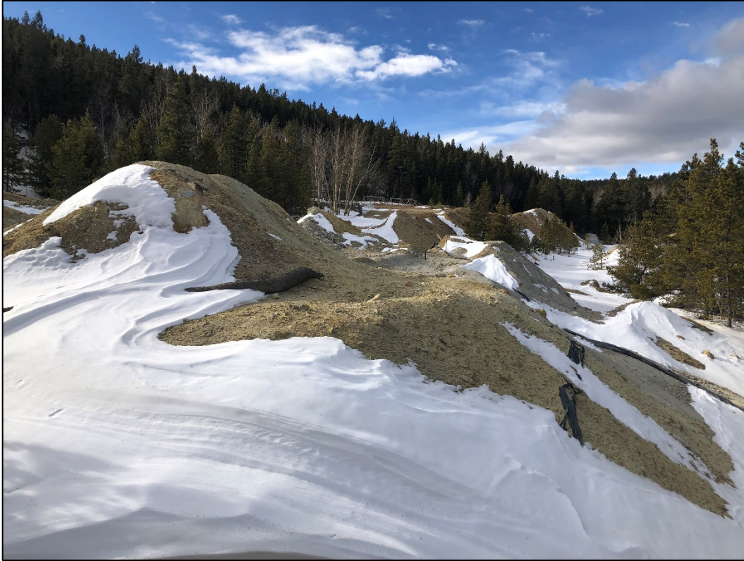
Photo 5. View looking southwest along northern boundary of permit area on Wm. Richardson claim.