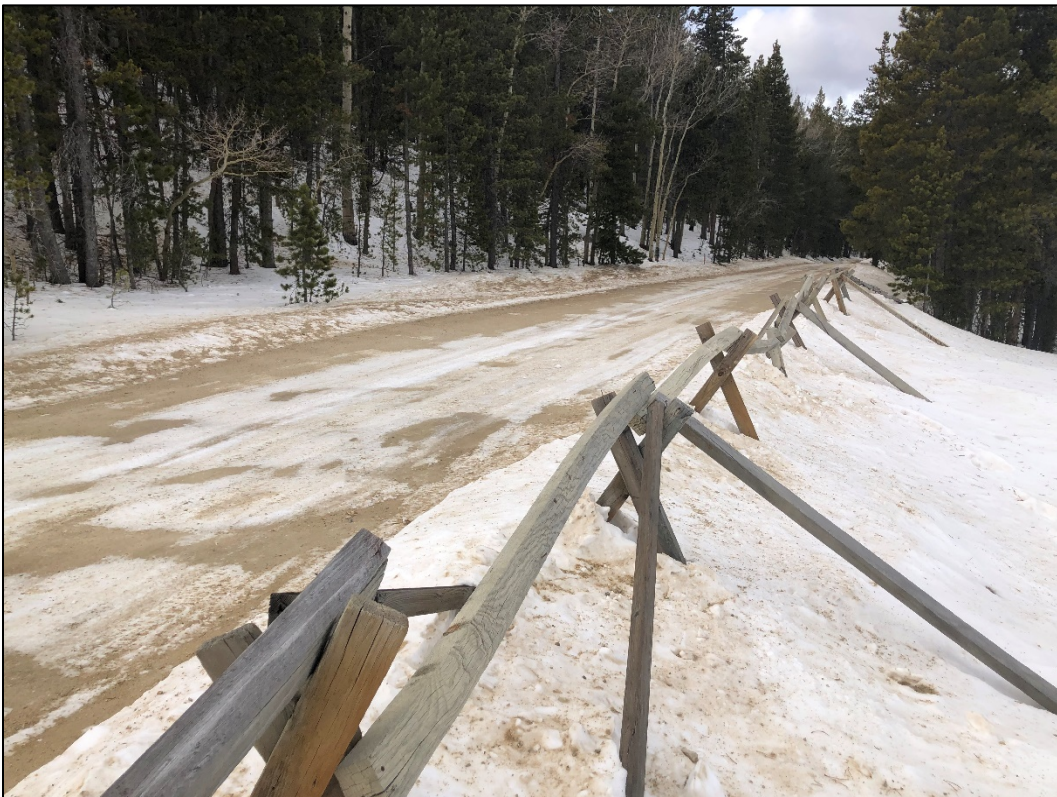
Photo 12. View looking west across Druid Mine Rd which separates the north permit area (on Wm. Richardson claim) from the south permit area (on Iron claim). The southwestern corner of the permit area on Wm. Richardson claim is located at the center of the road in this area.