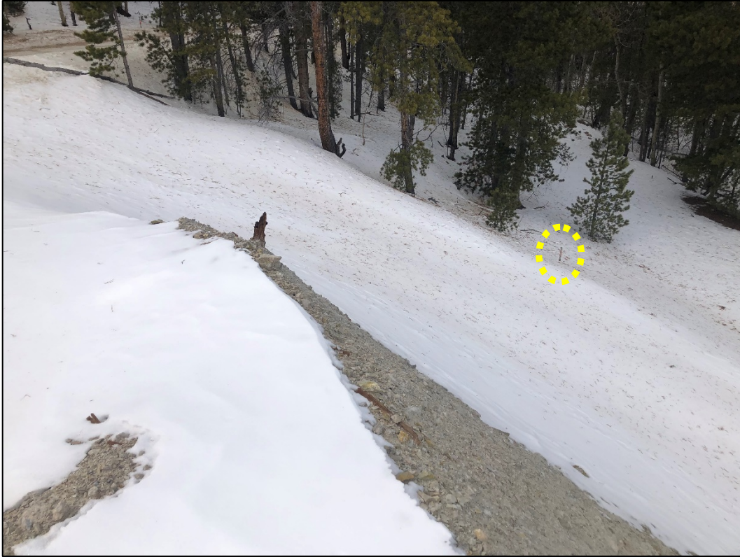
Photo 11. View looking west at post (in background; circled) marking northwestern corner of permit area on Wm. Richardson claim.