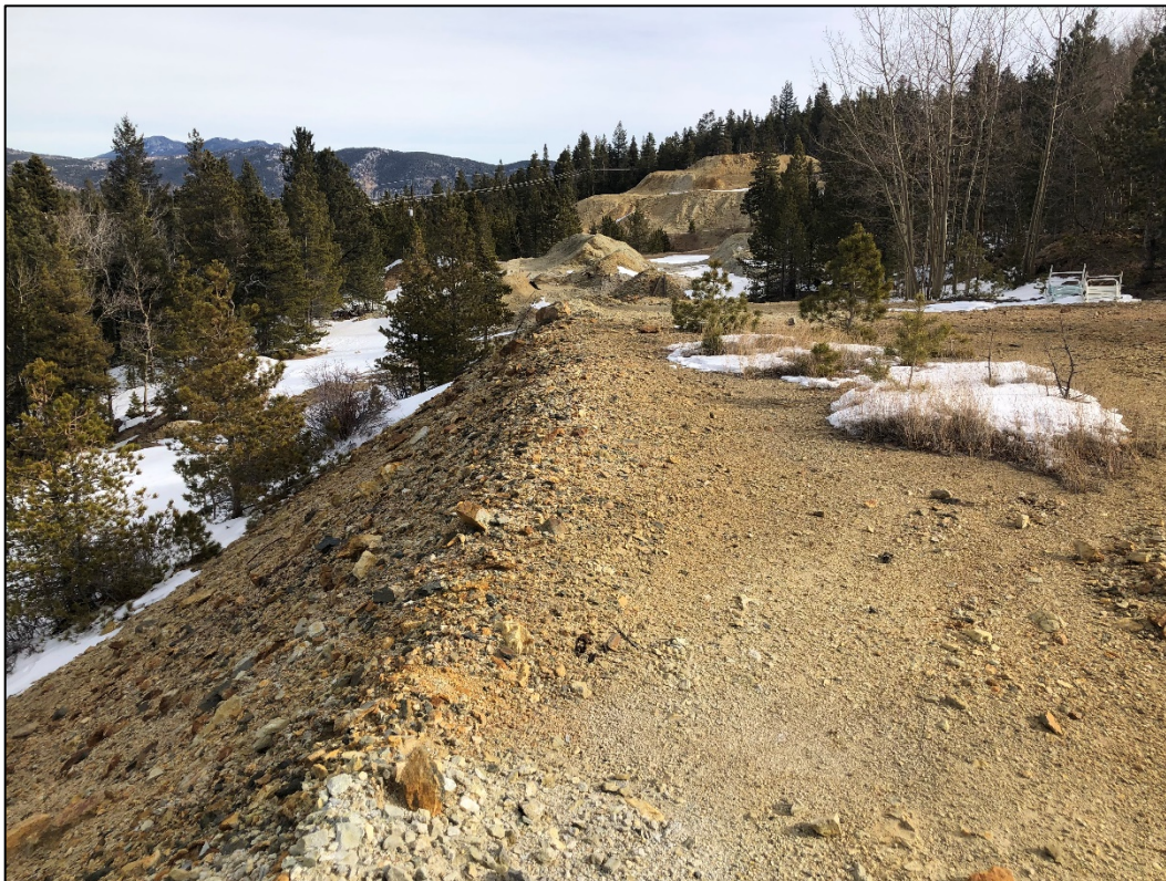
Photo 10. View looking northeast across top of historic mine dump in western portion of permit area on Wm. Richardson.