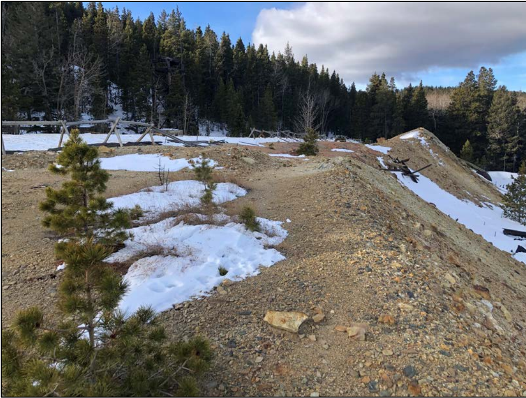
Photo 1. View looking southwest across top of historic mine dump in central portion of permit area on Wm. Richardson claim.