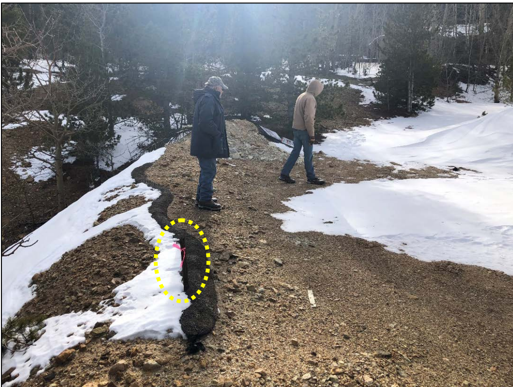
Photo 6. View looking south/southeast at post (circled) marking northeastern corner of permit area on Wm. Richardson claim.