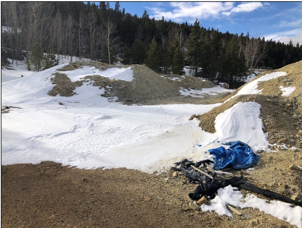
Photo 8. Closer view (looking southwest) of eastern portion of permit area on Wm. Richardson claim where most recent excavation activities occurred.