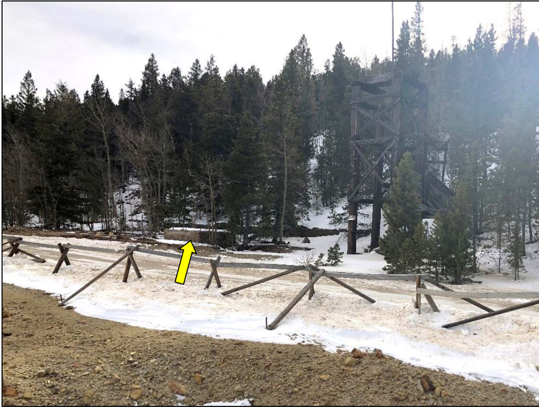
Photo 13. View looking south/southeast at western portion of permit area on Iron claim (south of Druid Mine Rd). Note historic headframe and stone foundation (indicated) present in this area.