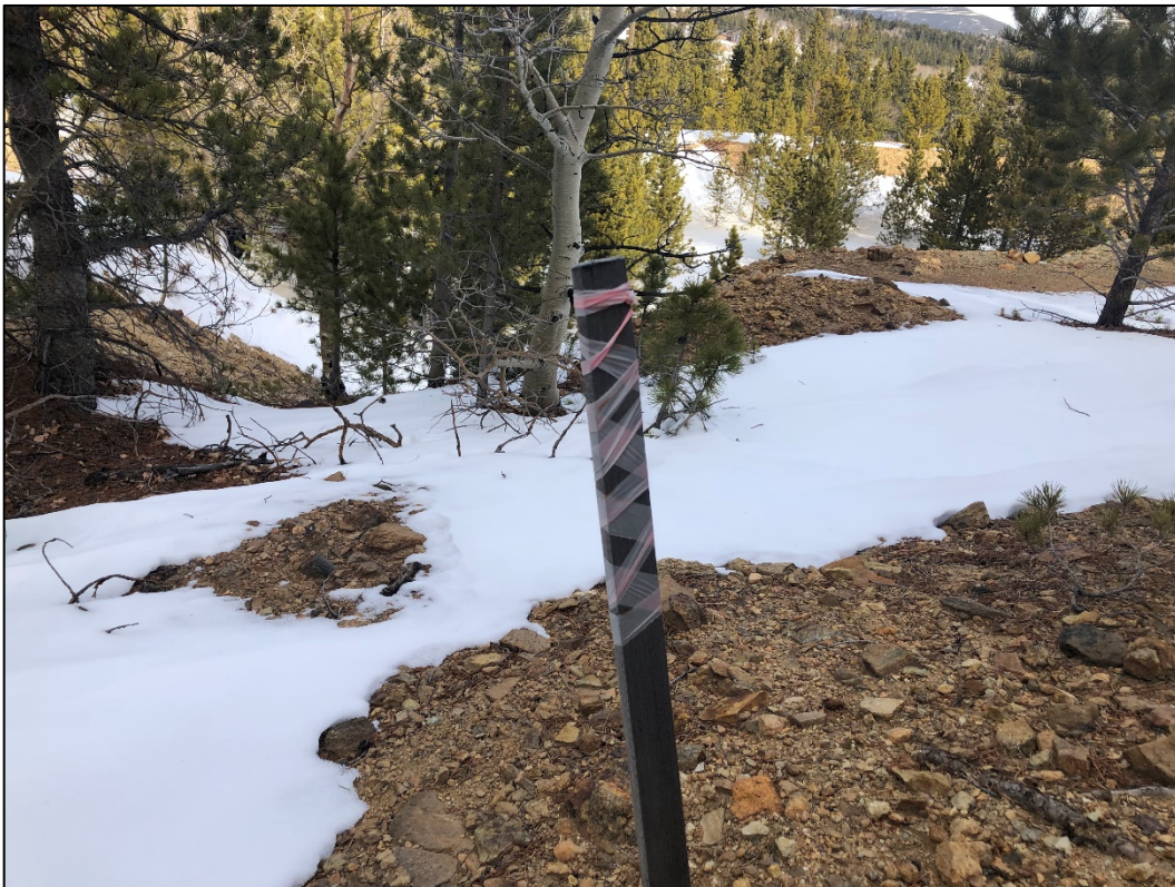
Photo 4. View looking north/northwest at post marking southeastern corner of permit area on Wm. Richardson claim.