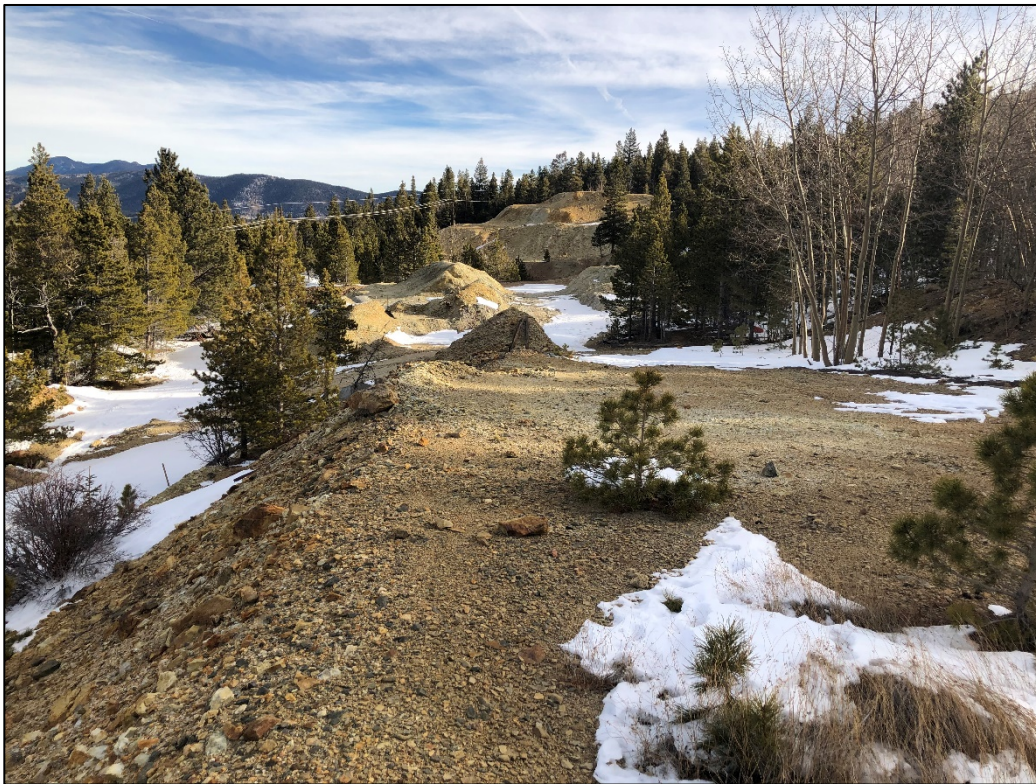
Photo 2. View looking northeast across top of historic mine dump in central portion of permit area on Wm. Richardson claim.