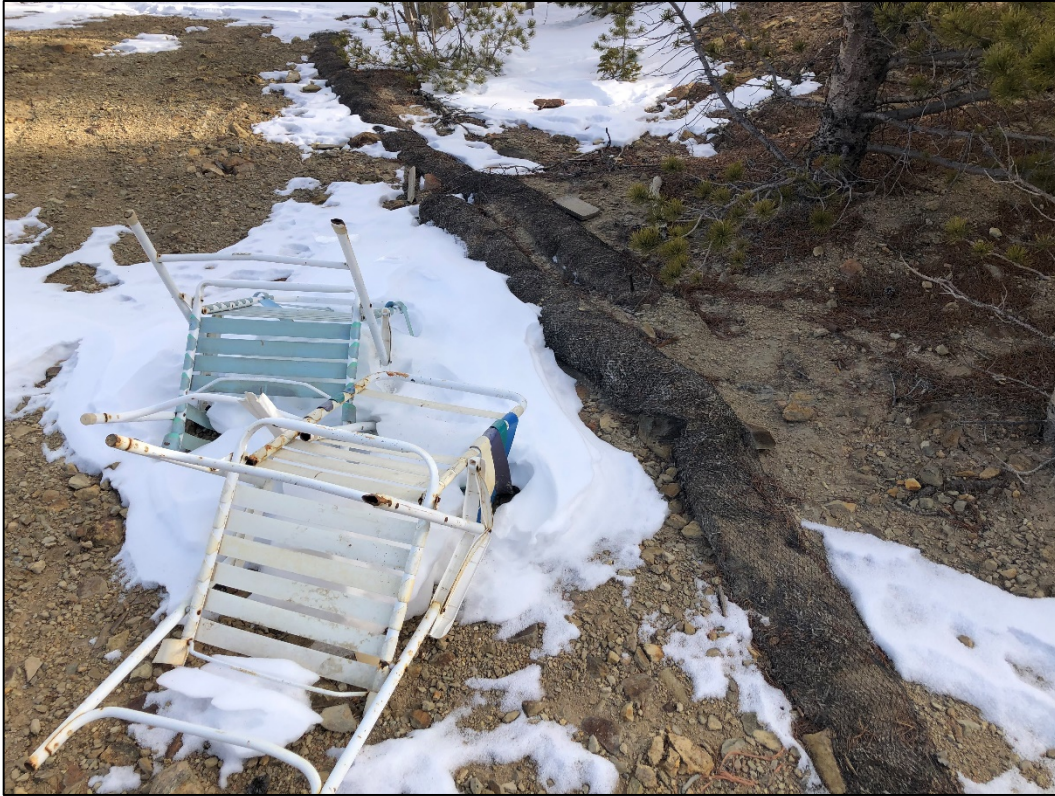
Photo 3. View of straw wattles installed along southern edge of permit area on Wm. Richardson claim. These wattles may need maintenance.