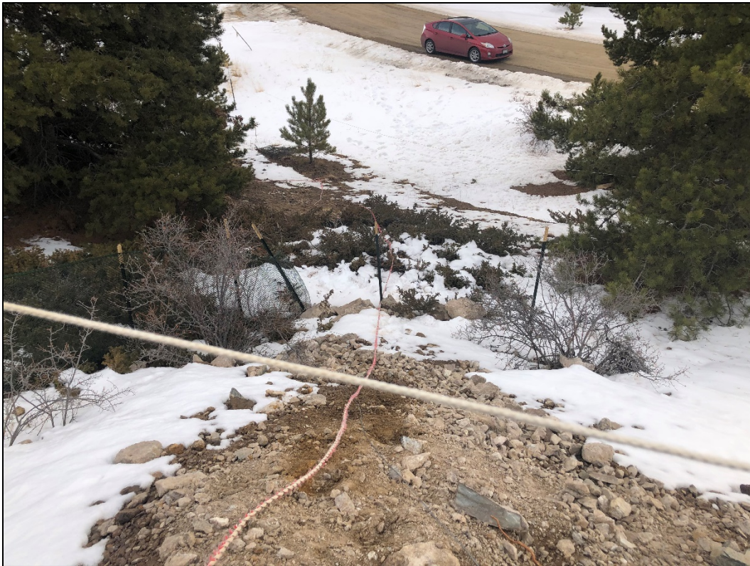
Photo 4. View looking south from excavation across southern face of historic waste rock pile, showing Nevadaville Rd (in background) used to access the site.