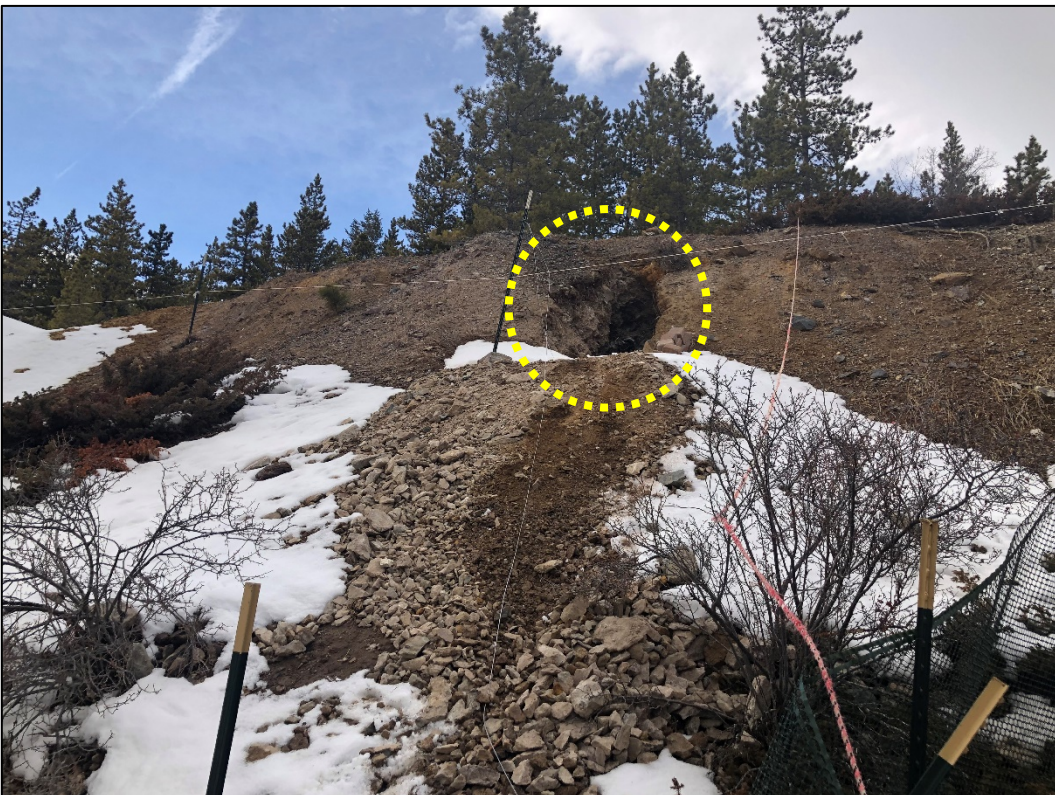
Photo 2. View looking north, showing closer view of excavation (circled) into southern face of an historic waste rock pile. Note excavated material dumped on slope beneath excavation.