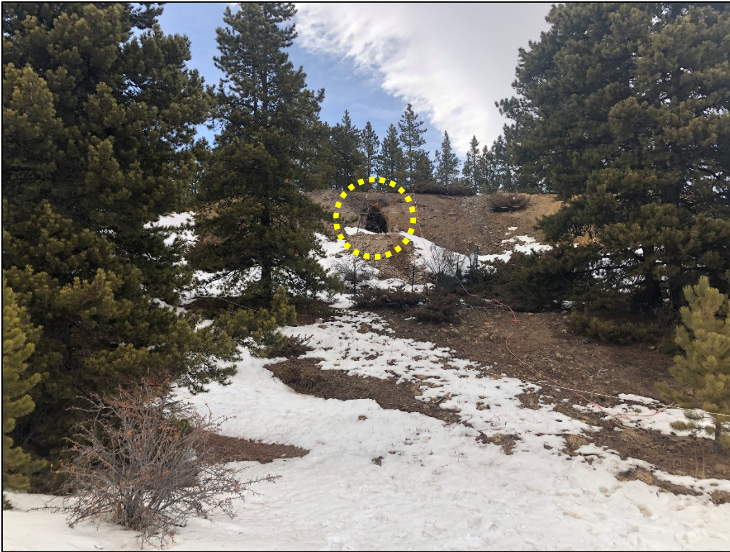
Photo 1. View looking north from Nevadaville Rd at excavation (circled) into southern face of an historic waste rock pile.