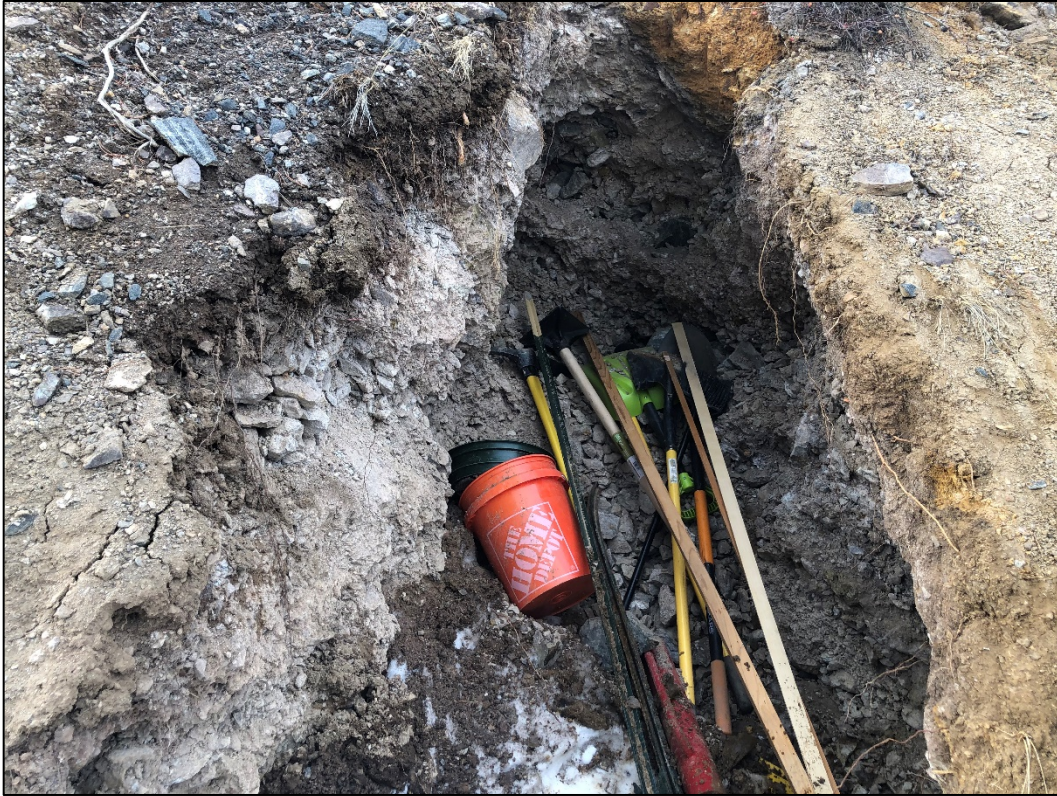
Photo 3. Close-up view of excavation into southern face of an historic waste rock pile, approximately 6 feet wide x 7 feet high x 10 feet deep. Note only hand tools present on site.