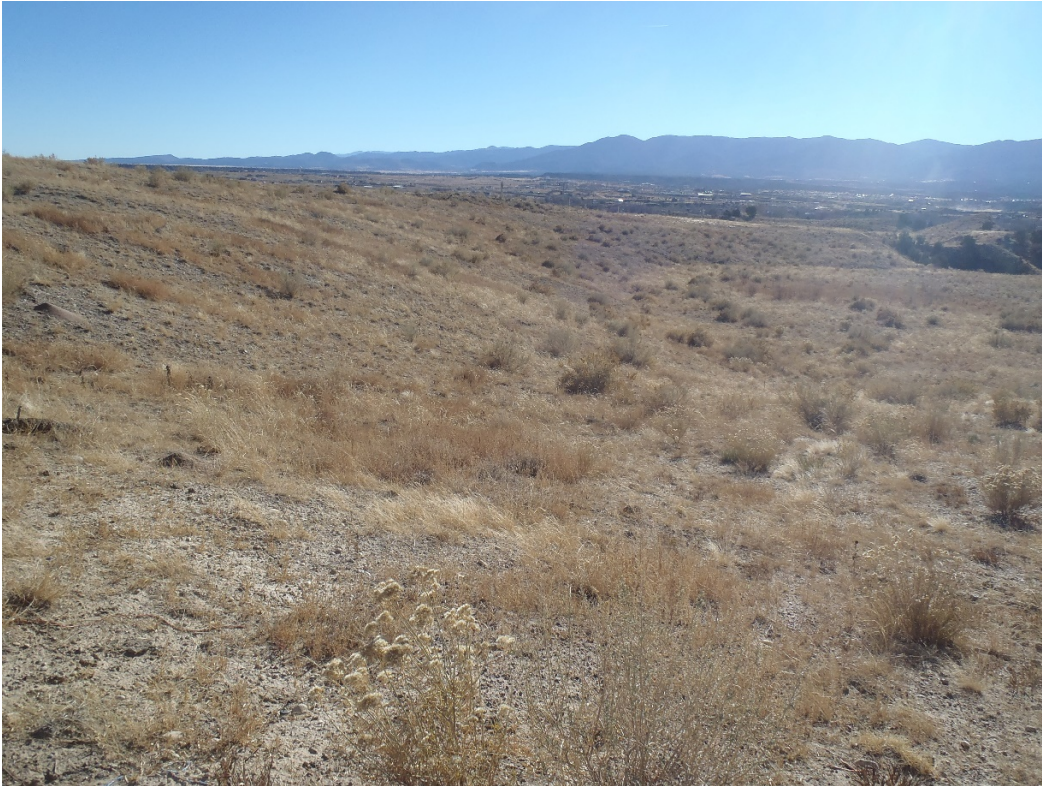
Photo 1. West facing slope with repaired erosion gullies (looking south).