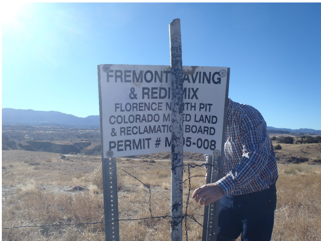
Photo 6. Permit sign at entrance.