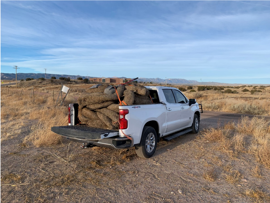
Photo 5. Used straw wattles loaded up for disposal.