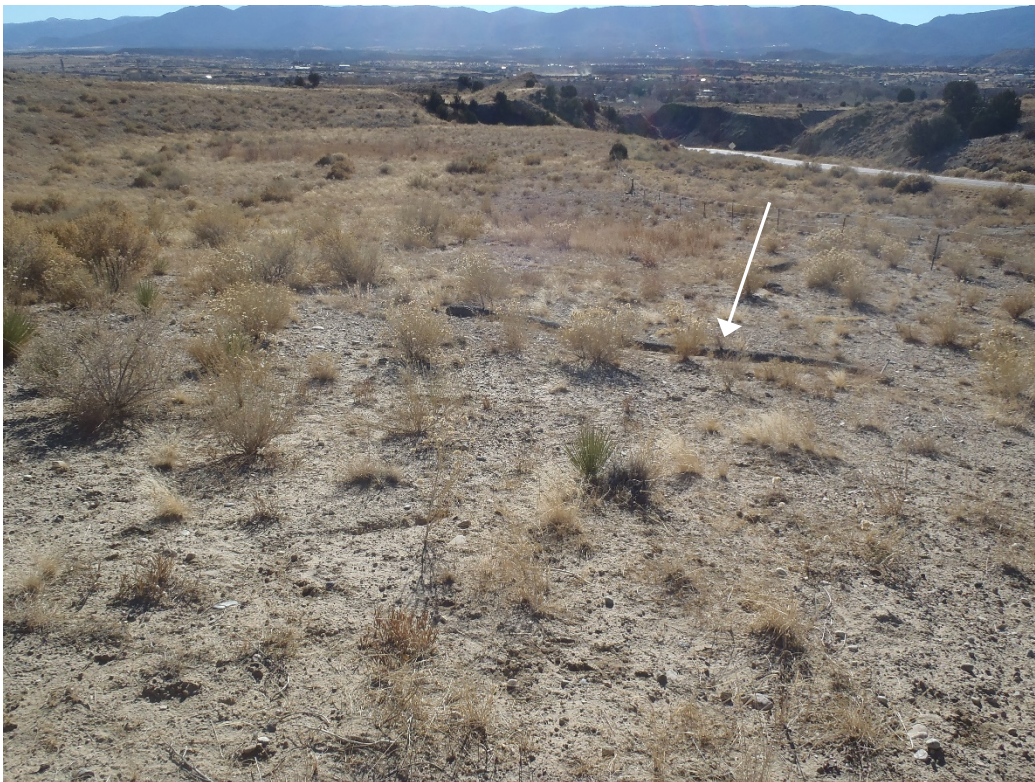
Photo 2. South facing slope with repaired erosion gullies (looking south, note straw wattle).