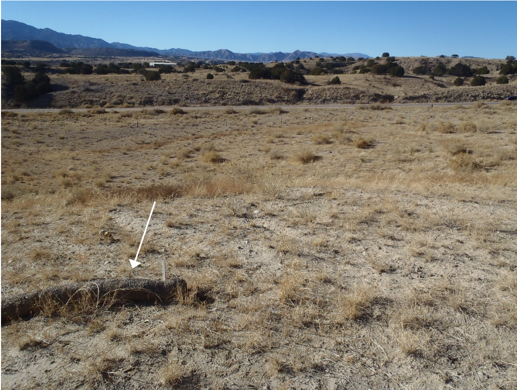
Photo 3. Typical diverse, well established vegetation & straw wattle (east side, looking west).