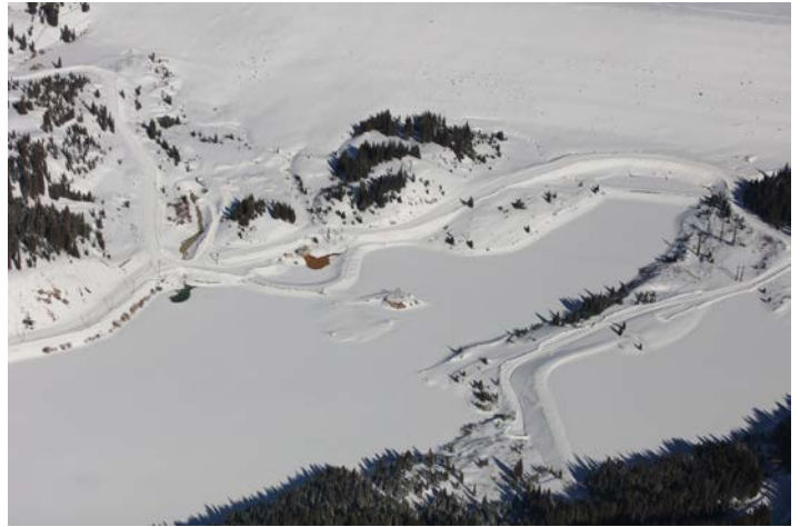
1 Dam - Robinson Lake