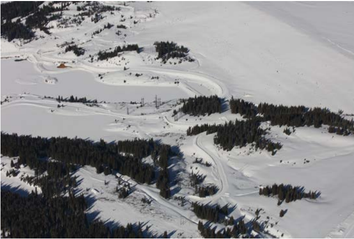
1 Dam - Robinson Lake