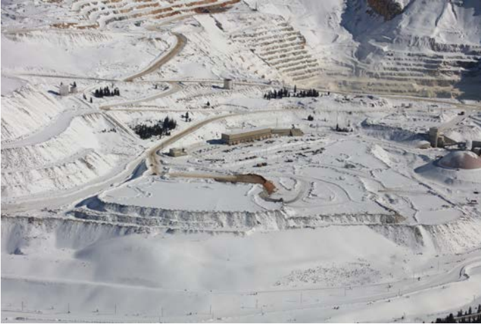
North 40 OSF