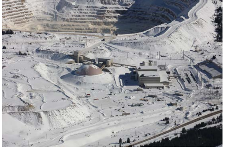
North 40 OSF

No problems or violations were noted during this inspection.