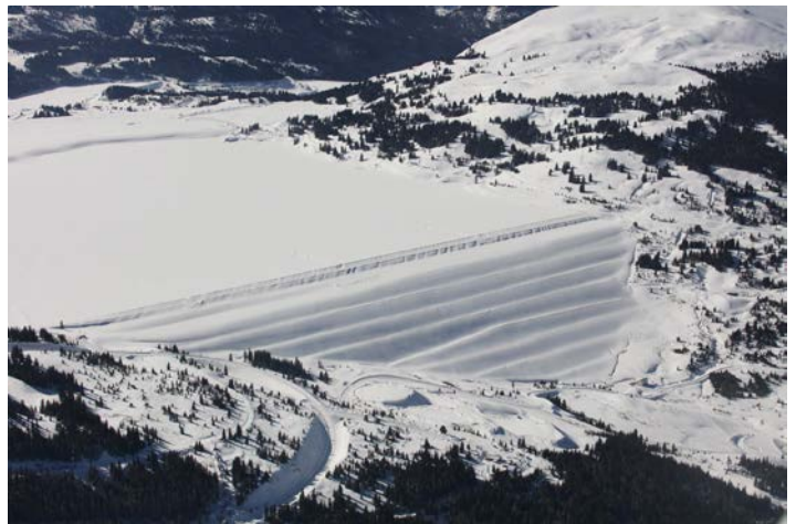
3 Dam-Tenmile Pond