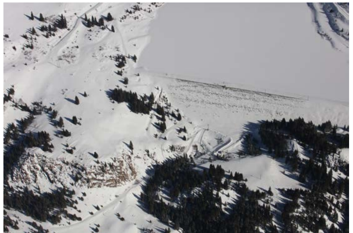
Eagle Park Reservoir-4 Dam

The McNulty and North 40 OSF's were observed. Snow cover on the OSF's appeared to be about one foot depth. The current OSF operating plan was drafted by Golder Associates in December 2016. The plan was submitted to the Division as part of TR-25. Climax appears to be in compliance with Golder recommendations for OSF operations. No problems were noted with the OSF's.