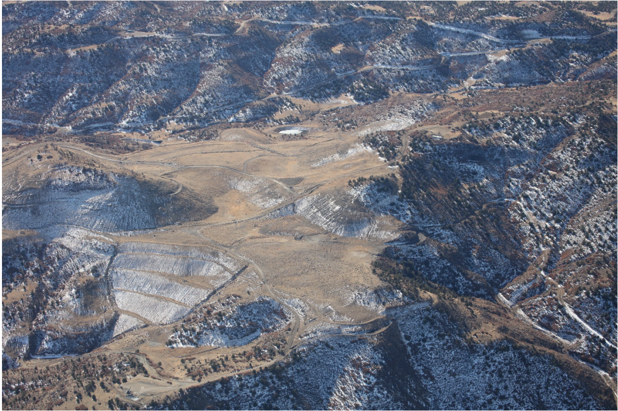
Figure 1. Fill 8, and top of the reclaimed area from the north looking south.

Number of Partial Inspection this Fiscal Year: 4