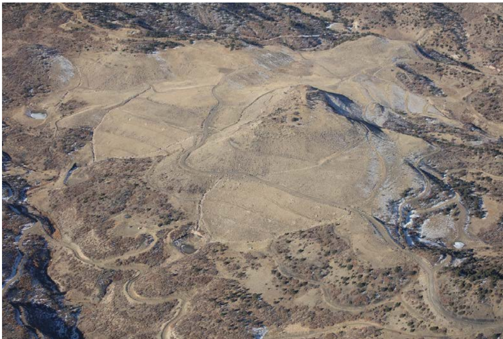
Figure 3. Fill 9, Fill 7, Ponds 006, 007 and 009a

Number of Partial Inspection this Fiscal Year: 4