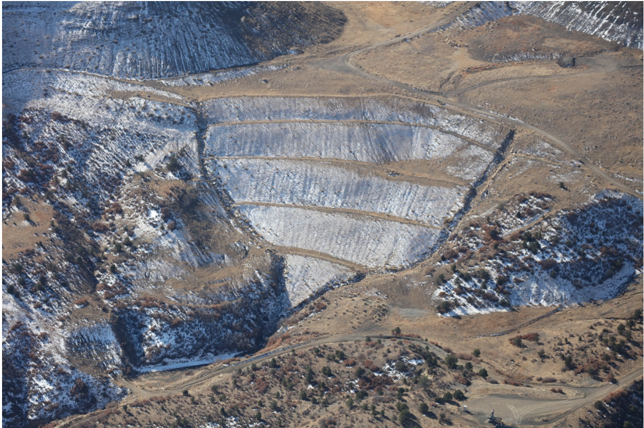
Figure 2. Fill 8