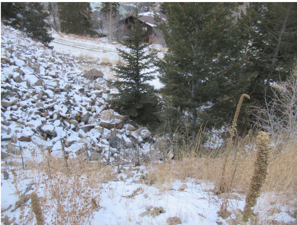
View of the proposed truck loadout area looking northwest from the mine