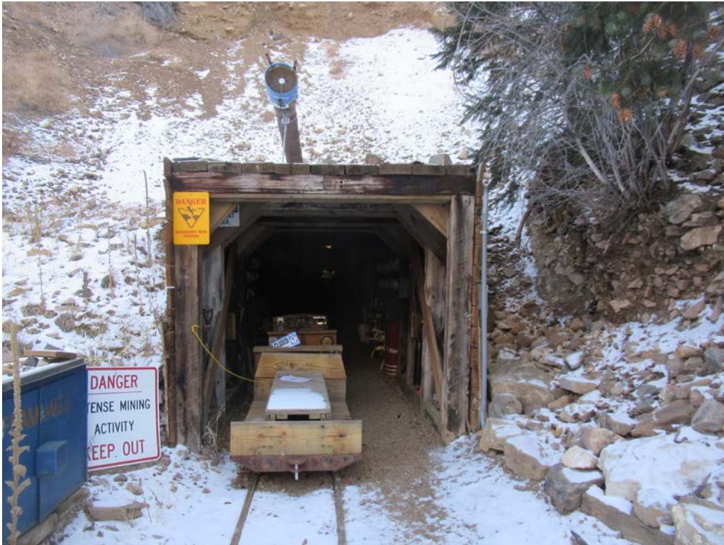
View of the Capital Prize Mine portal