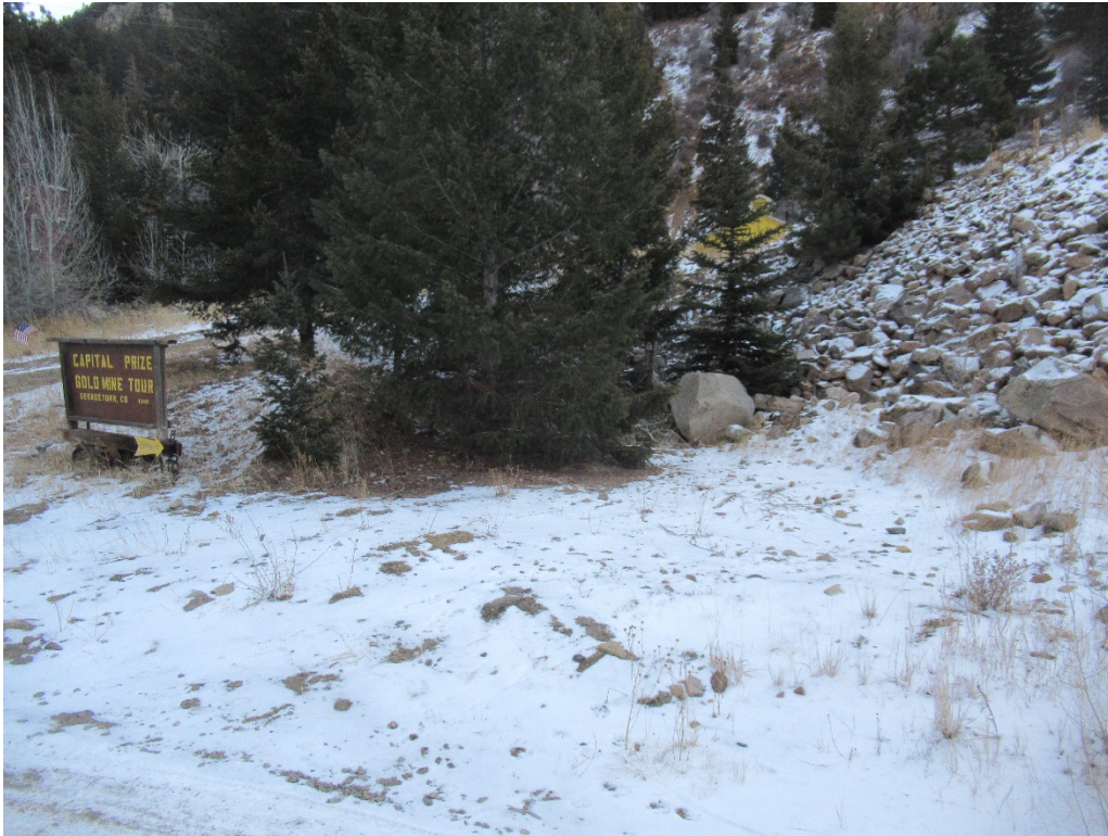
View of the proposed truck loadout area looking southeast from the road

Kent Sterett Capital Prize Mine VII LLP 1000 Biddle Street Georgetown, CO 80444