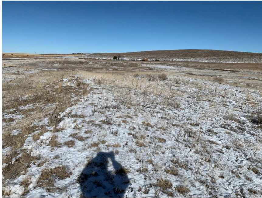
Looking north, one topsoil pile in foreground, pit in background