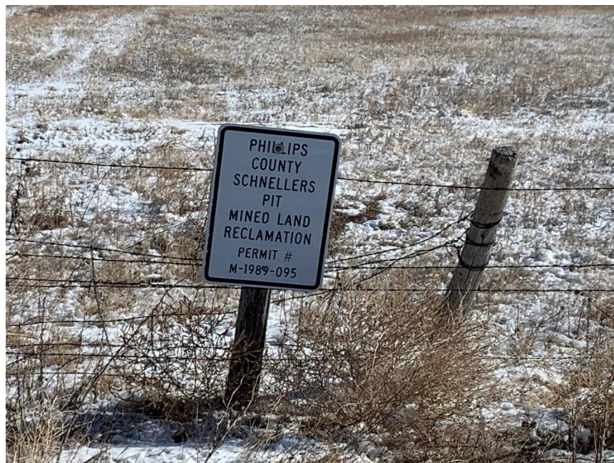
Entrance sign from County Road 49