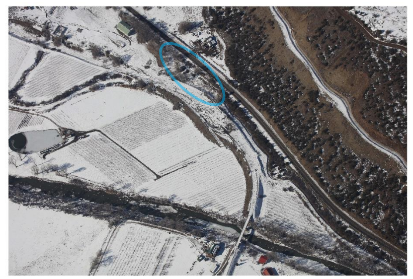
Loadout (pond is circled)