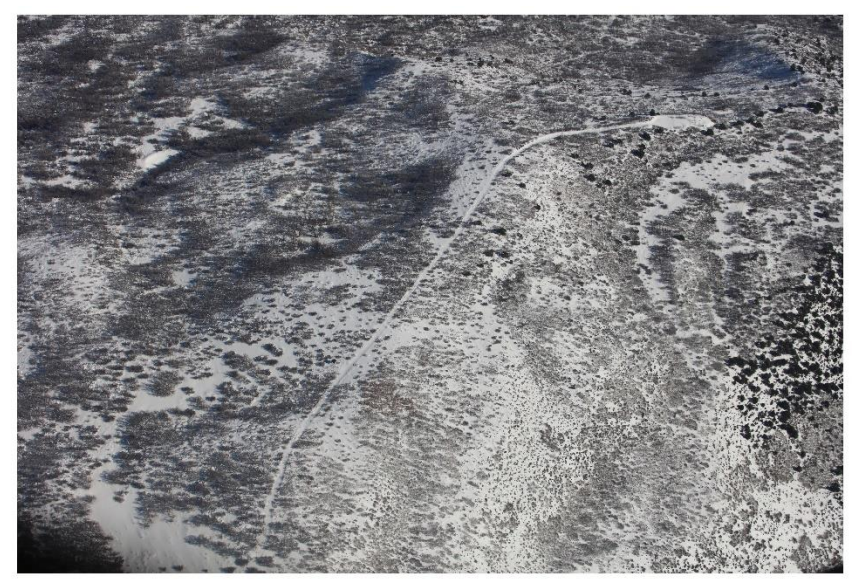
Road to pad for BRL-GMW-01 (northwest of West Mine)