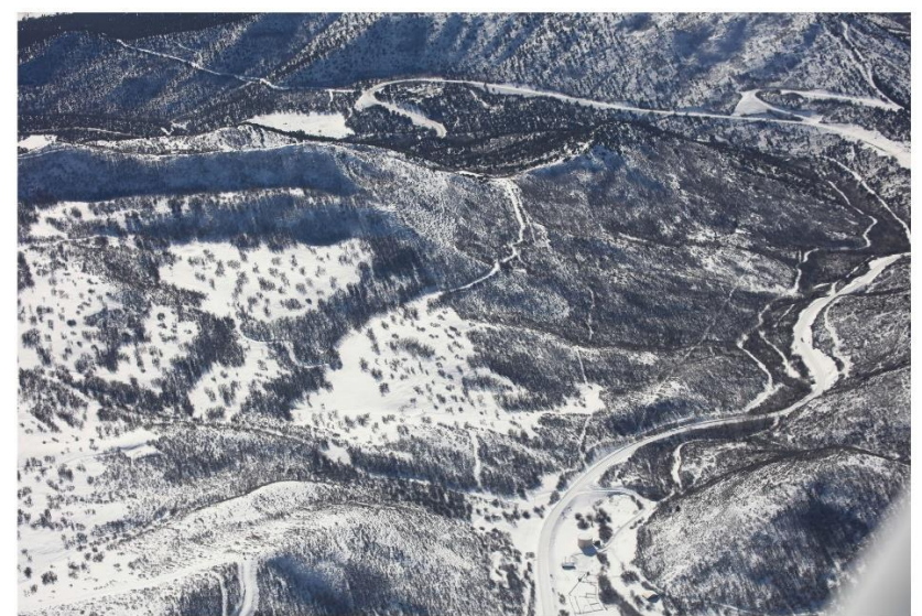
Road to BV-2 pad