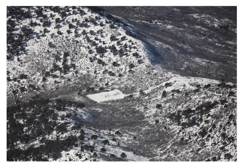
Pad for BV-2 (northwest of East Mine)