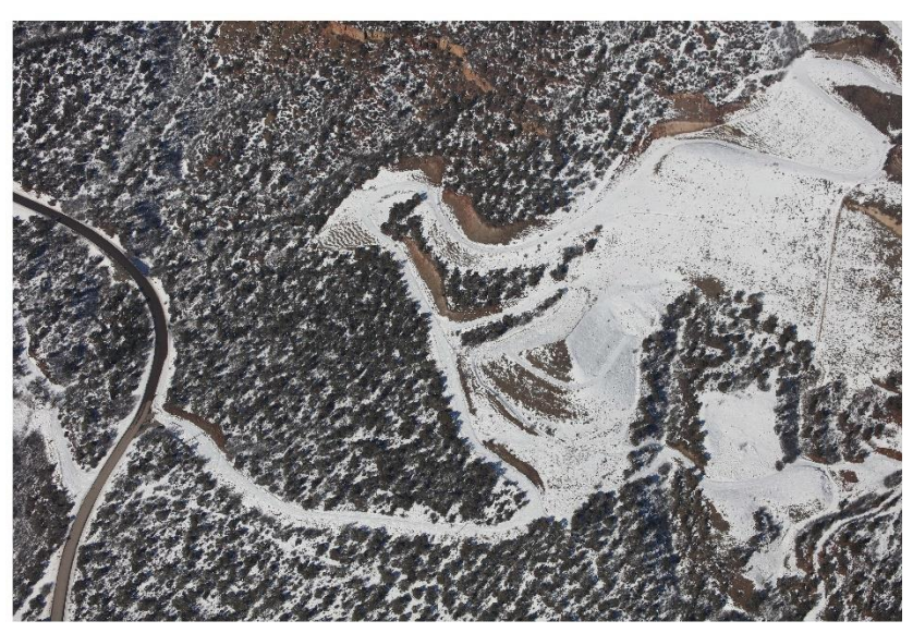
East Mine, lower area with RDA and Old Waste Disposal Area