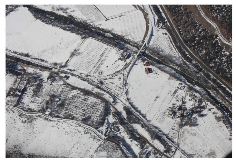
Loadout - northeast area with bridge