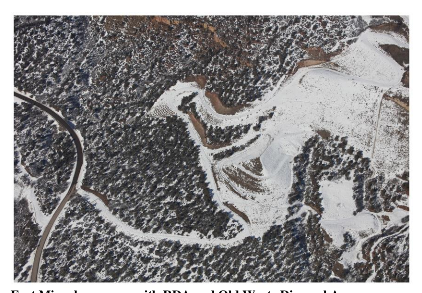
East Mine, lower area with RDA and Old Waste Disposal Area

Number of <u>Partial</u> Inspection this Fiscal Year: 4 Number of <u>Complete</u> Inspections this Fiscal Year: 2