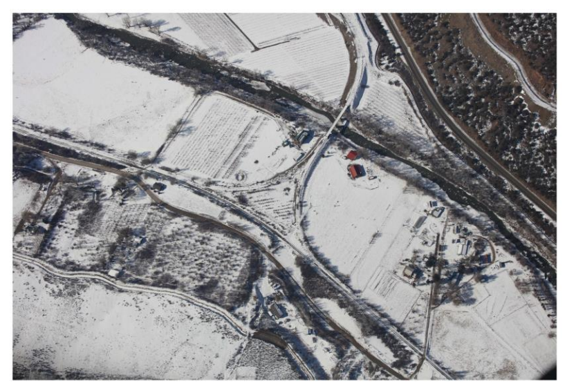
Loadout - northeast area with bridge