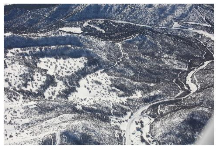
Road to BV-2 pad