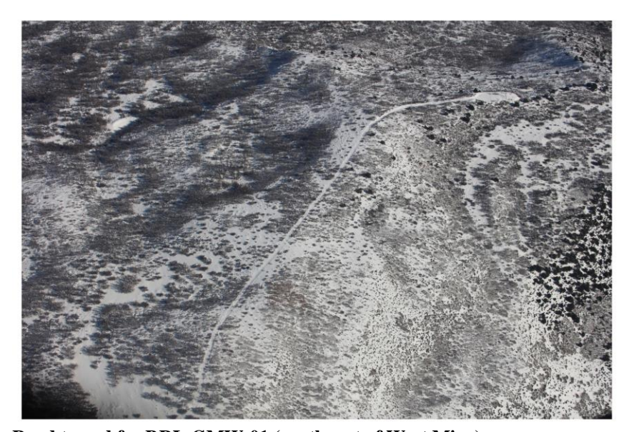
Road to pad for BRL-GMW-01 (northwest of West Mine)