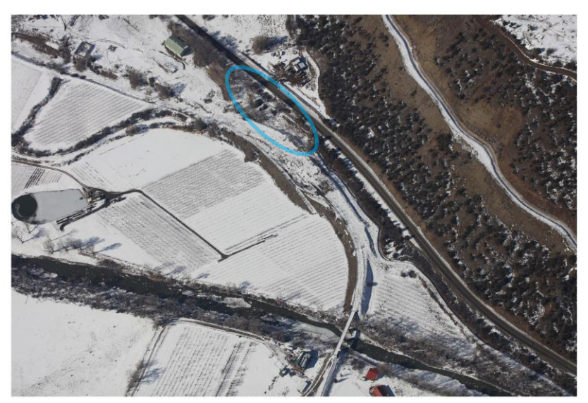
Loadout (pond is circled)