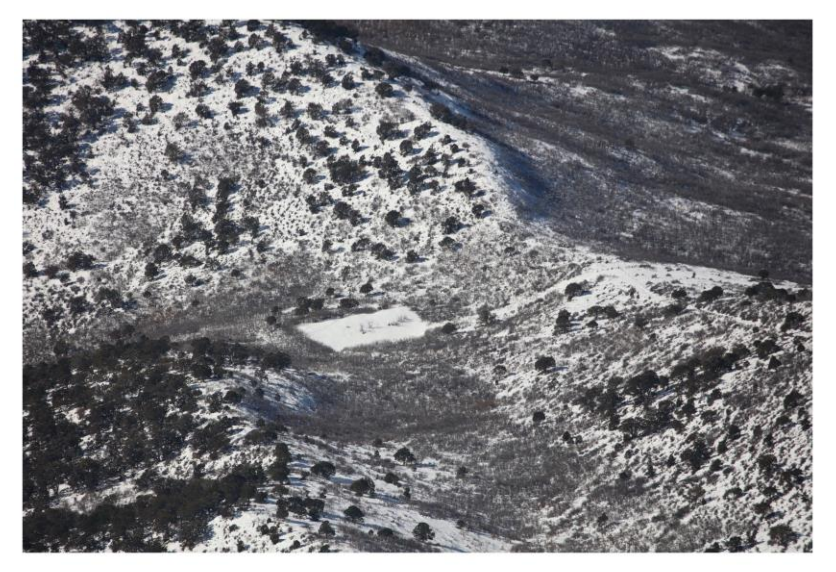
Pad for BV-2 (northwest of East Mine)