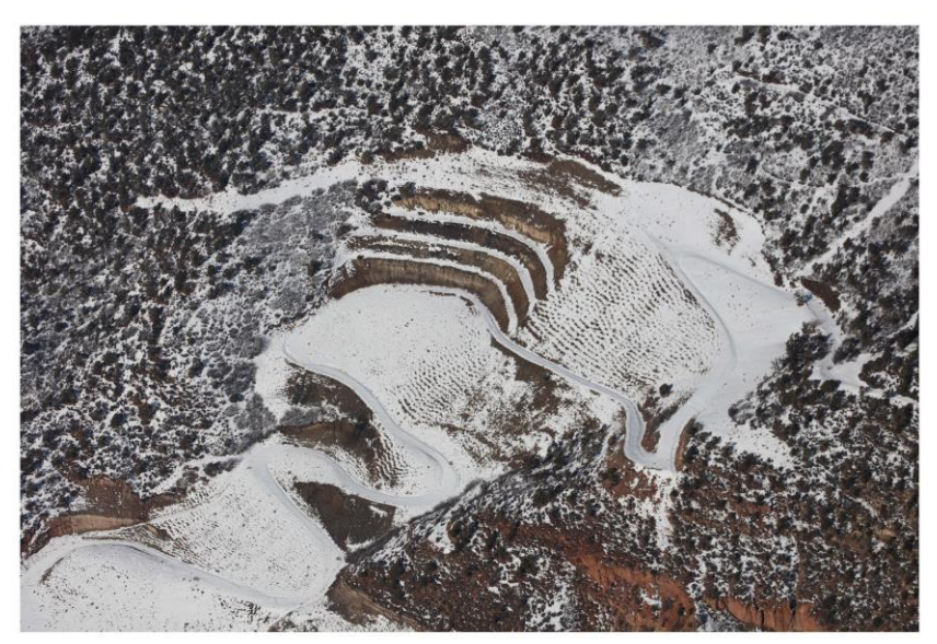
East Mine, upper area