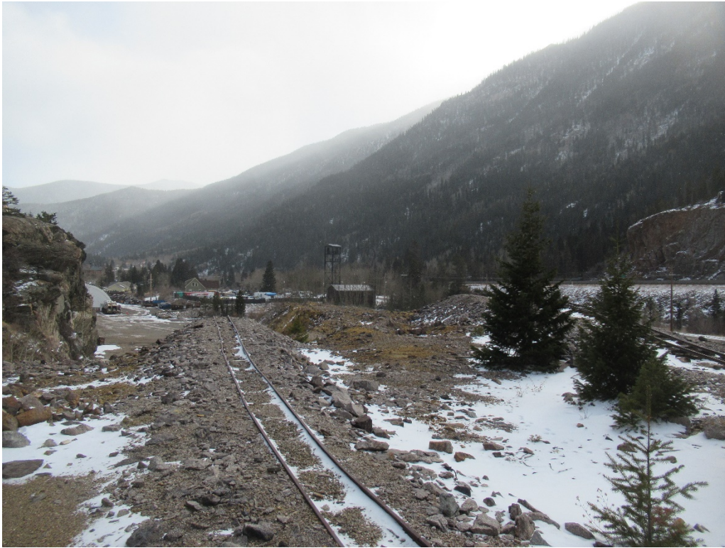
View of the mine dumps