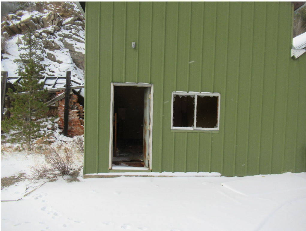
View of the mine office building