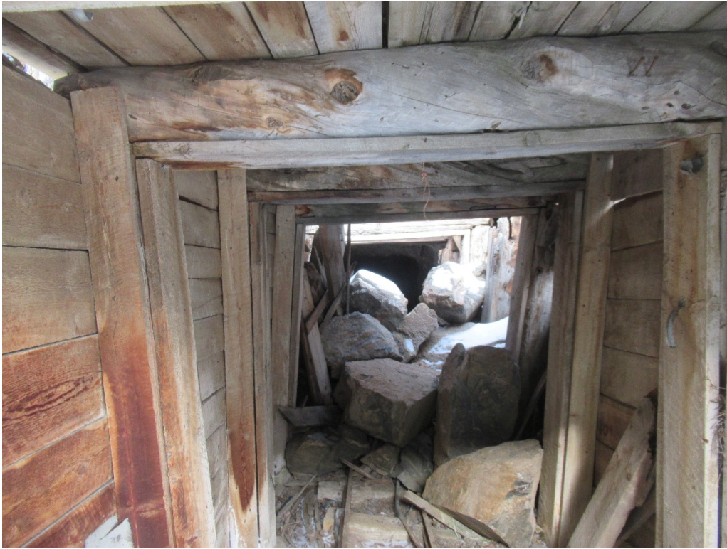
Partially collapsed Mendota Adit portal