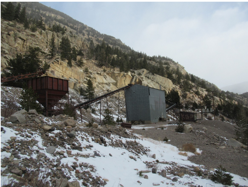
View of the Heavy Media building