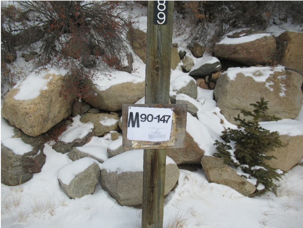
Mendota Properties mine sign