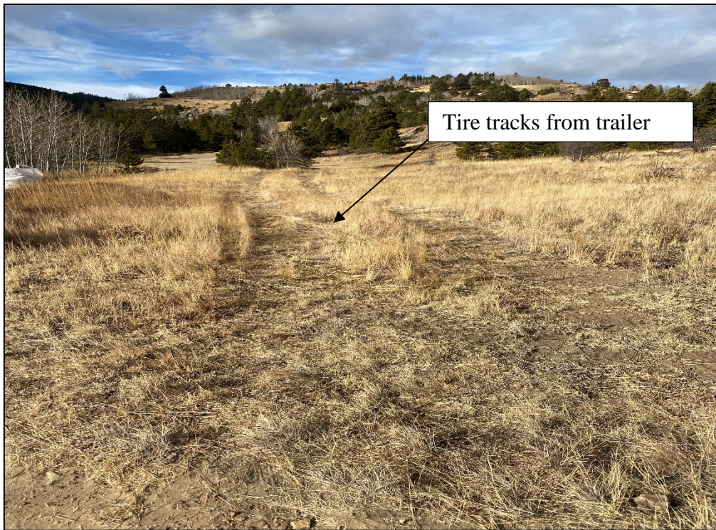
Photo 3. Trailer parking area, adjacent to primary staging area.