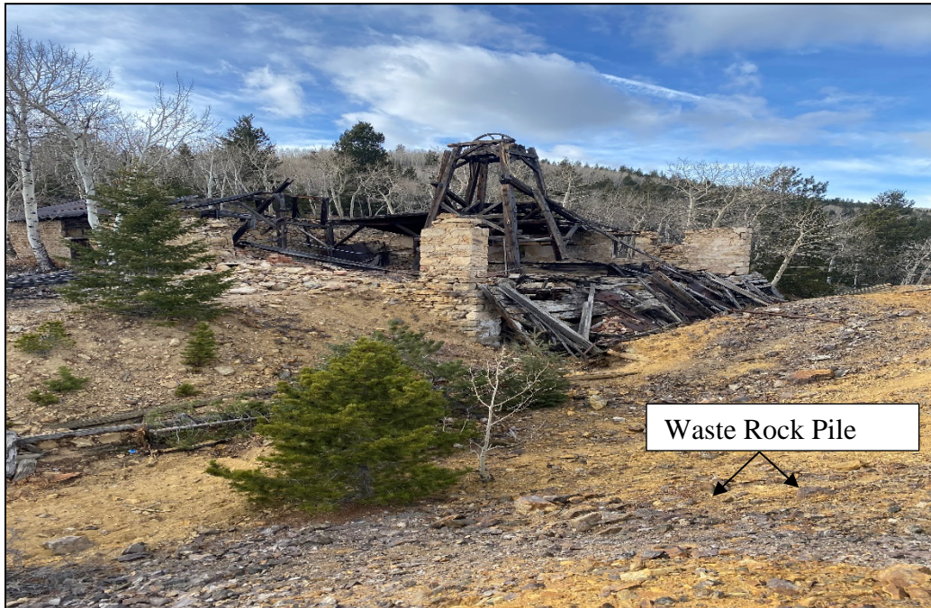
Photo 7. Gunnell Mine headframe and historic structures.