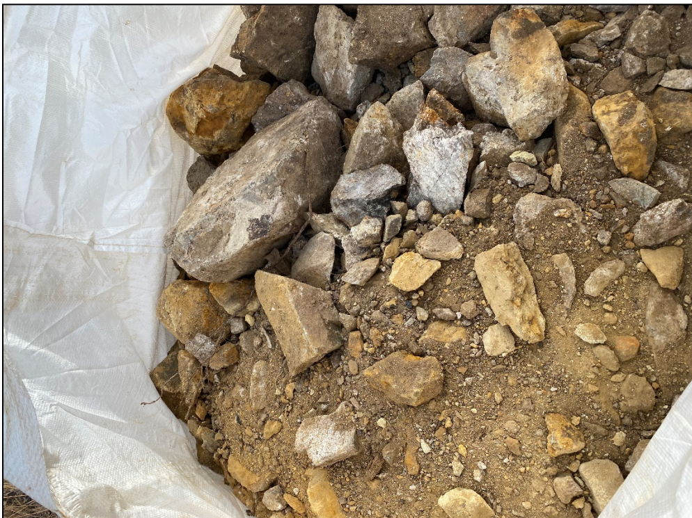
Photo 2. Waste rock in super sacks.