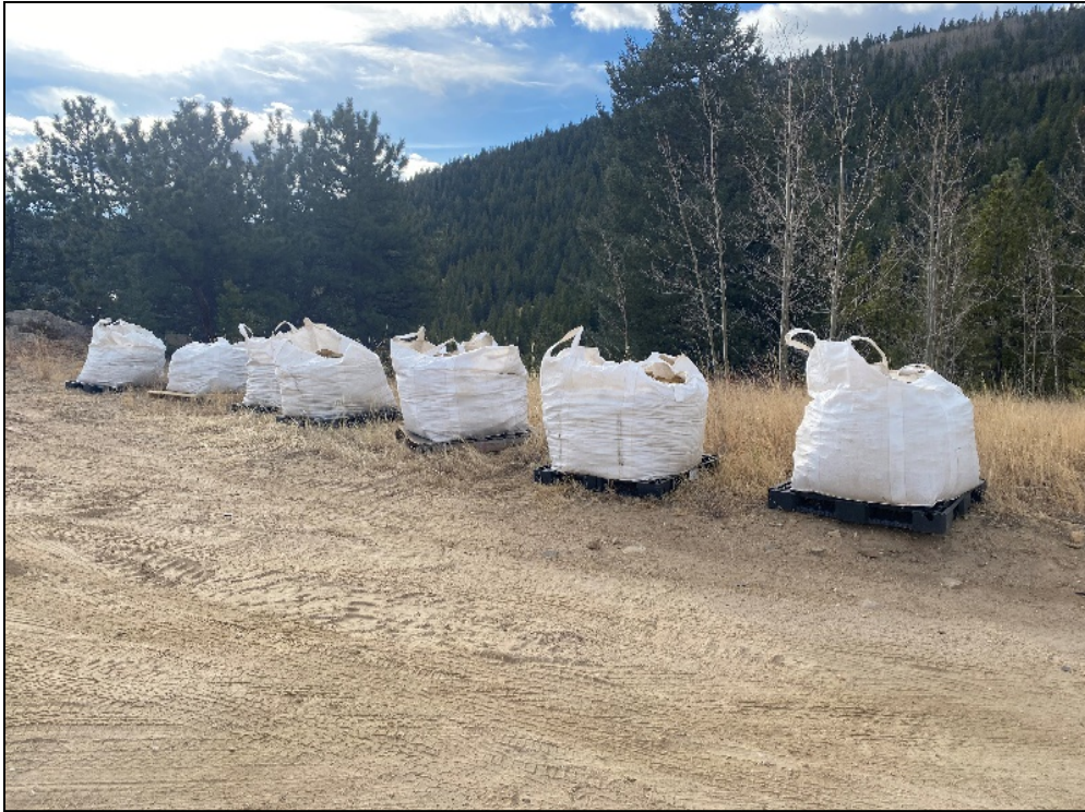
Photo 1. Super sacks at primary staging area.