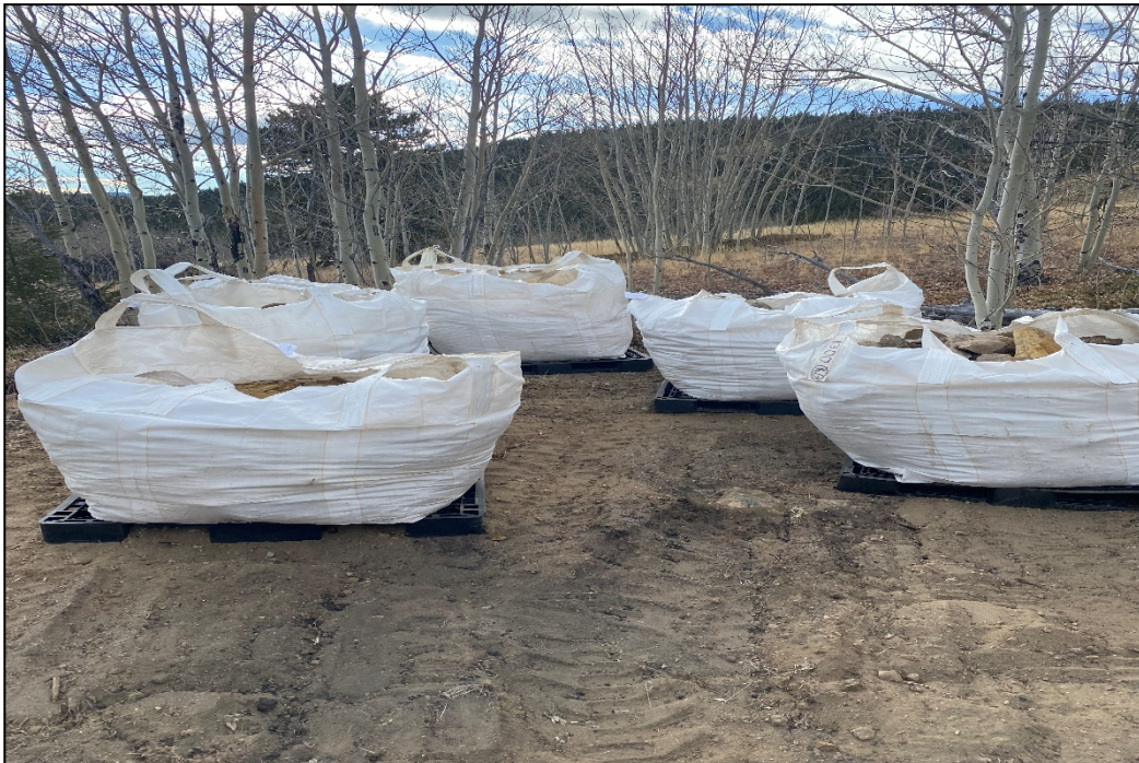
Photo 6. Super sacks at secondary staging area.