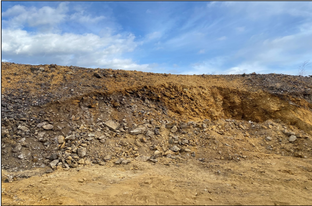
Photo 9. Excavation into face of WRP.