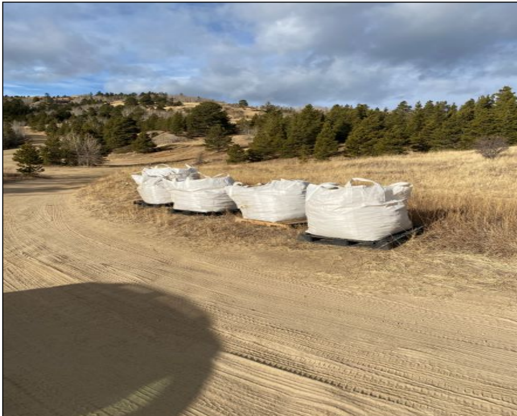
Photo 4. Additional super sacks at primary staging area.