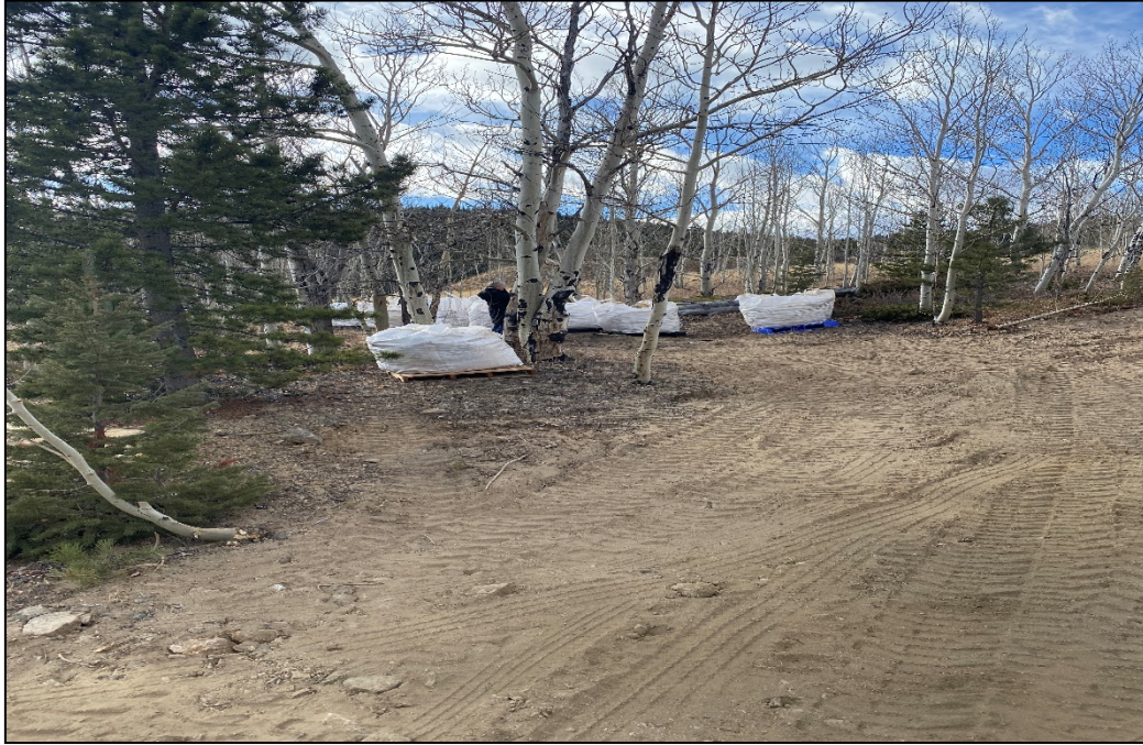
Photo 5. Super sacks at secondary staging area.