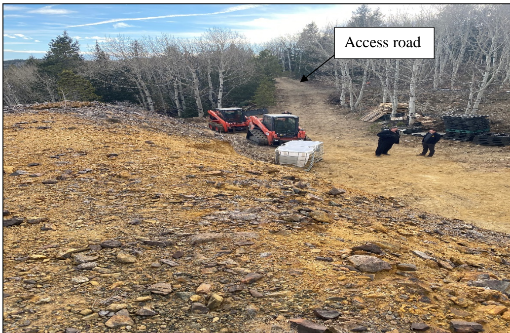
Photo 8. Top of WRP looking down into excavation area. (Photo taken facing east)