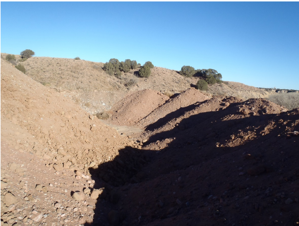
Photo 2. Area A (looking ENE – stockpiles for visual berm construction).