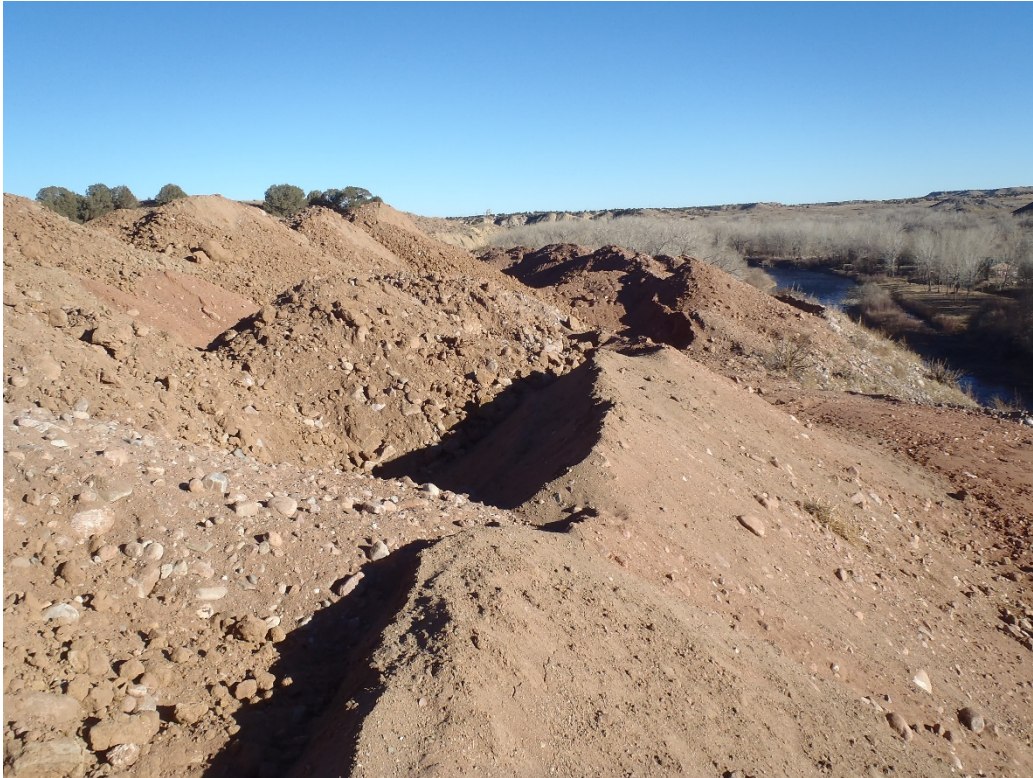
Photo 1. Area A (looking ESE – stockpiles for visual berm construction).