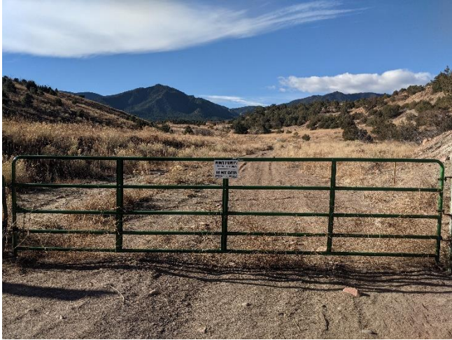
Locked gate at county road entrance.

Number of Partial Inspection this Fiscal Year: 0