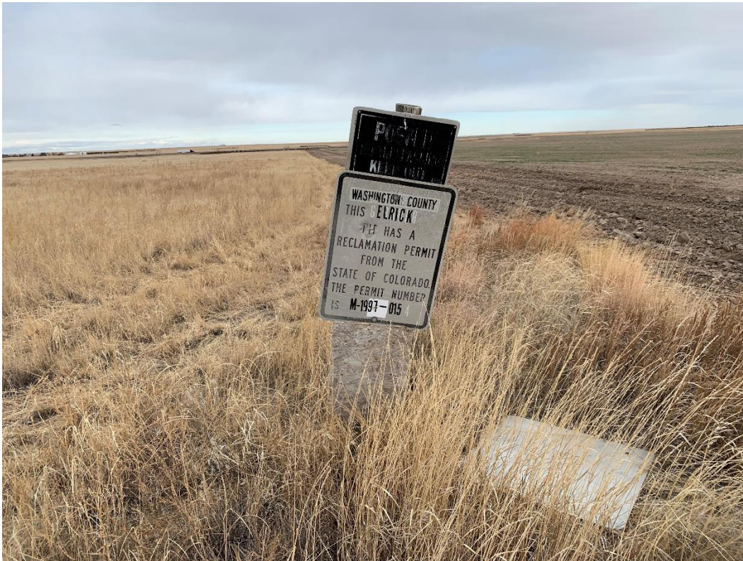
Photo 1- Mine entrance sign facing CR 40, facing north