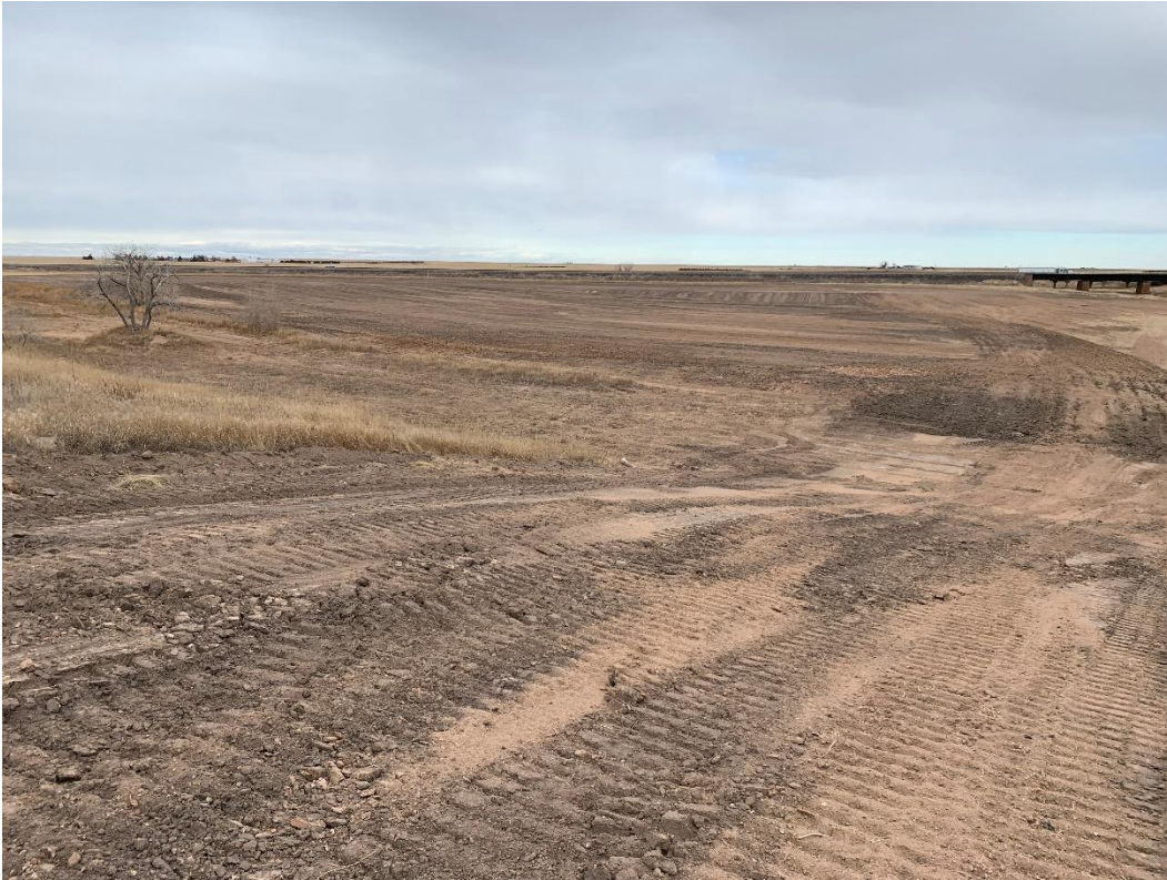
Photo 3- Pit bottom sloped toward creek in foreground, facing north