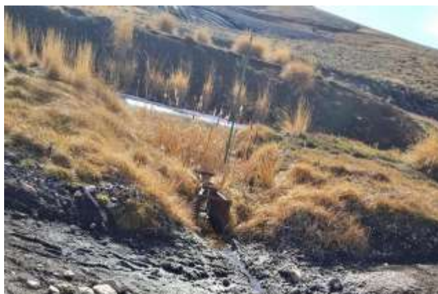
Pond B discharge.