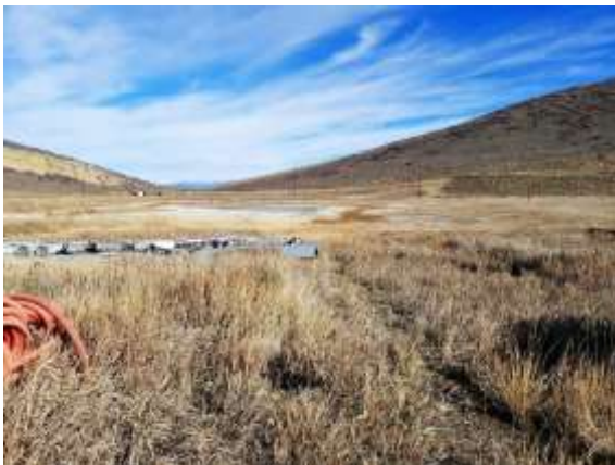
Pond G, mostly dry.