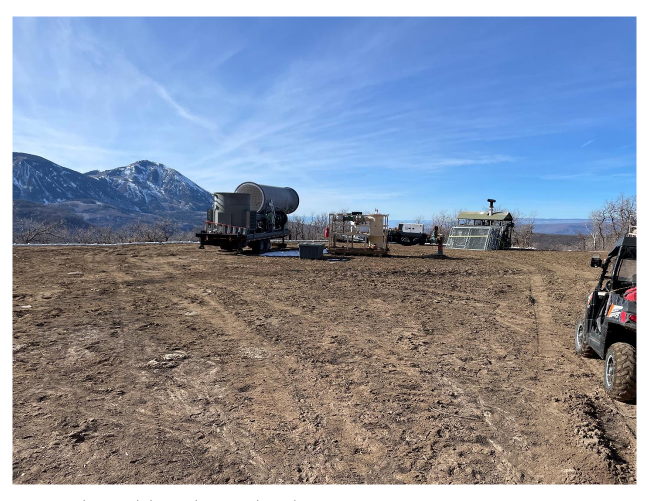
SS1-6. Has the stored Flare and is not reclaimed