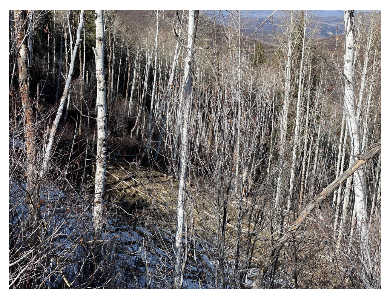
SS1-3 Was unable to walk to the pad. Was able to get a decent shot through some trees