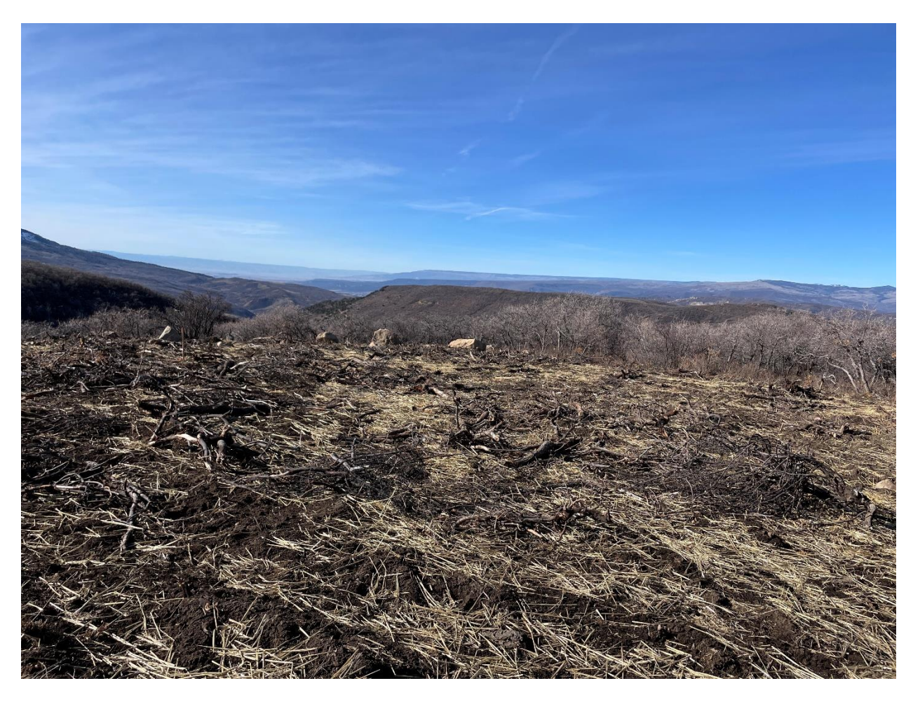
SS1-7 Picture #2