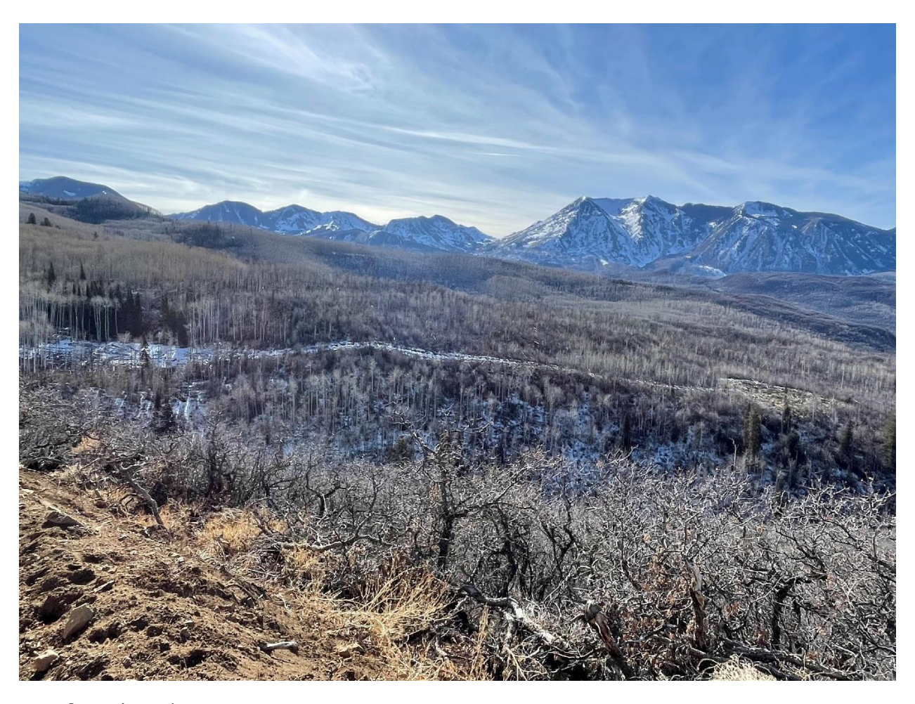
SS2-3&5 with road