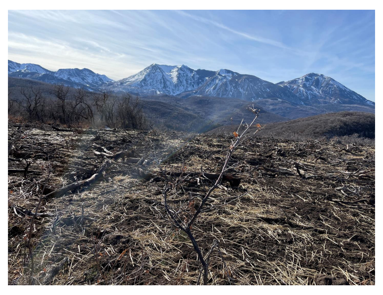
SS1-7 Picture #1