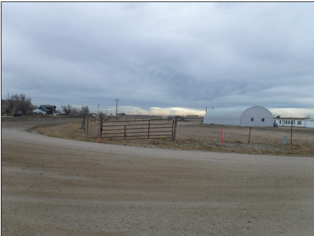
Photo 8: Looking south at the intersection of WCR 23 ½ and 23 ¾, conveyor corridor approximate limits are marked by laths