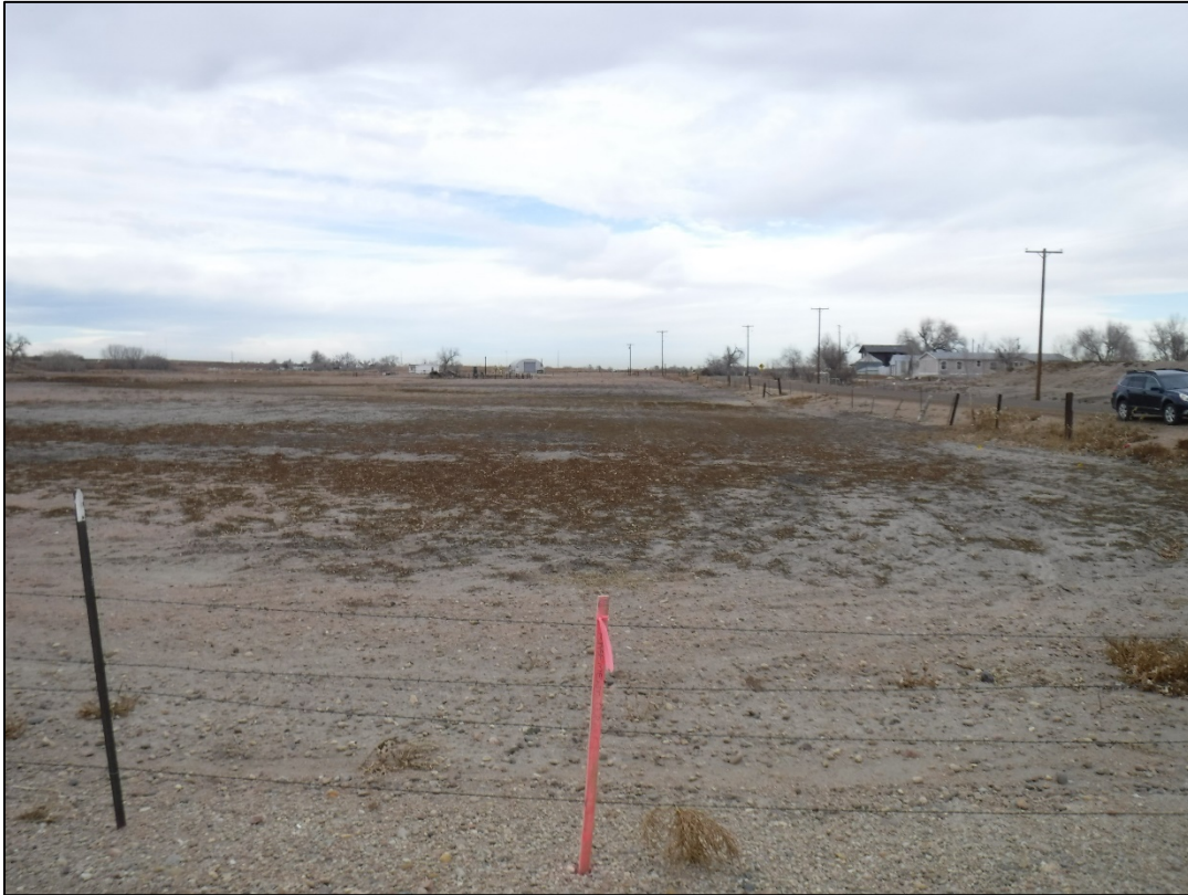
Photo 9: Looking north along conveyor corridor centerline, limits are marked by laths