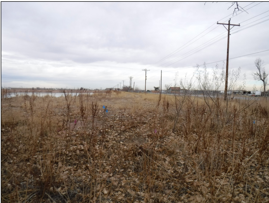
Photo 10: Looking north along conveyor corridor centerline into the Challenger Res. area