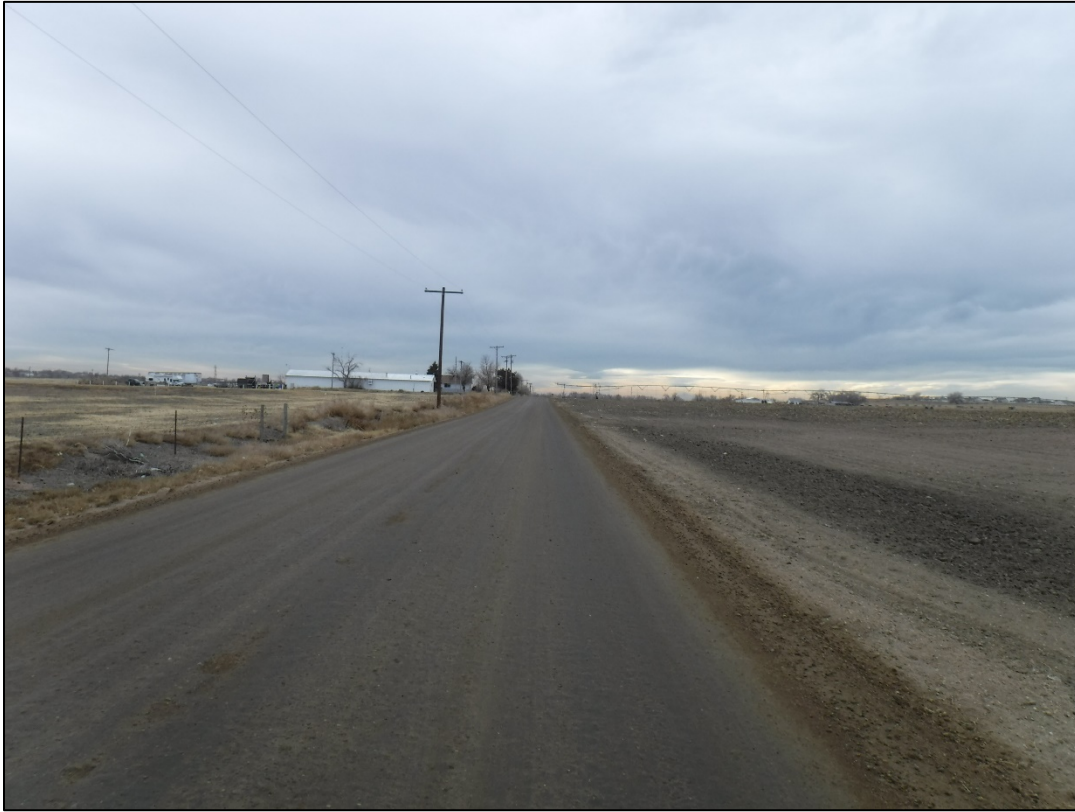
Photo 7: Looking south along WCR 23 ½, conveyor corridor is on the right