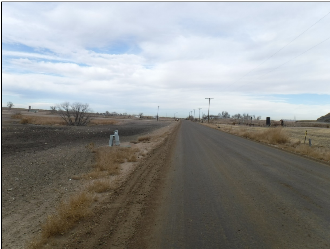
Photo 6: Looking north along WCR 23 ½, conveyor corridor is on the left