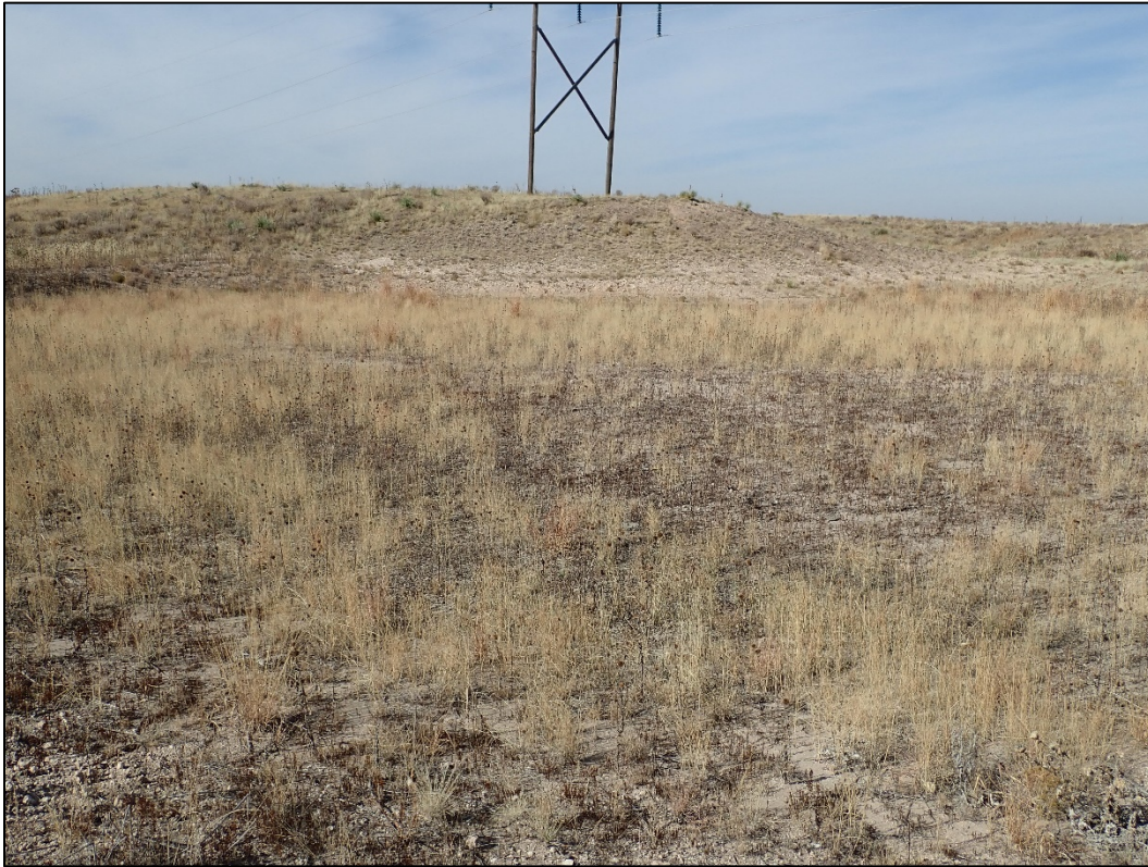
Photo 3. Sample photo of reclaimed mine disturbance; looking west.

Dave Hornung Kit Carson County P.O. Box 249 Burlington, CO 80807