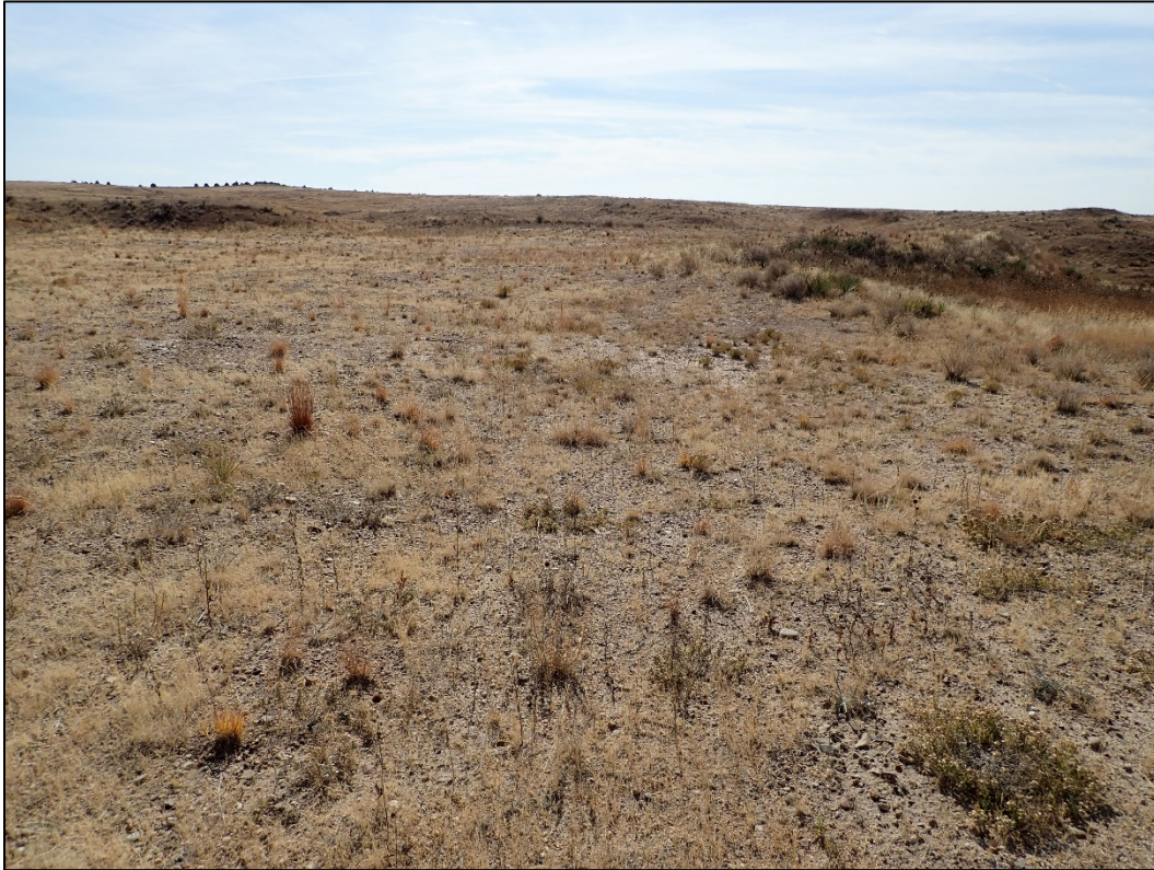
Photo 1. Sample photo of reclaimed mine disturbance; looking south.