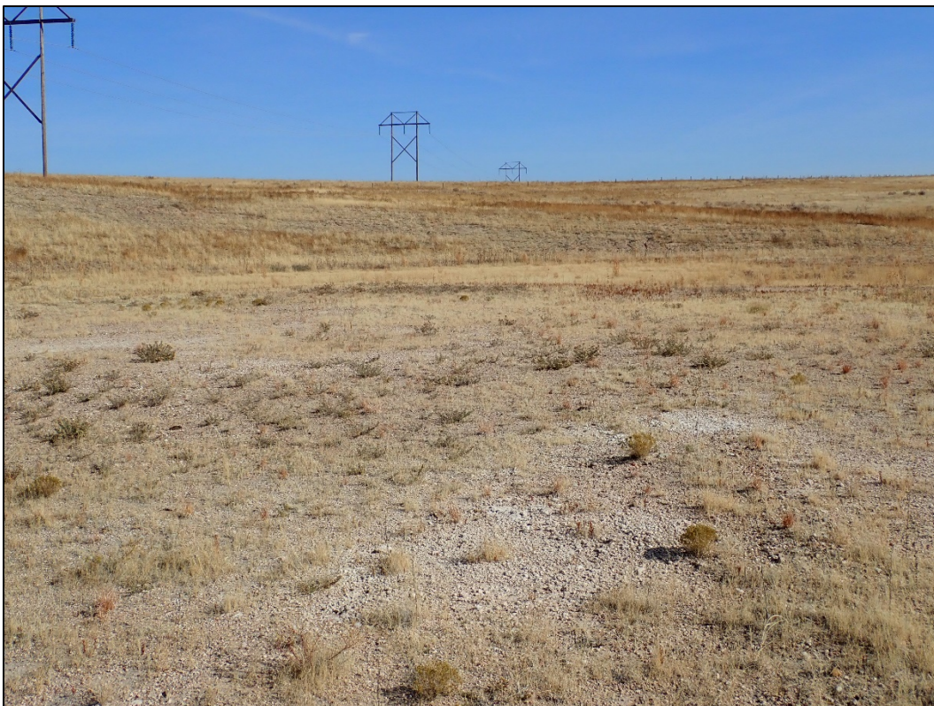
Photo 2: Sample photo of reclaimed mine disturbance; looking east.