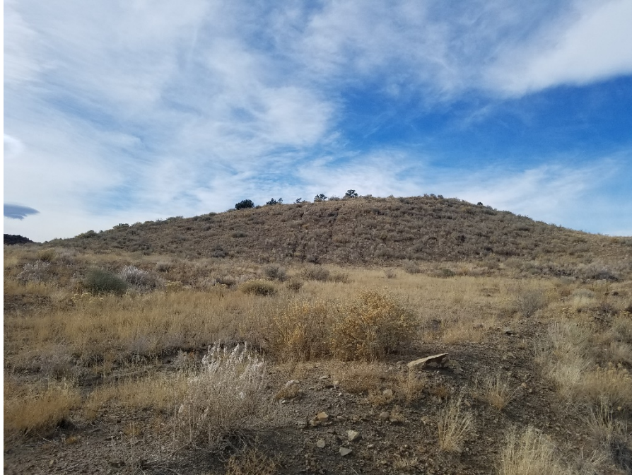
Figure 3. 2004, 2005 and 2006 revegetated area. From the east side looking west.

Number of Partial Inspection this Fiscal Year: 3