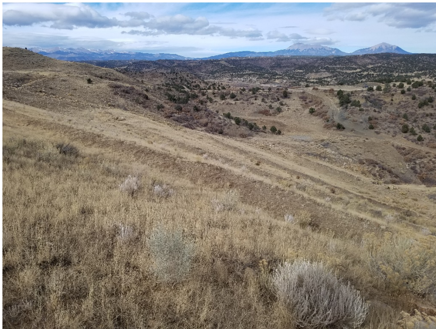
Figure 2. Fill 008

Number of Partial Inspection this Fiscal Year: 3