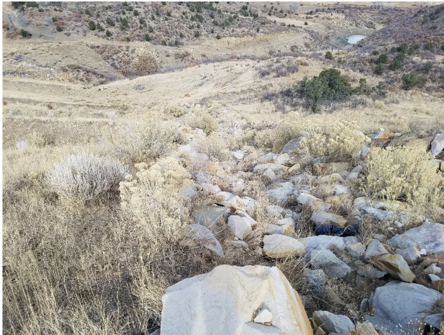
Figure 1. Ditch D83 on the south side looking north.