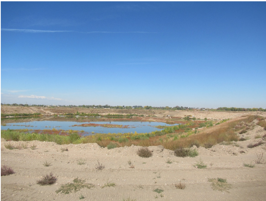
View of the SW Pond from the southeast corner looking northwest