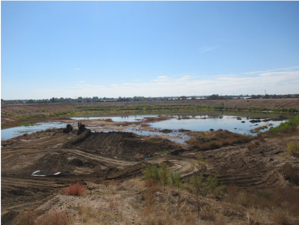
View of the SW Pond from the north shoreline looking south