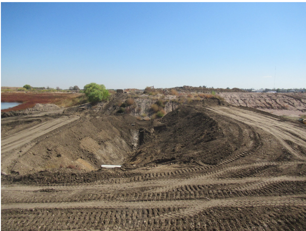
View of the interconnection structure between SW Pond and Pond A