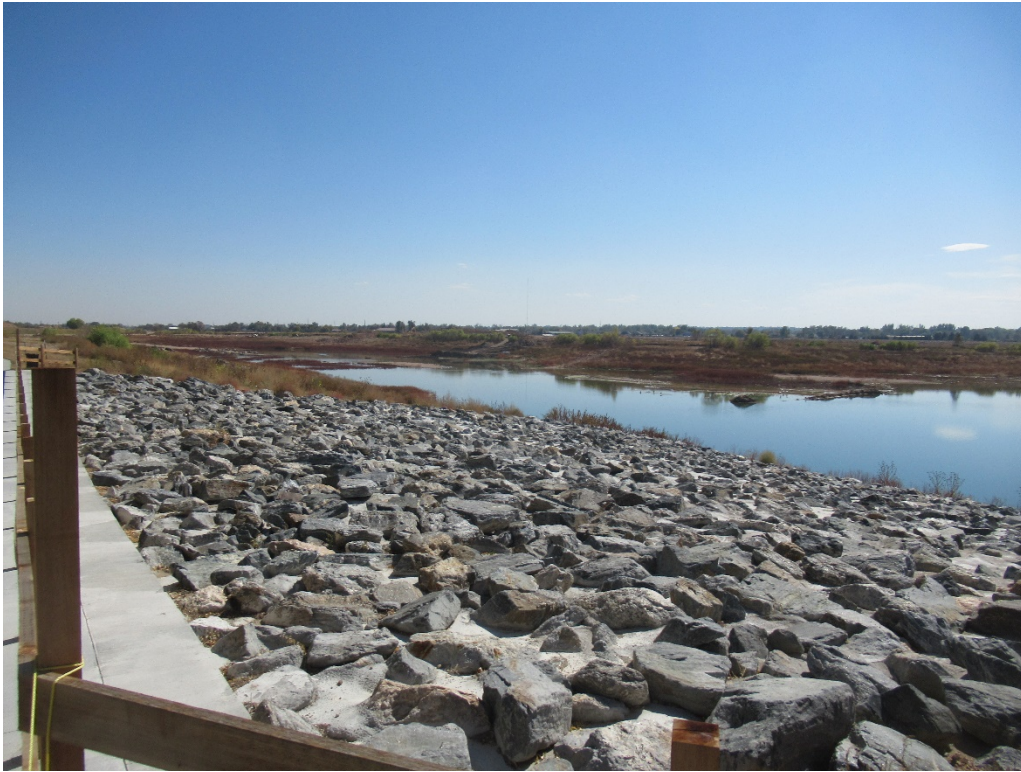
View of the inlet/outlet structure and Pond A looking southeast