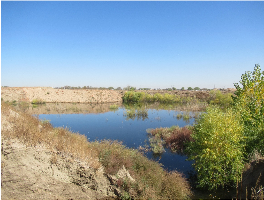
View of the remaining 2 acre pond in the SW Area from the southwest corner looking northeast