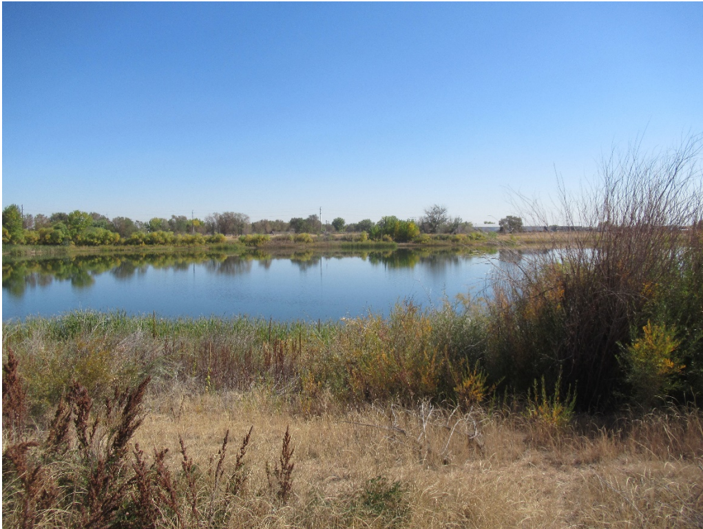
View of the NE Area pond from the west shoreline looking east