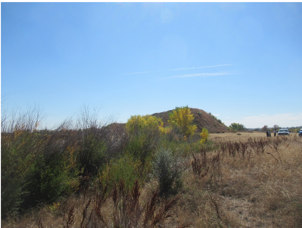
View of the backfill material located on the south end of the NW Area pond