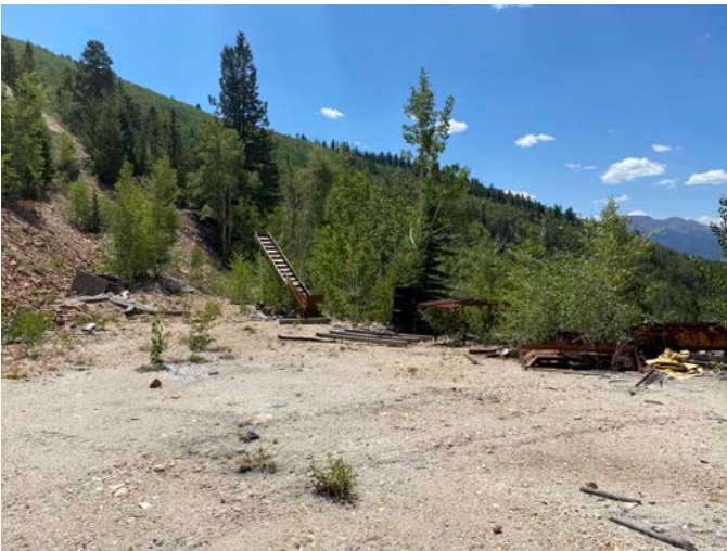
Level 3 Pad