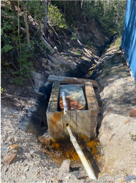
Water treatment- not repaired- waiting on new treatment system to be installed from TR4