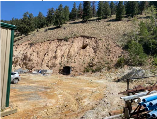
Portal- level 6