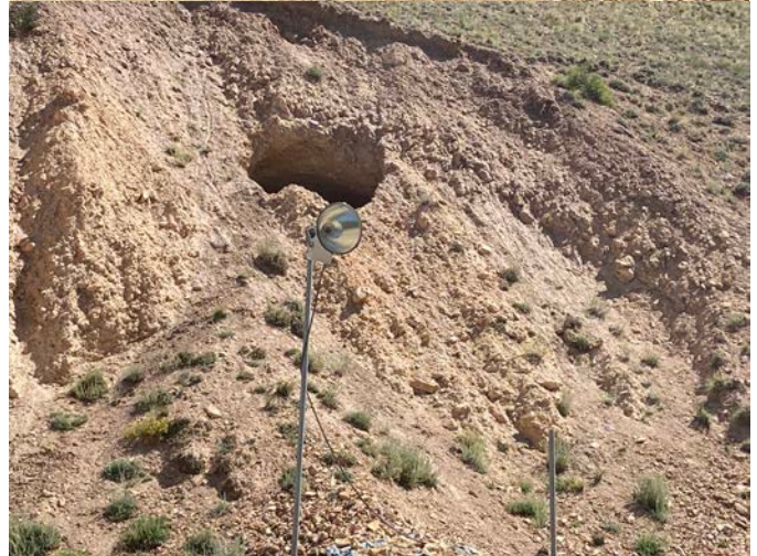
Subsidence/collapse to be repaired