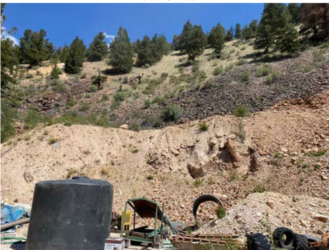
Debris on site- level 3