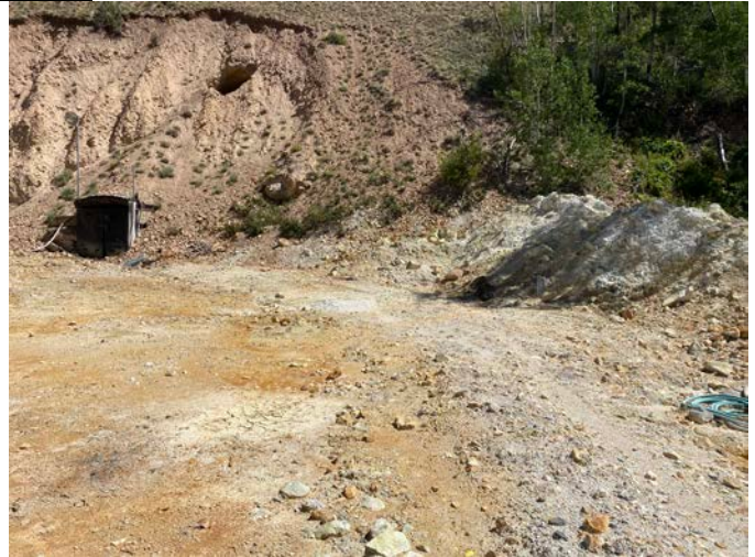
Level 6 Portal with Subsidence/Collapse above