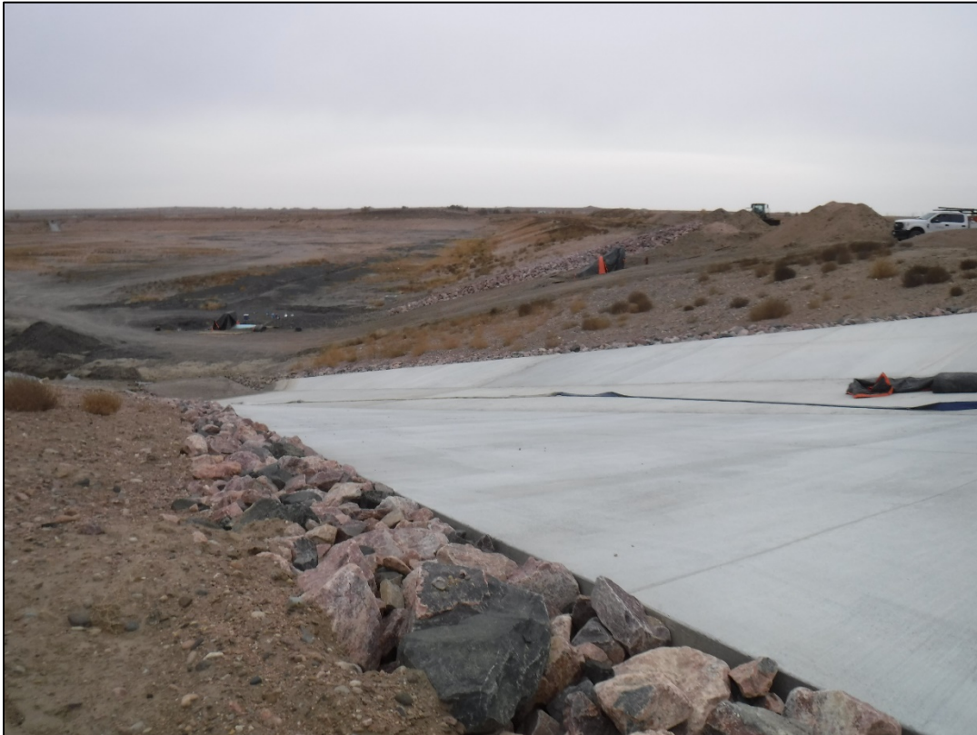
Photo 1: Looking at the recently constructed outfall of the reservoir in the southeast corner