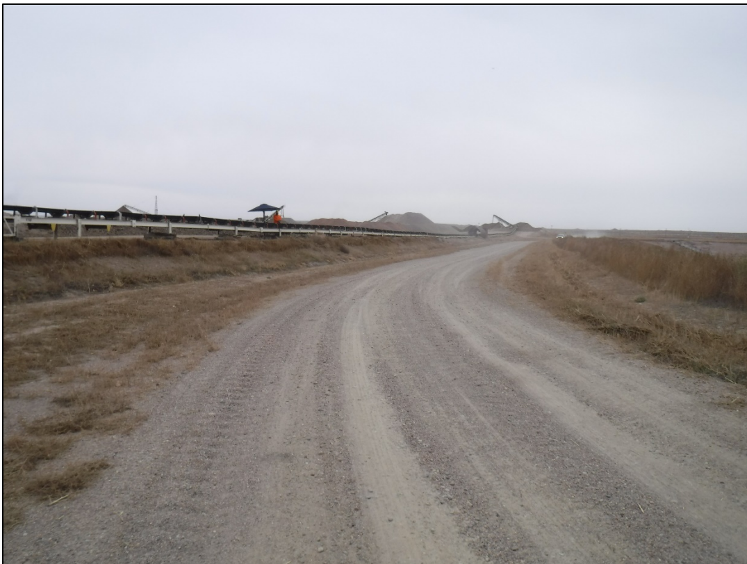
Photo 10: Conveyor belt corridor along southwestern reservoir boundary