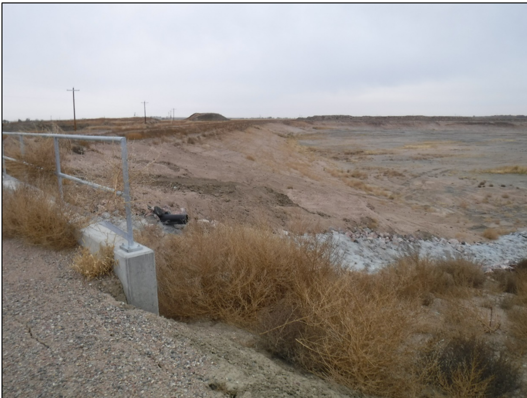
Photo 4: Looking east from northwest corner, the rundown structure in center of picture is used for filling