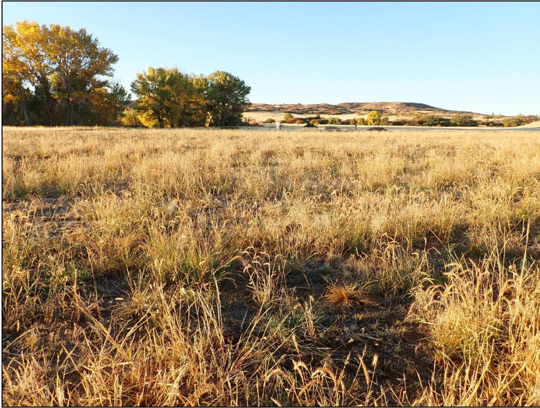
Photo 7. Sample photo of reclaimed mine disturbance; looking south.