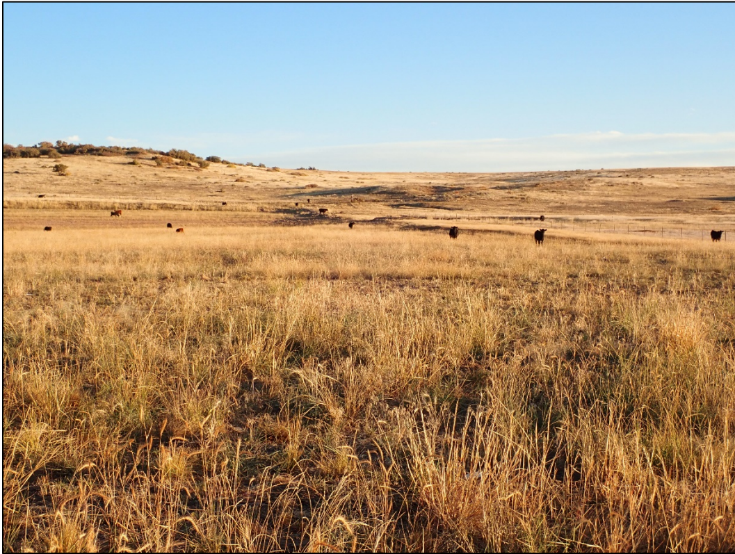
Photo 3. Sample photo of reclaimed mine disturbance; looking north.