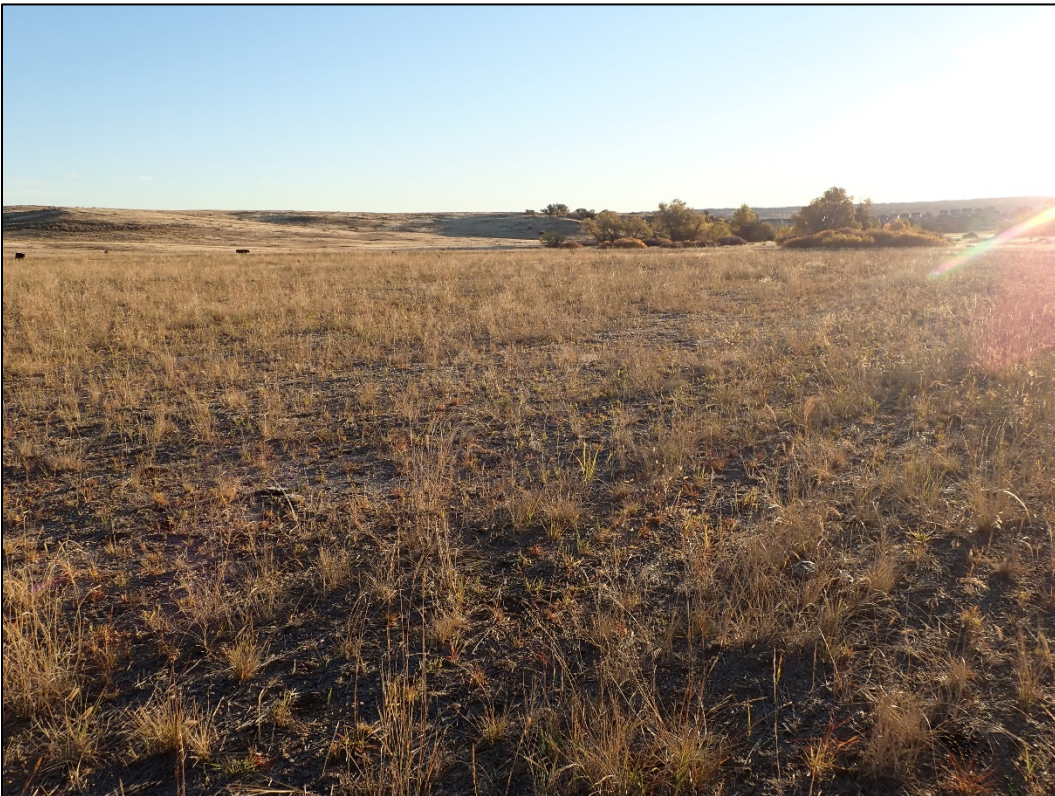
Photo 6. Sample photo of reclaimed mine disturbance; looking northeast..