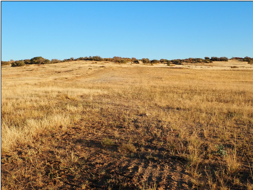
Photo 4. Sample photo of reclaimed mine disturbance; looking northwest.