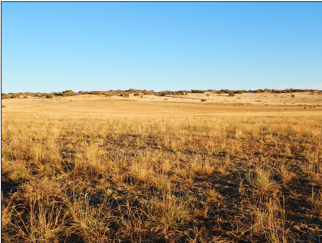
Photo 2: Sample photo of reclaimed mine disturbance; looking northwest.