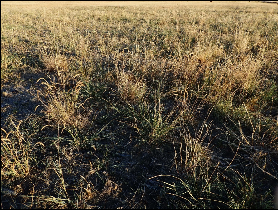
Photo 5. Sample photo of reclamation grasses and reestablished vegetative cover; looking north.