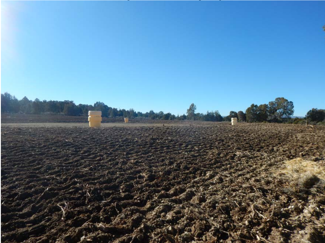
New up-gradient well pad