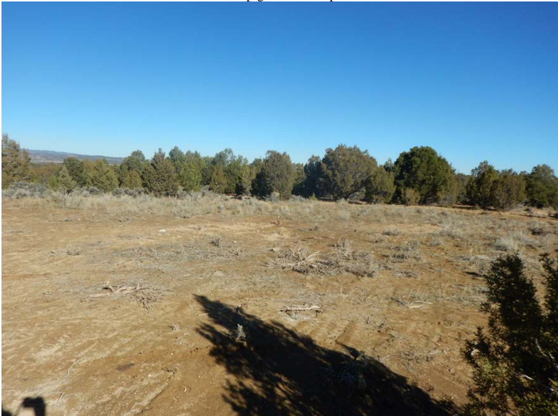
IRI-9 surface disturbance