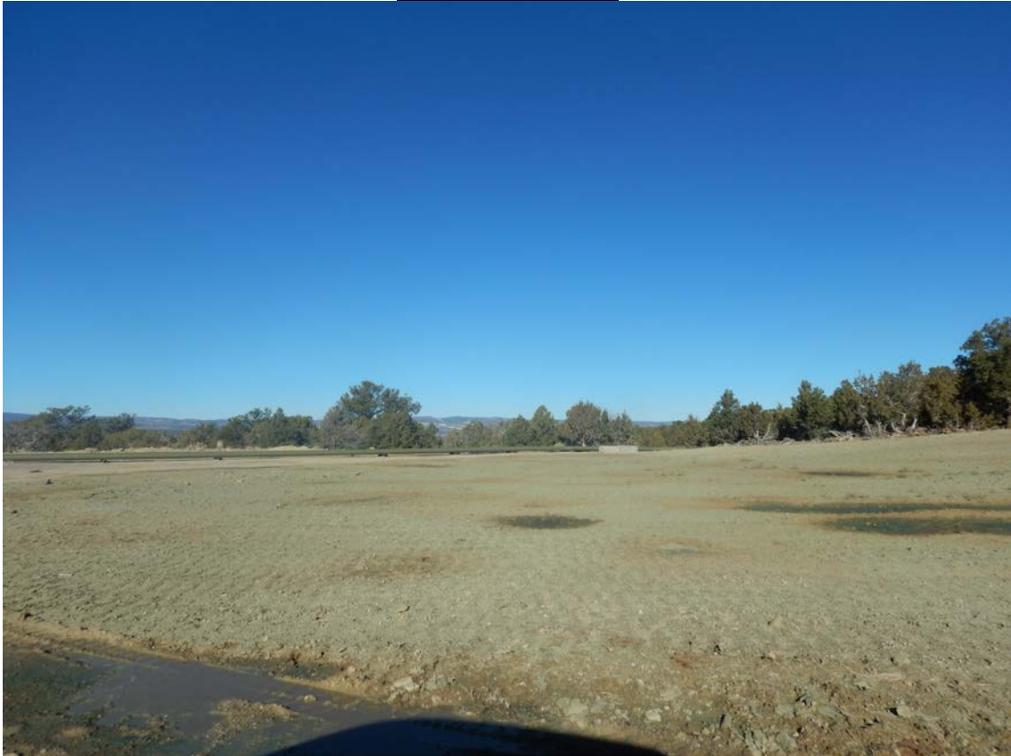
Hydroseeded Pad 8