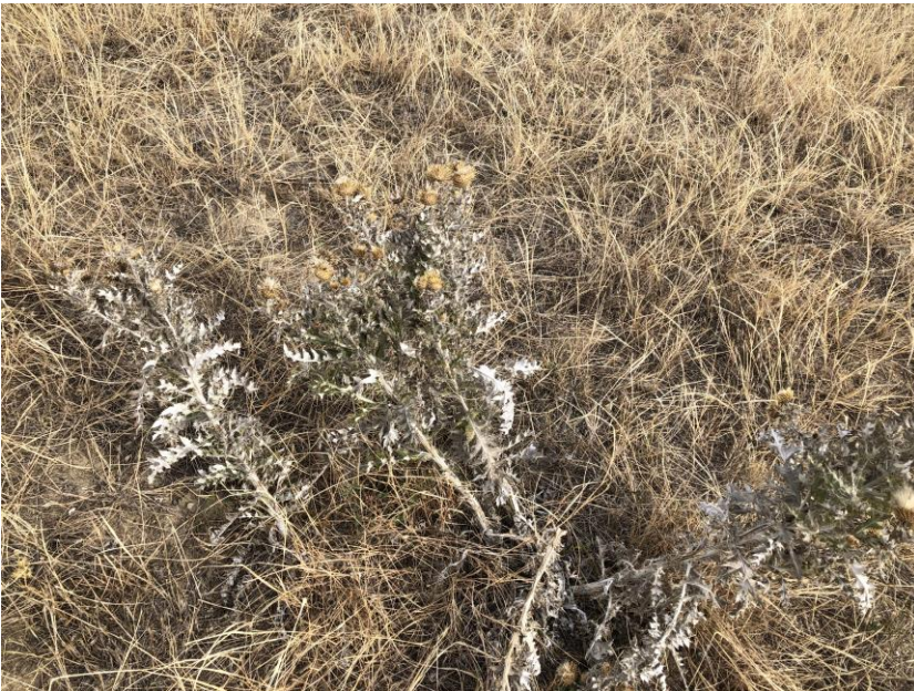
Thistle plant – likely Canada thistle