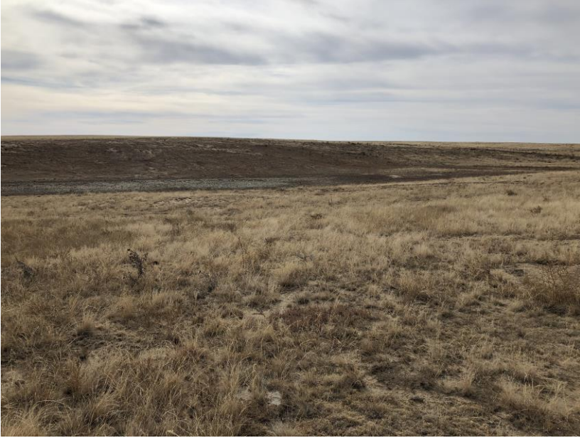
Pond area (dry)