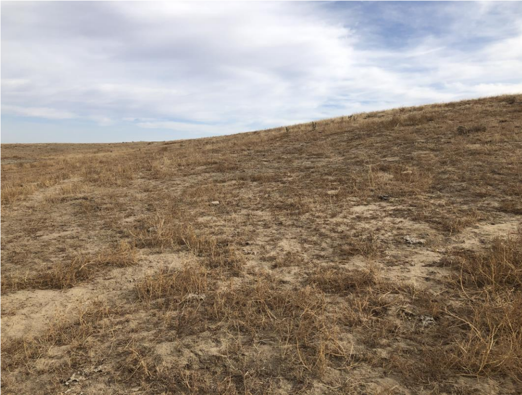
Reclaimed area south of the pond with poor revegetation success