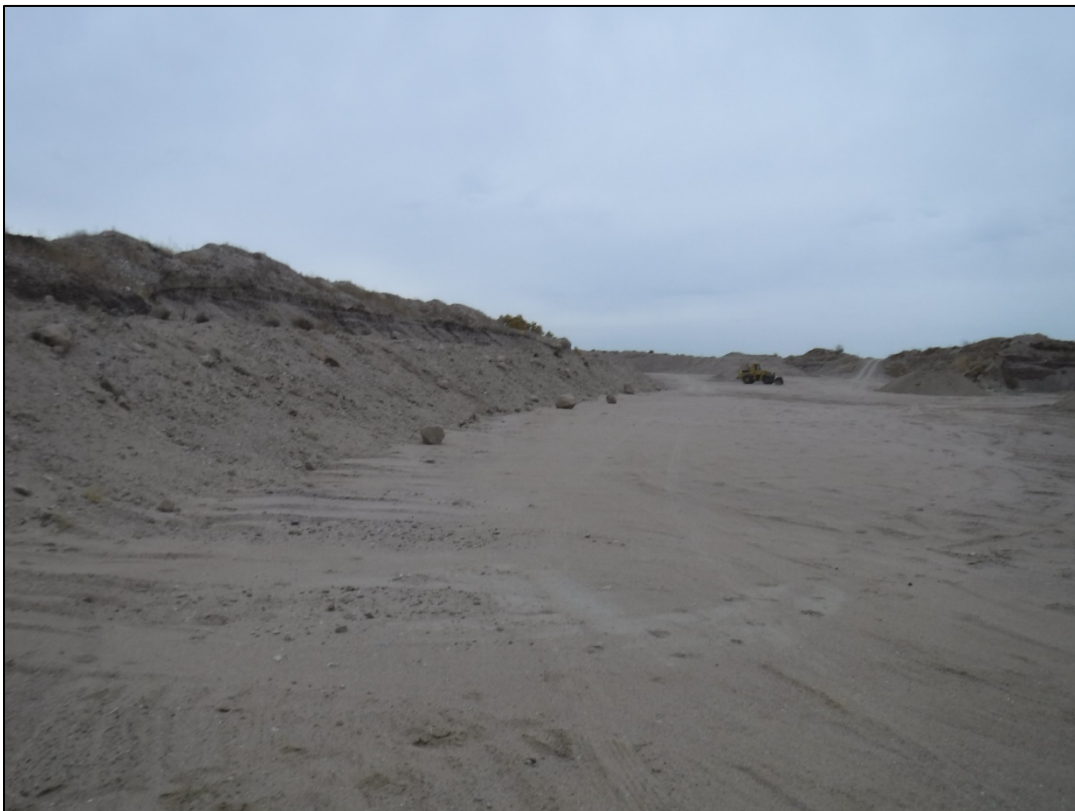
Photo 8: Northern highwall looking east from northwest corner of pit