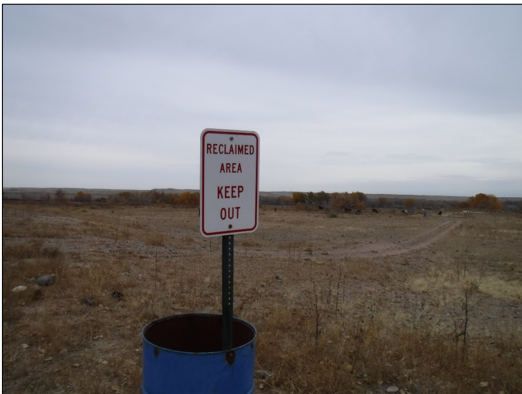
Photo 2: Reclamation sign near the 12 acres of reclaimed permit area