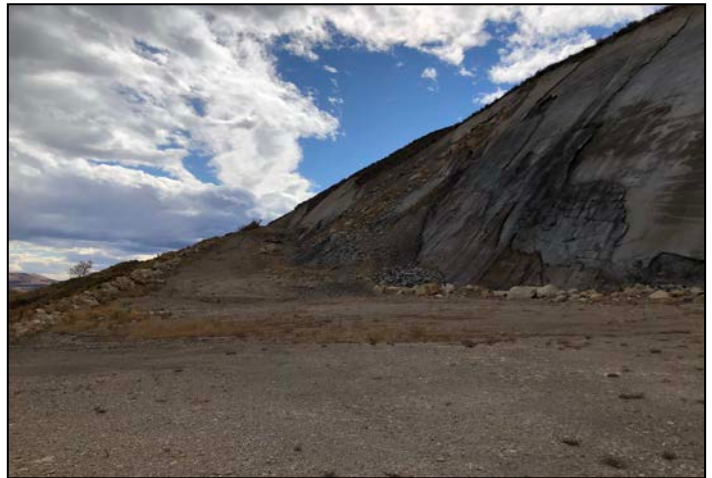
Photo 2 – Existing working face and stockpile area of current permit.