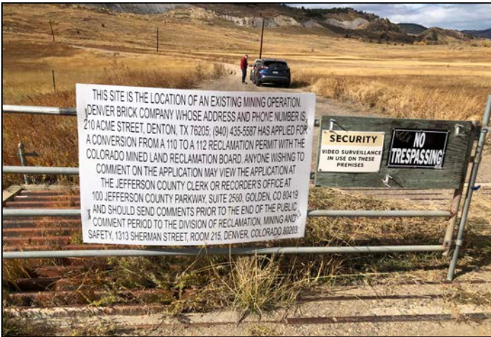
Photo 1 – “Notice of Conversion Applied For” sign at entrance from Hwy 93.