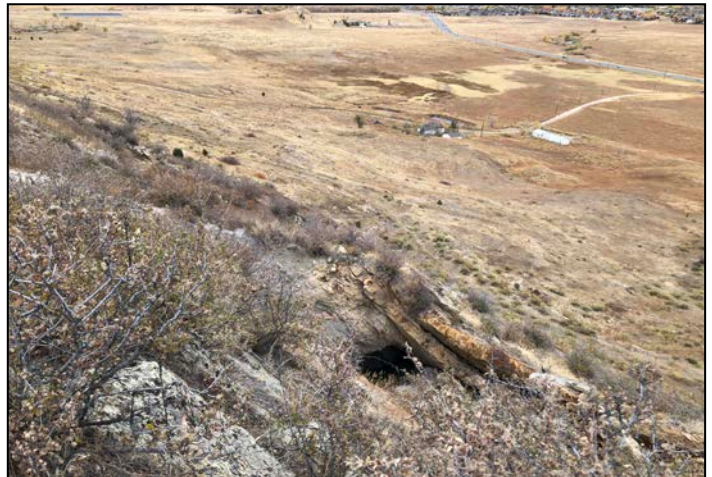
Photo 4 – Example of historic feature currently outside of existing permit that would be mined through and reclaimed if permit is expanded.