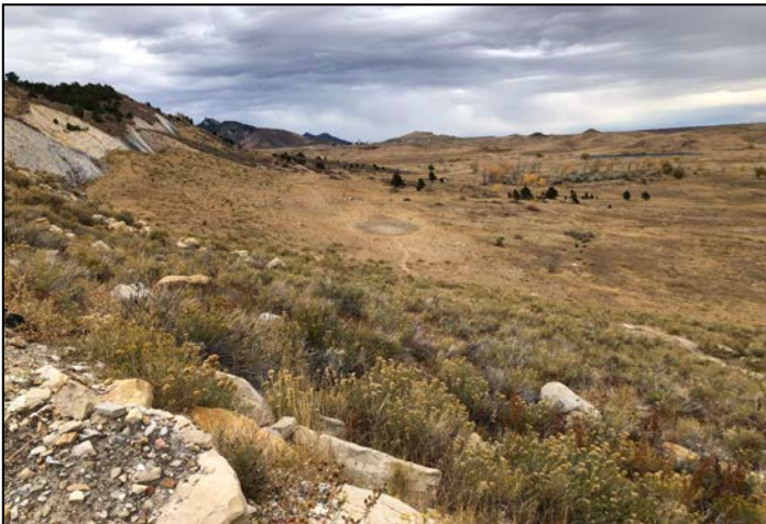
Photo 3 – Note difference in appearance between recently reclaimed area (previously the Flintlock Mine) at top of photo and existing historic mining disturbance at bottom of photo.