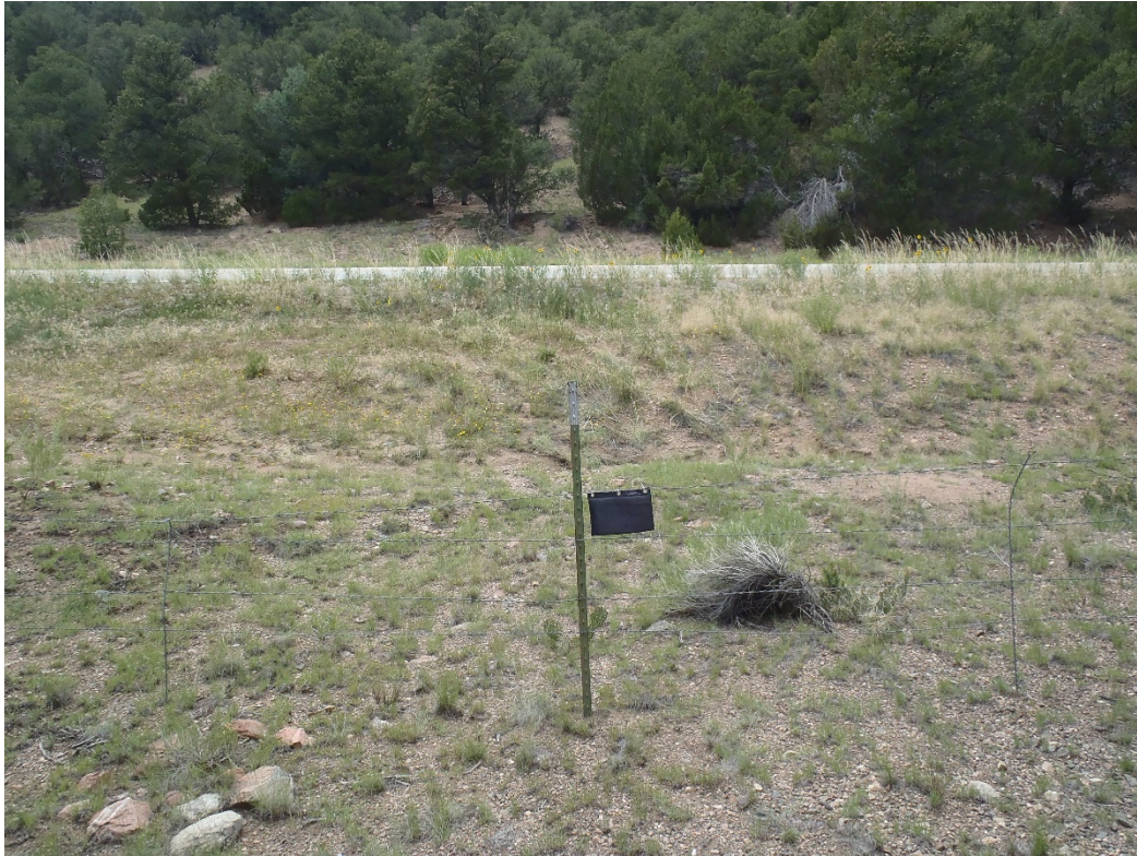
Photo 3. Proposed new access from Hwy 69 (looking west towards Hwy 69).