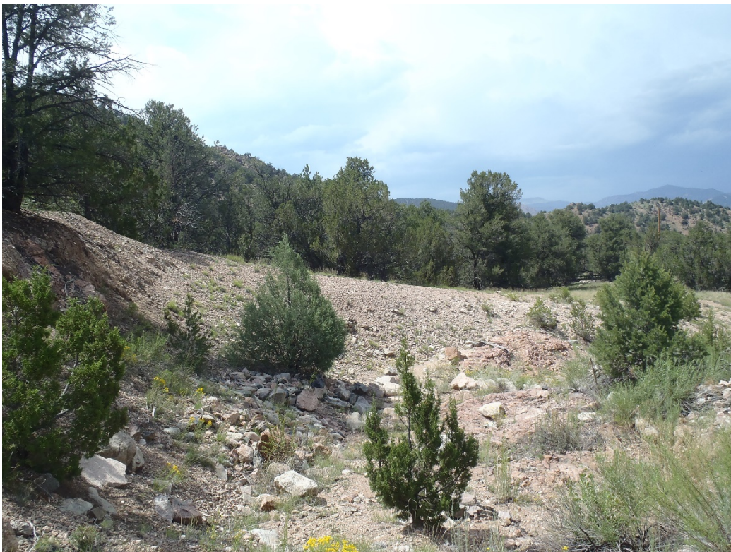
Photo 2. Proposed new access from Hwy 69 (looking NW from RR grade near NW permit corner).