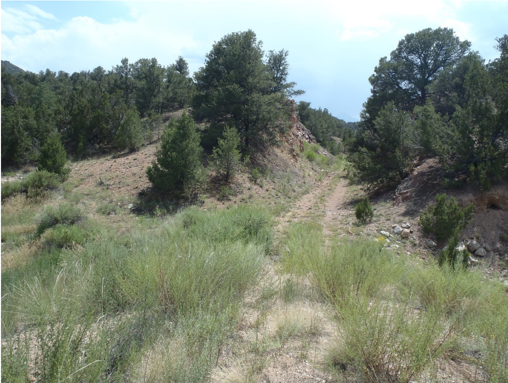
Photo 1. Existing two-track road from near NW corner of permit area (looking SW).