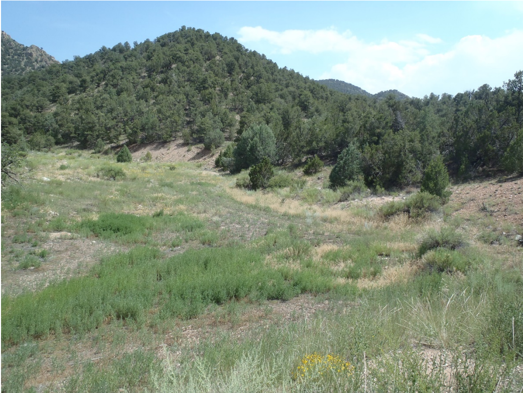
Photo 5. Area to be mined - essentially treed area, note bare soil between grassed and treed areas (looking SE from railroad grade on the NW corner of permit area).

Ed & Vi Lyons Mountain Valley Excavating LLC 228 County Road 251 Westcliffe, CO 81252