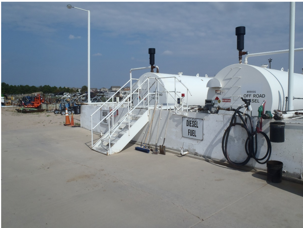
Photo 1. Diesel fuel storage tanks north of shop building (looking NW).