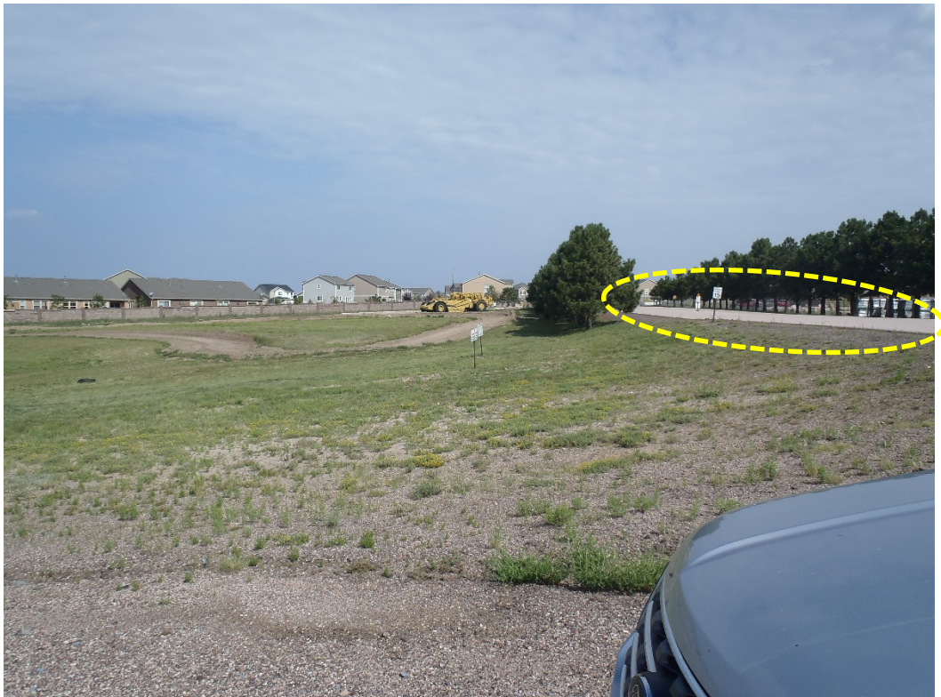
Photo 3. Paved main access road – north end of dirt bike track on left (north side, looking NW).