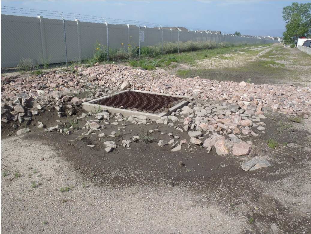
Photo 6. Grassed stormwater swale with grated drop inlet (south side, looking west).