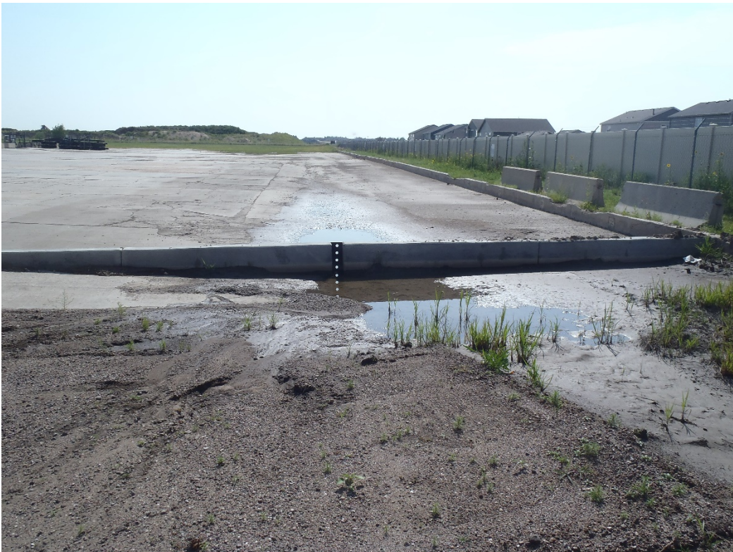
Photo 7. Paved stormwater swale with perforated discharge (south side, looking east).