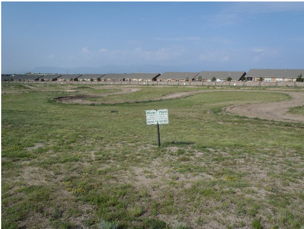
Photo 5. Permit sign – dirt bike track beyond (west side, looking SW).