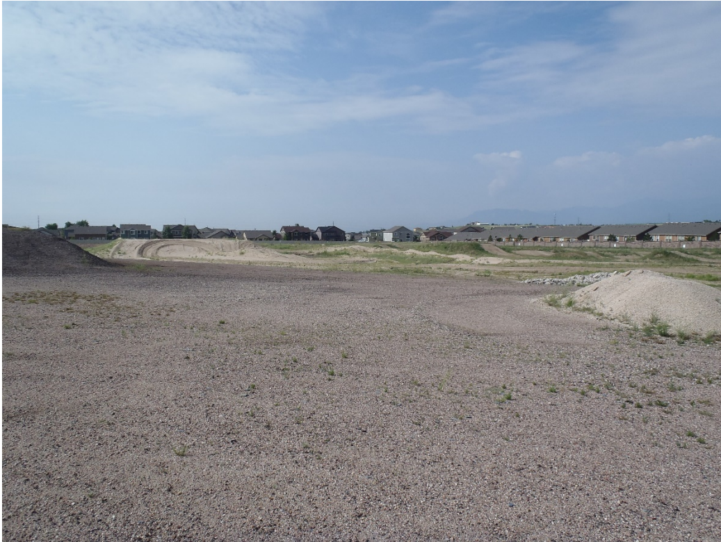
Photo 4. RAP and crushed concrete piles on edge of former pit – dirt bike track beyond (looking SW).