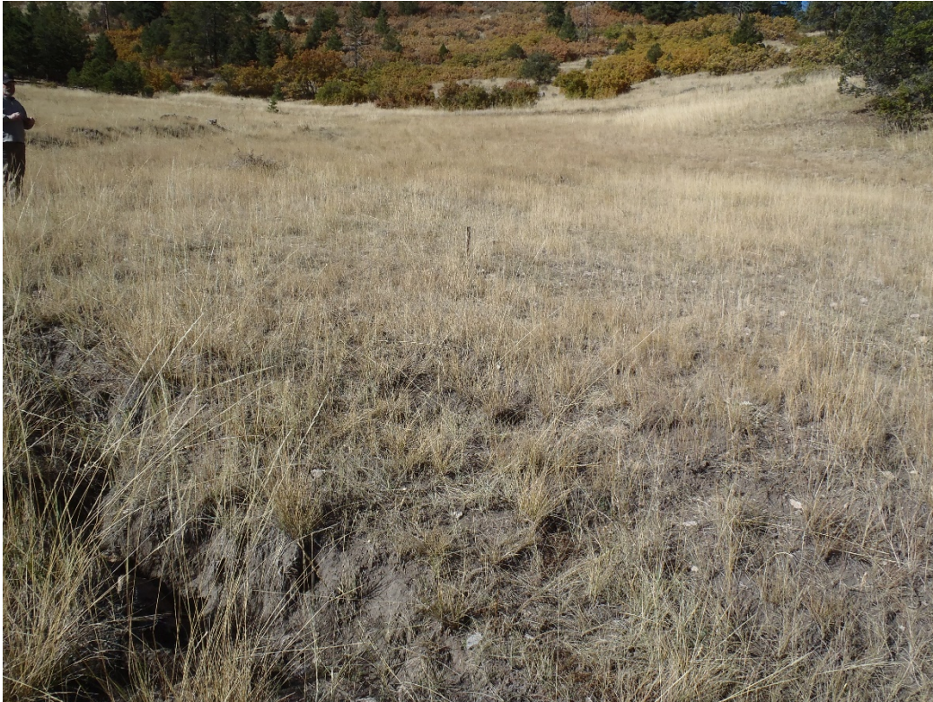
Photo 5. Revegetation at HNDD0011.