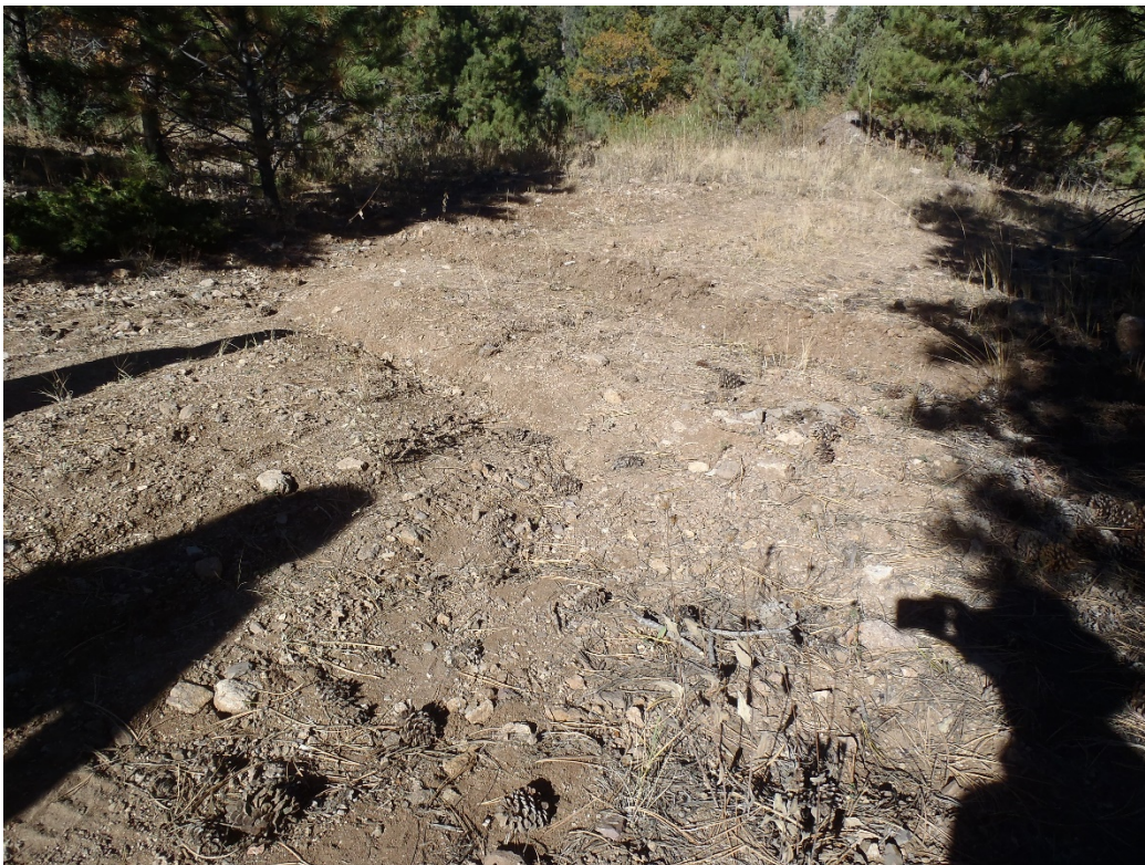
Photo 2. Water bars constructed in road to HNDD0010 (looking north).