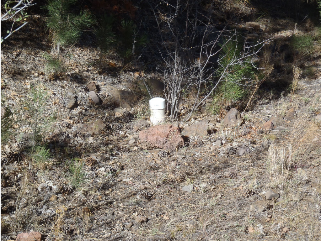
Photo 1. Capped PVC casing observed approximately 160 north of HNDD0009.