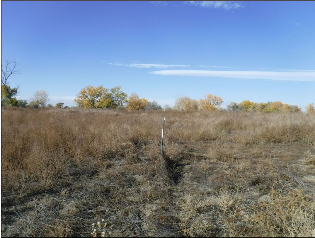
Photo 1: Looking west along the northern boundary of the 2010 disturbance