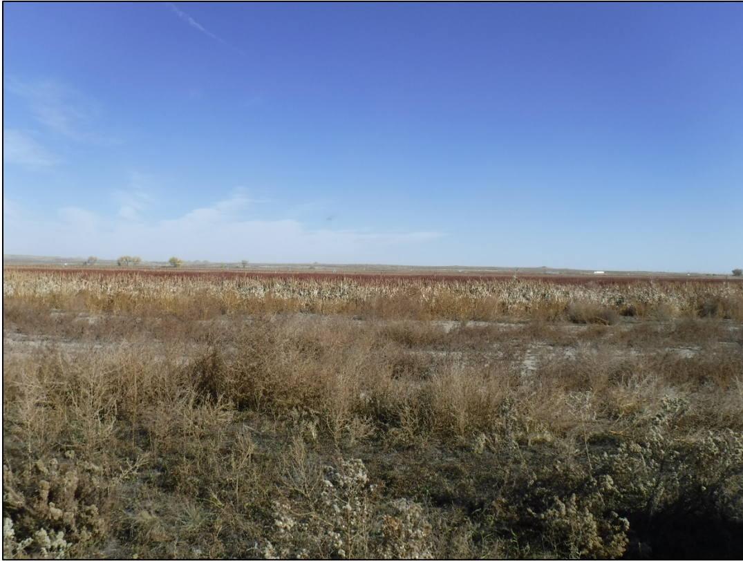
Photo 3: Looking north from the 2010 disturbance to the pivot field