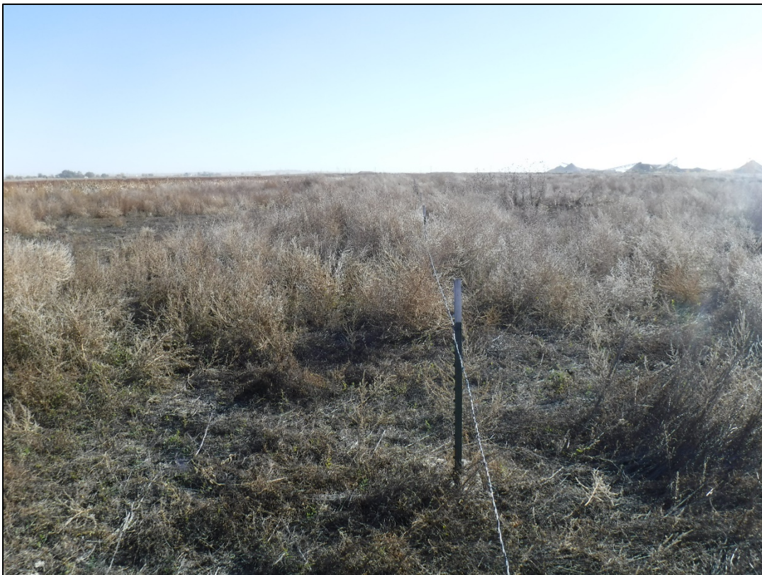
Photo 4: Looking east along the northern boundary of the 2010 disturbance, Pueblo East Pit (M2000-041) in background