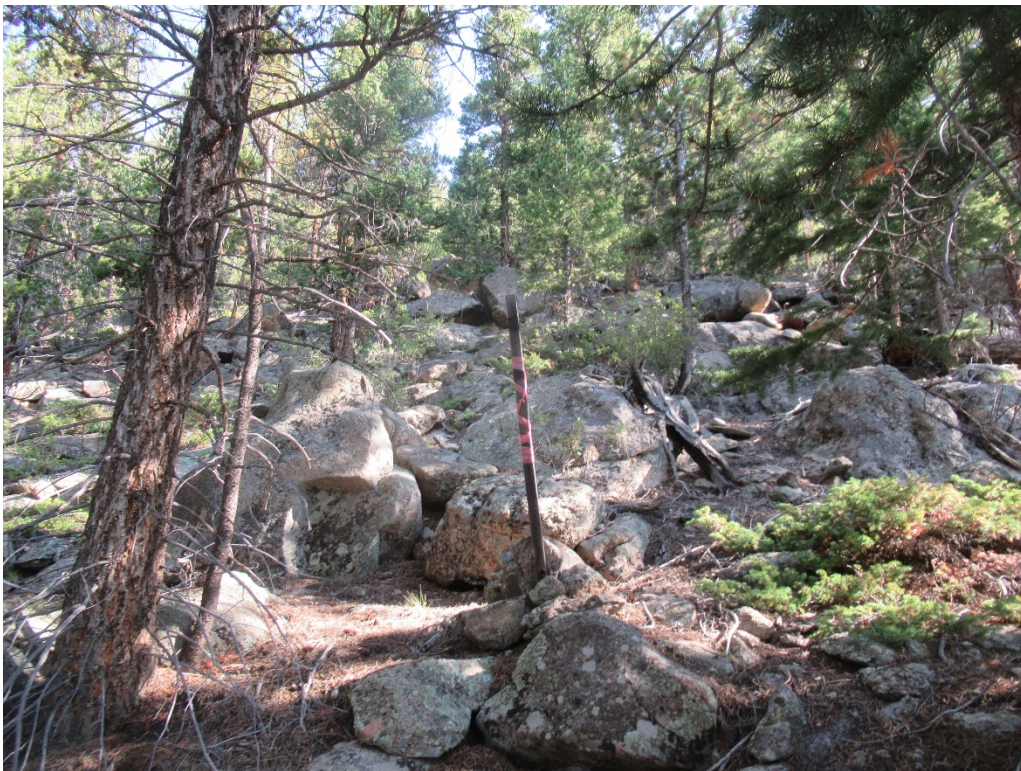
View of typical Dixie Mine boundary marker