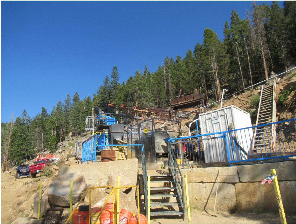
View of the Dixie Mine on-site mill facilities