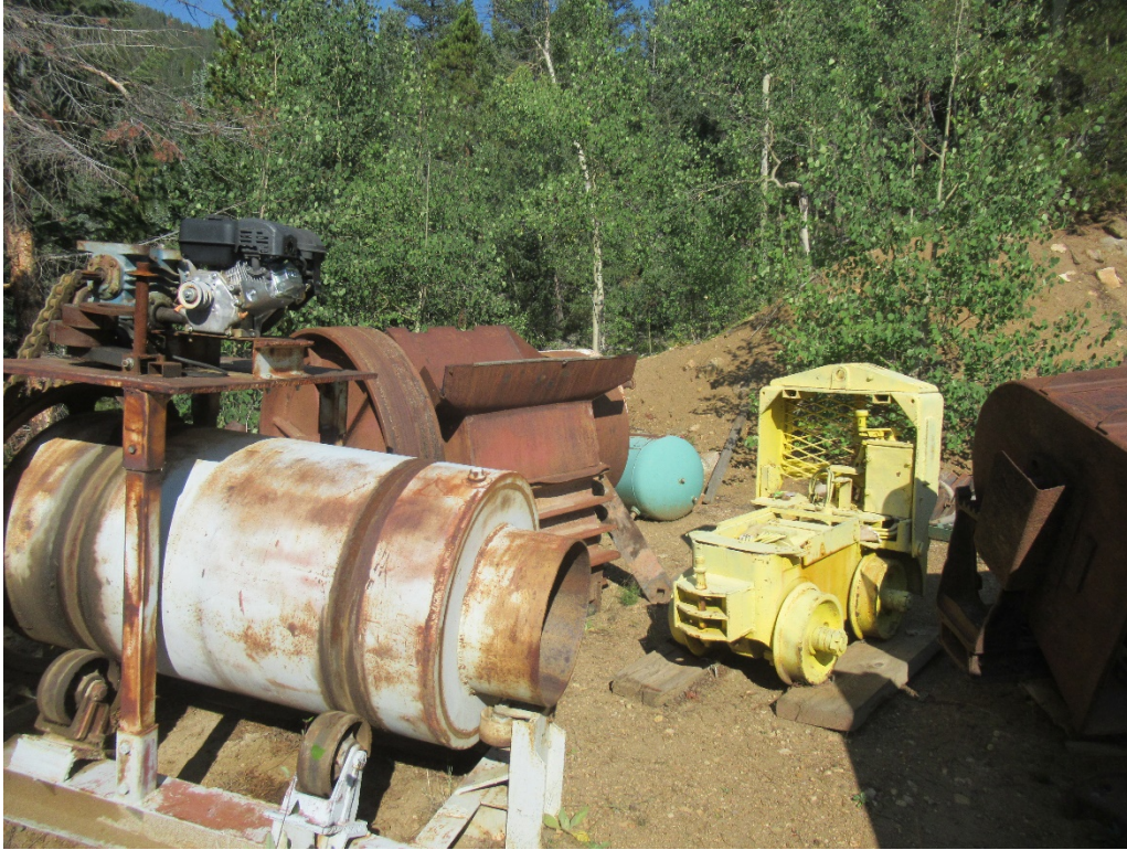
View of equipment storage as shown in the complaint picture