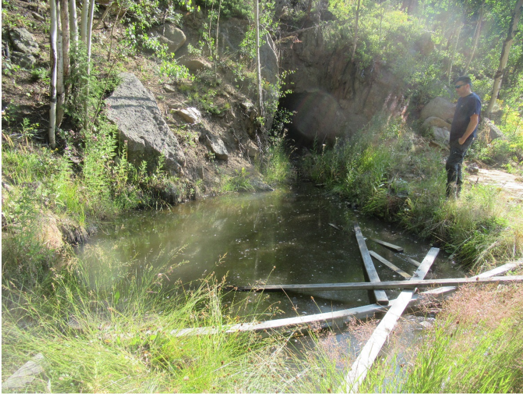
View of the MM adit and adit pool