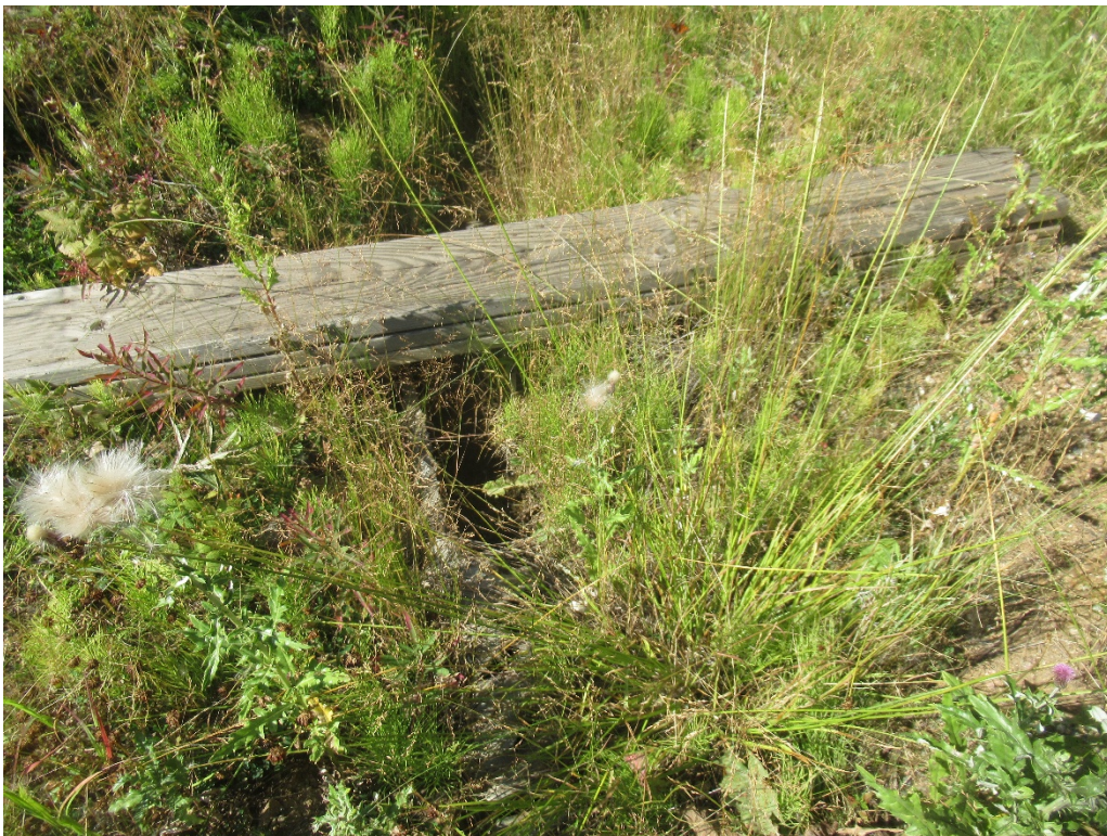
View of the ditch from the adit pool towards Ute Creek