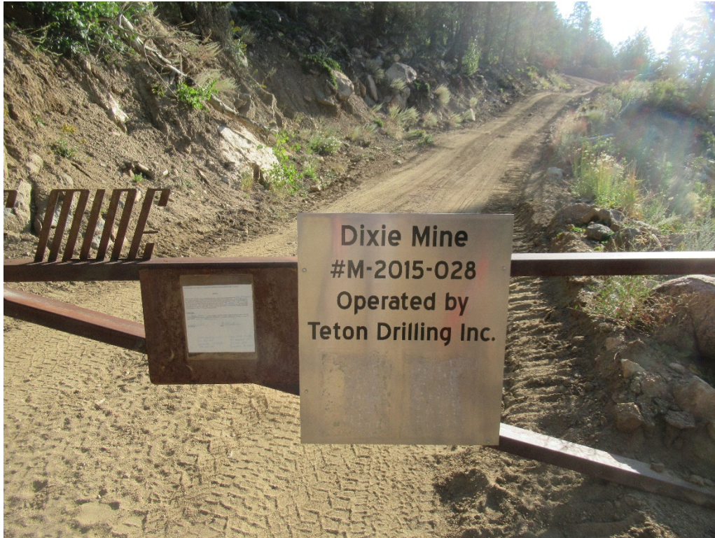
Dixie Mine mine sign