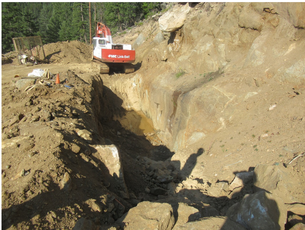
View of the Dixie Mine trench