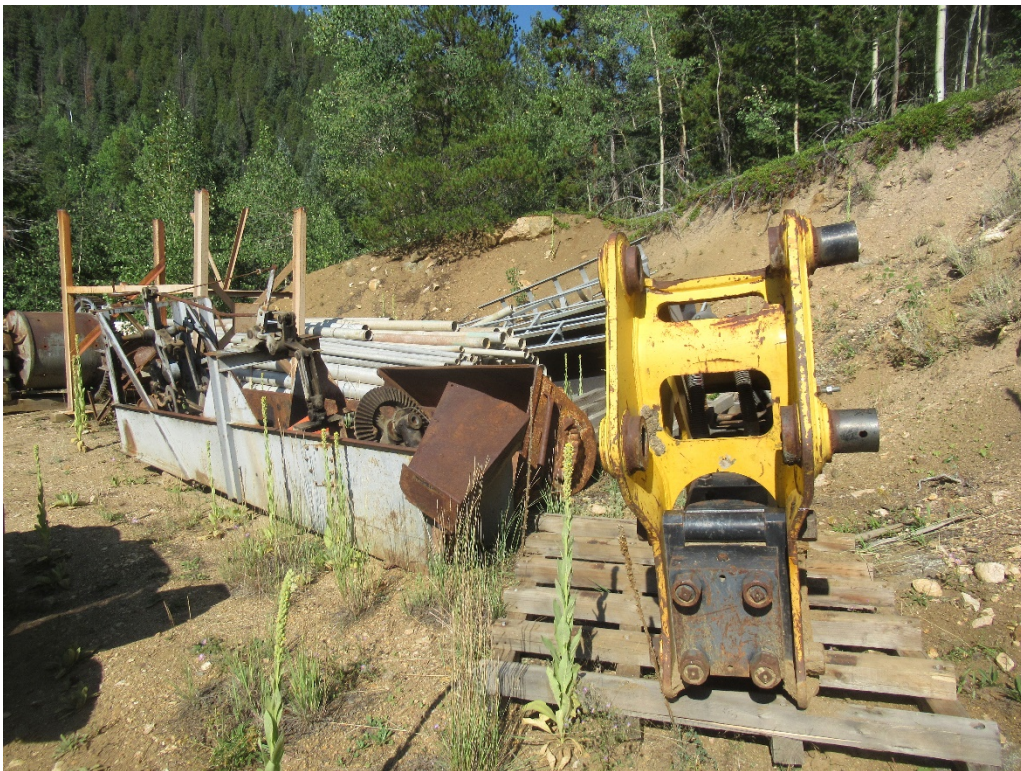
View of equipment storage as shown in the complaint picture