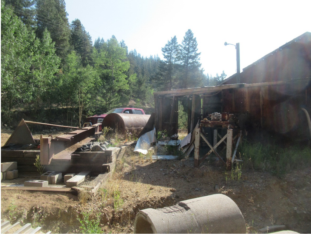
View of equipment storage as shown in the complaint picture, RV removed