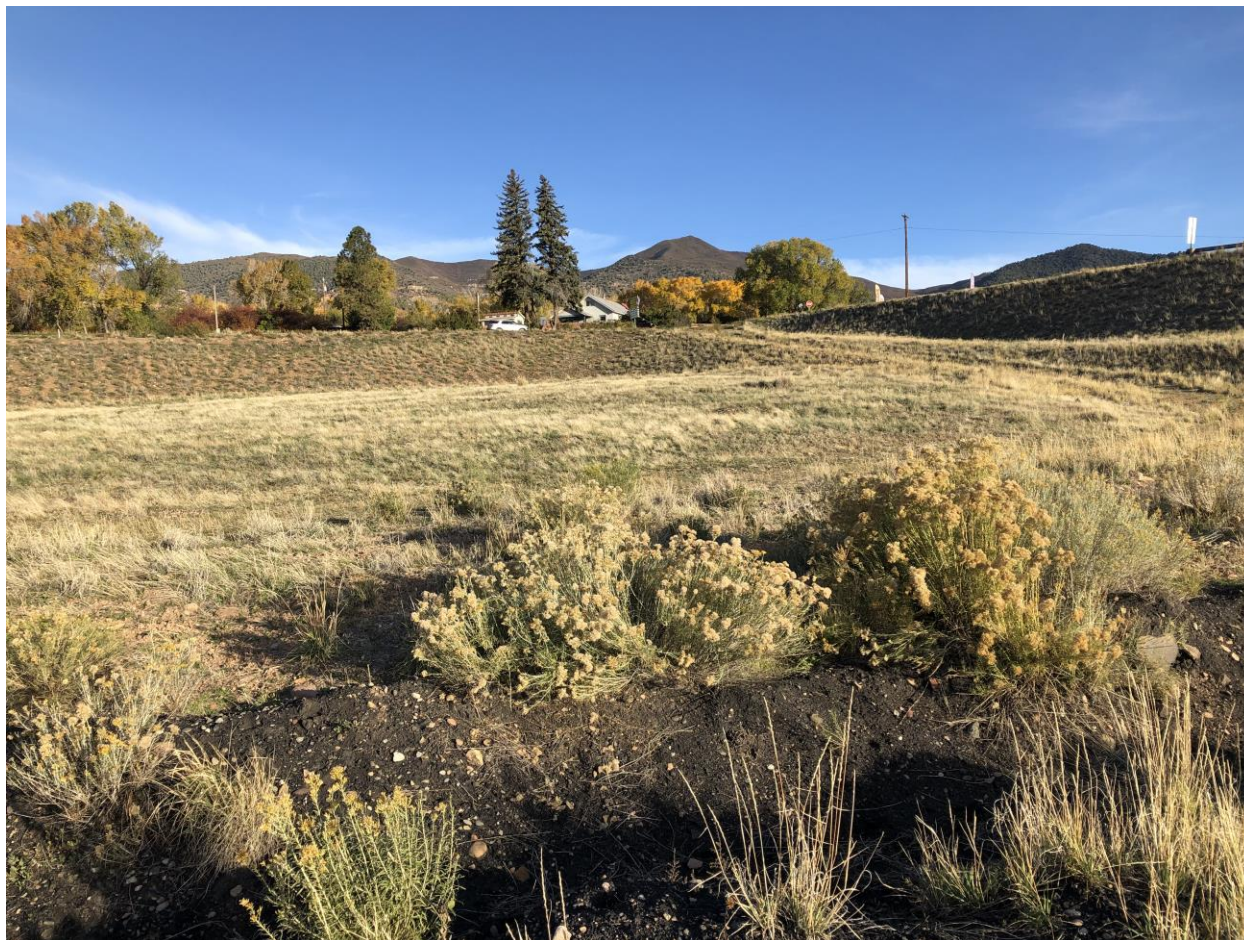
Coal Storage area by Black Bridge Road

Number of Partial Inspection this Fiscal Year: 3