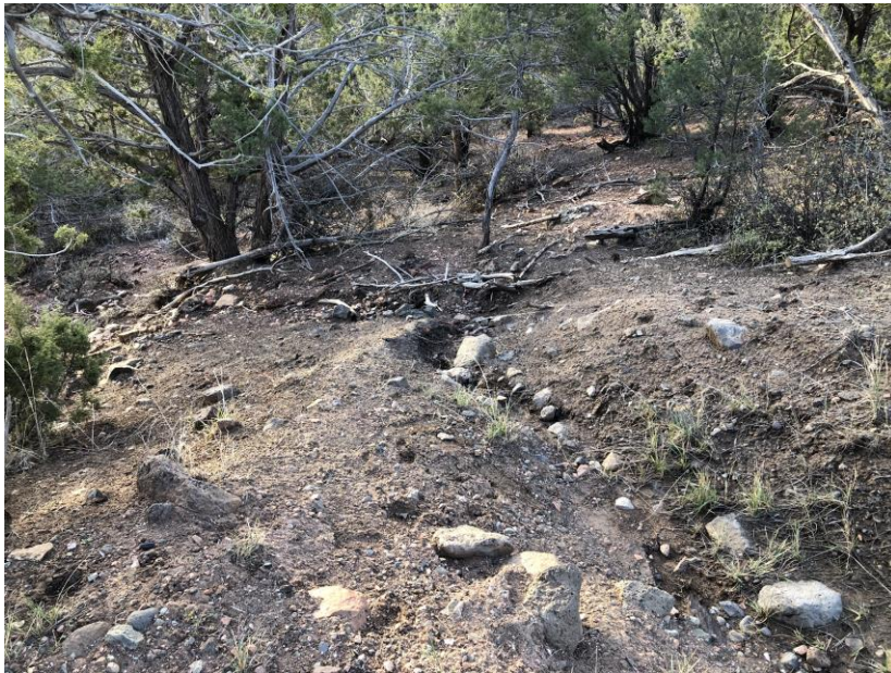
Minor erosion in undisturbed area below RDA

Number of Partial Inspection this Fiscal Year: 3