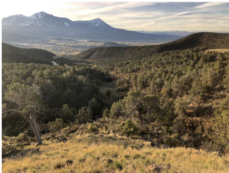
Drainage below Old Waste Pile