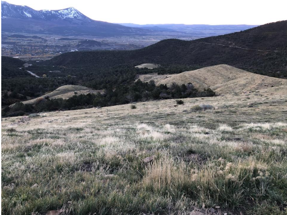
Lower portion of East Mine

Number of Partial Inspection this Fiscal Year: 3