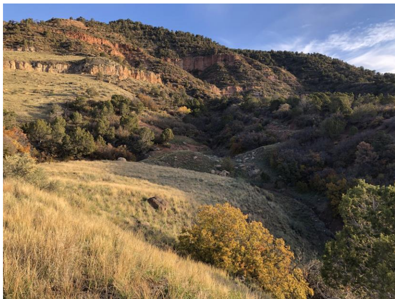
Drainage above Old Waste Pile

Number of Partial Inspection this Fiscal Year: 3