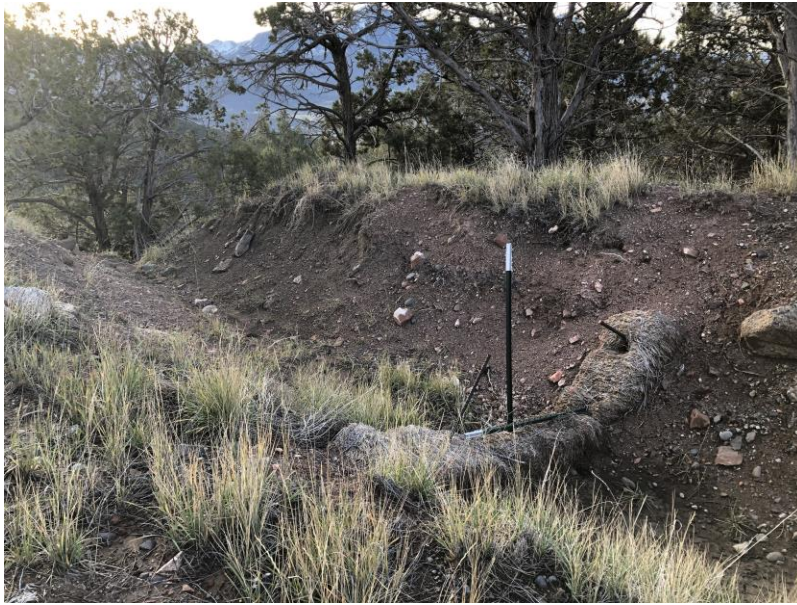
Deteriorating bales below RDA at East Mine