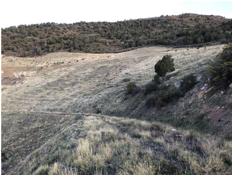
Upper portion of East Mine

Number of Partial Inspection this Fiscal Year: 3