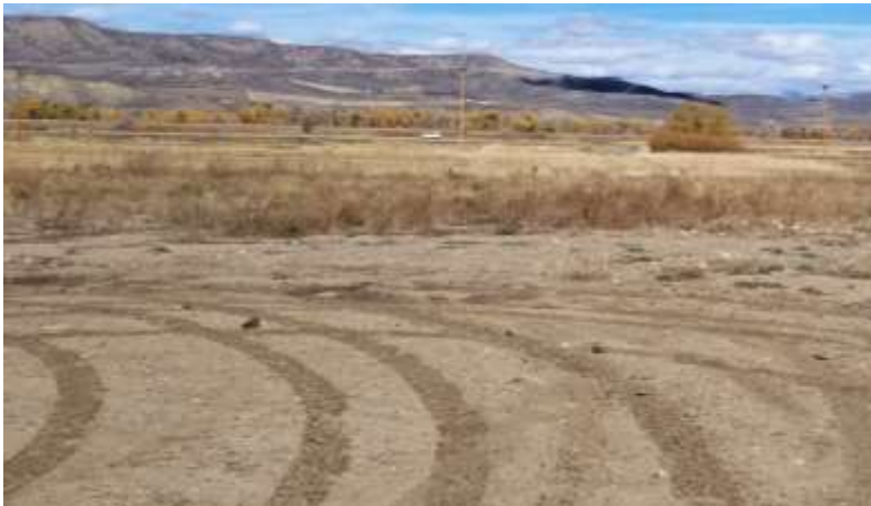
Image above is from parking lot looking North across Hwy40

All railroad tracks have been removed. Area to the north of Hwy 40 is being reclaimed back to an agricultural field and progress appears to be going well.