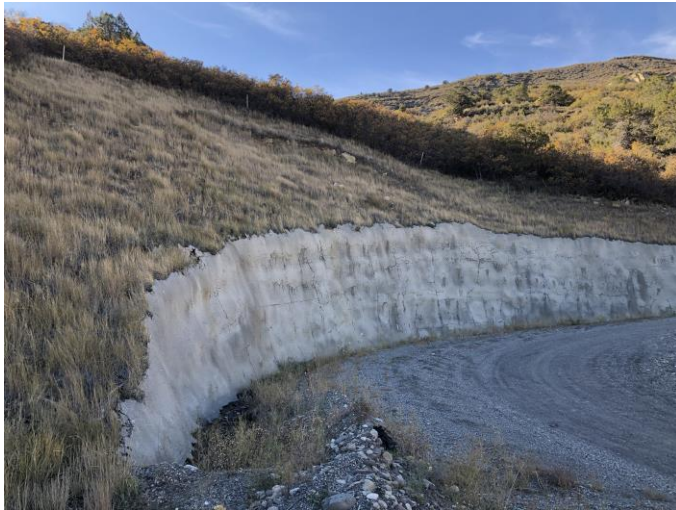
Slump at Curve 11

Number of Partial Inspection this Fiscal Year: 3