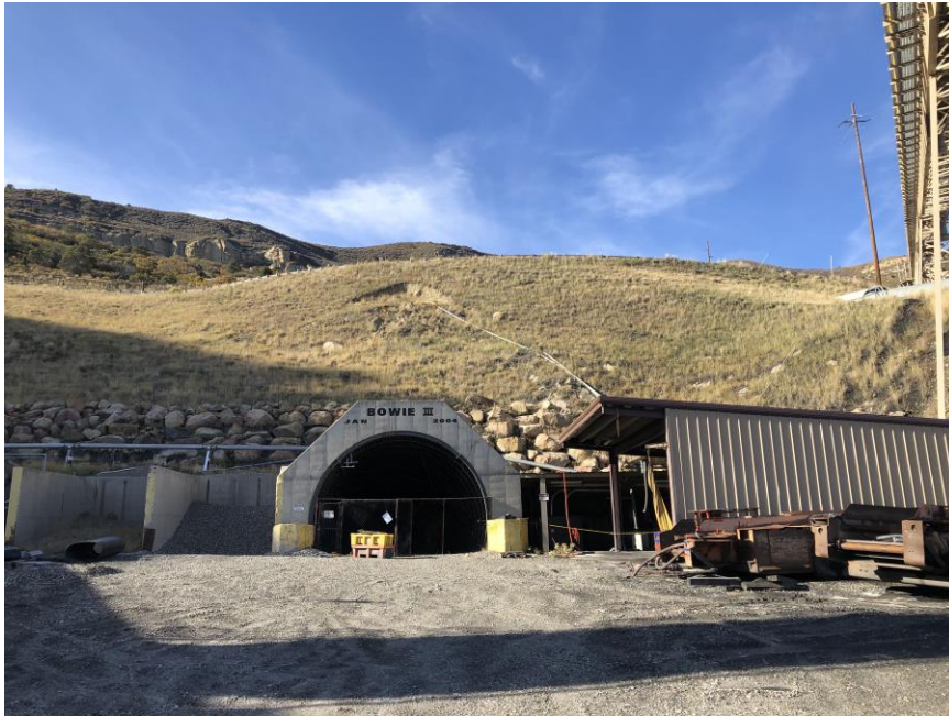
Slump above B Portal bench – appears to be worse