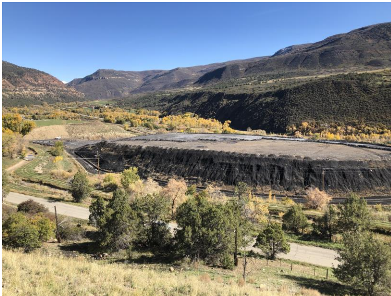
Gob Pile #3 from road above

Number of Partial Inspection this Fiscal Year: 3