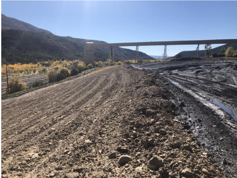
Gob Pile #3 – southwest corner where coverfill material has been recently placed