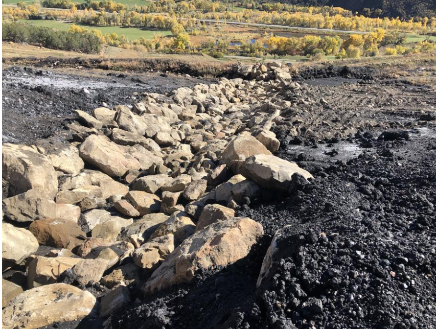
Ditch T-F1 on Gob Pile #2 (recently constructed to replaced “smart” ditch)