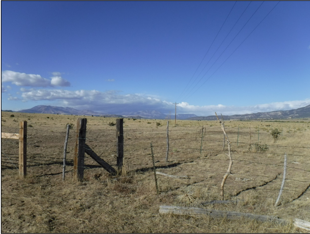
Photo 3: Looking west across the permit in line with the power poles