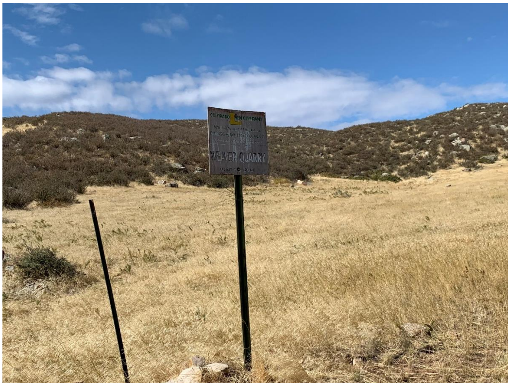
Photo 1 Mine entrance sign needs to be updated with required information