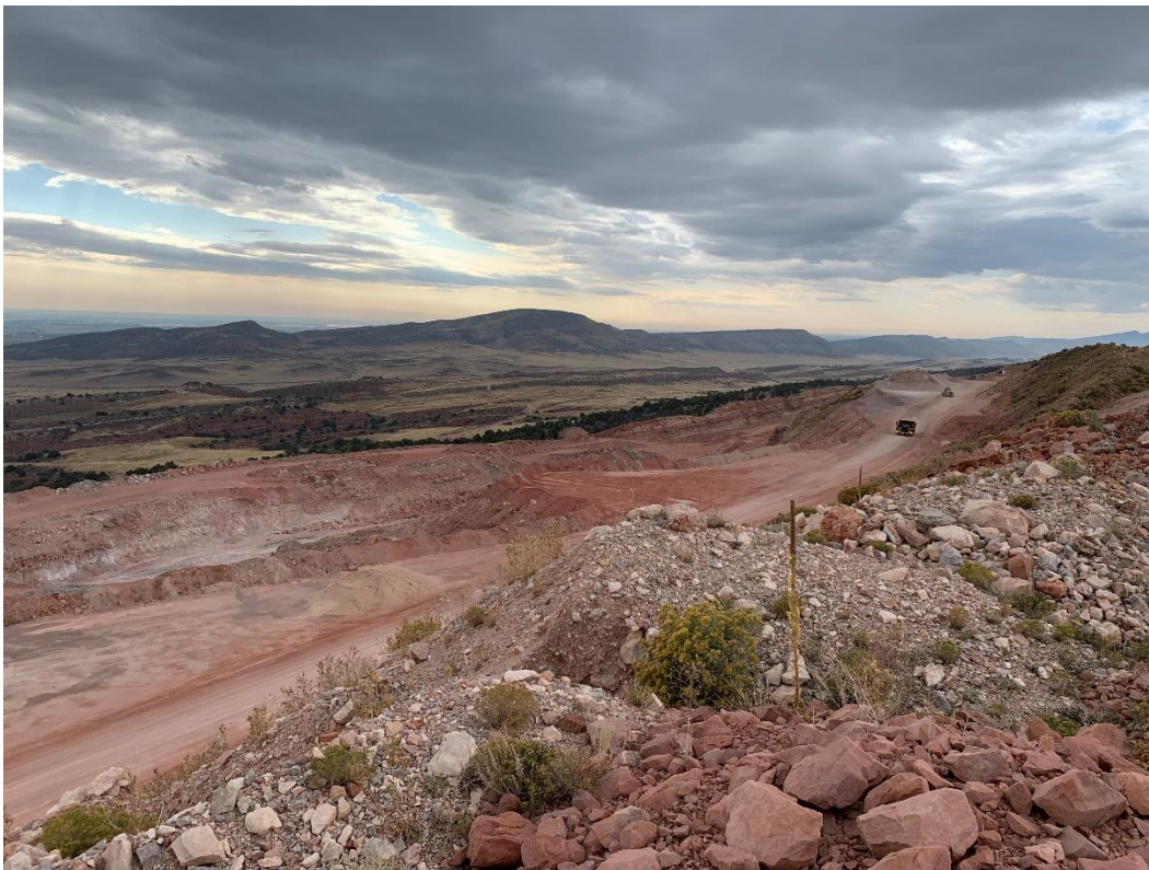
Photo 2 – Main mining area in northern section of permit area, facing southeast